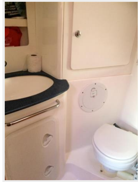
Head and shower compartment