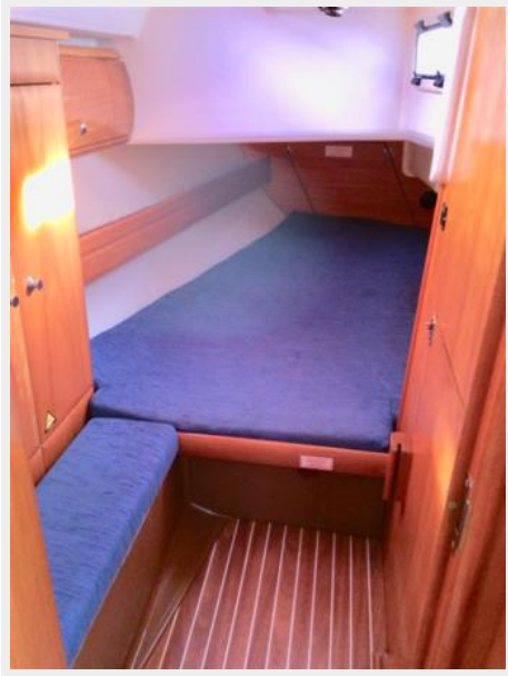
Starboard aft stateroom