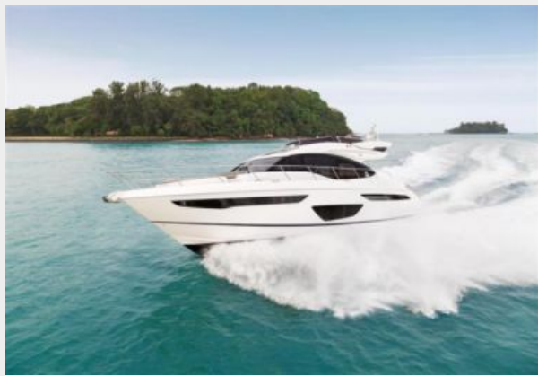
Princess S60 - World Premiere Edition (020517)-3