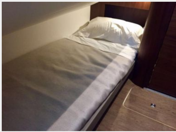
Princess S60 - World Premiere Edition (020517)-46