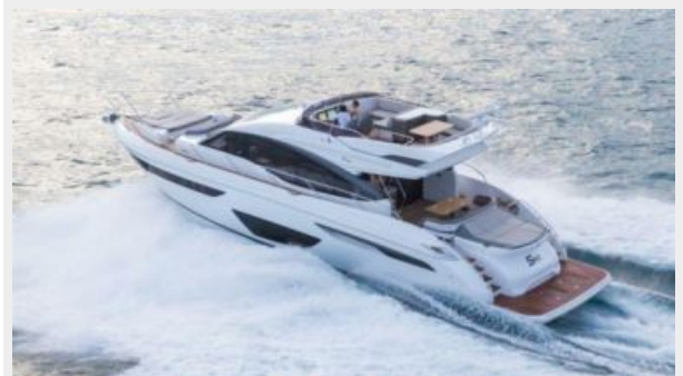
Princess S60 - World Premiere Edition (020517)-6