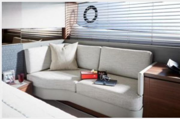
Princess S60 - World Premiere Edition (020517)-34