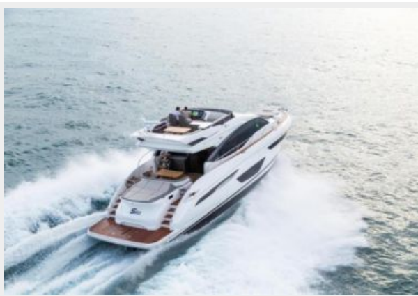
Princess S60 - World Premiere Edition (020517)-5