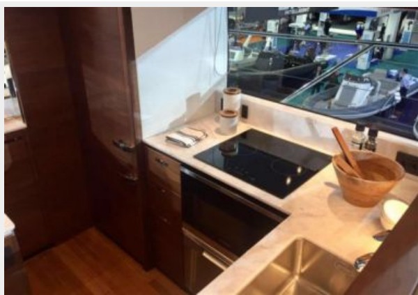
Princess S60 - World Premiere Edition (020517)-21