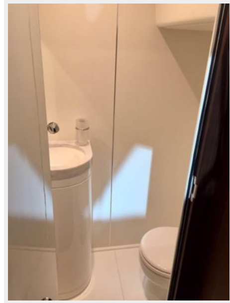
Princess S60 - World Premiere Edition (020517)-47