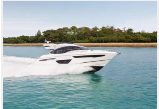
Princess S60 - World Premiere Edition (020517)-4