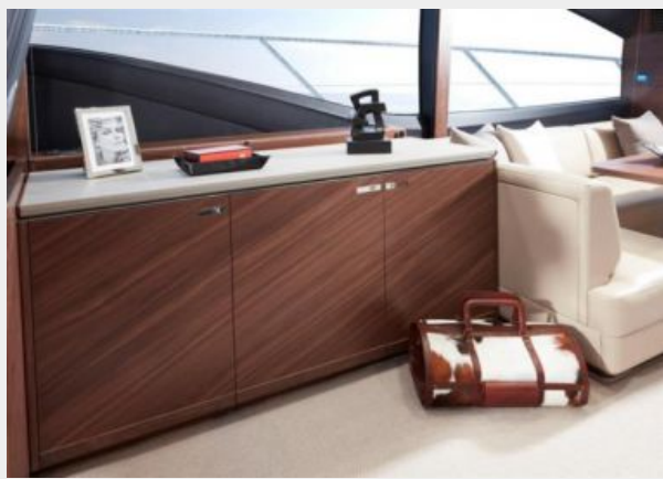
Princess S60 - World Premiere Edition (020517)-29