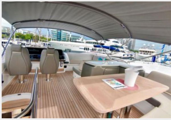
Princess S60 - World Premiere Edition (020517)-42