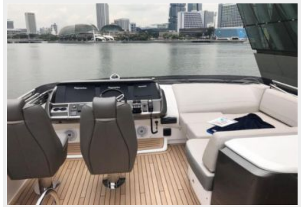
Princess S60 - World Premiere Edition (020517)-43