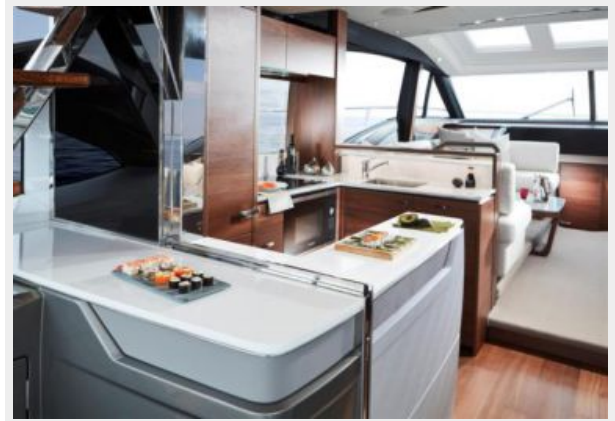
Princess S60 - World Premiere Edition (020517)-20