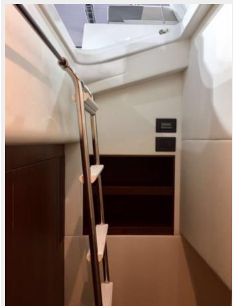
Princess S60 - World Premiere Edition (020517)-44