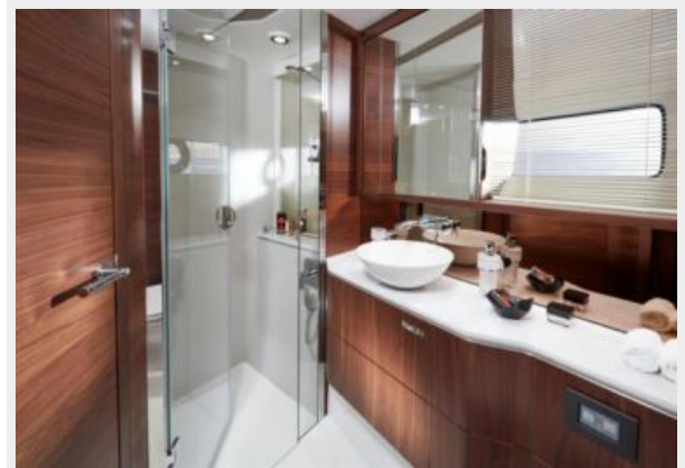
Princess S60 - World Premiere Edition (020517)-39