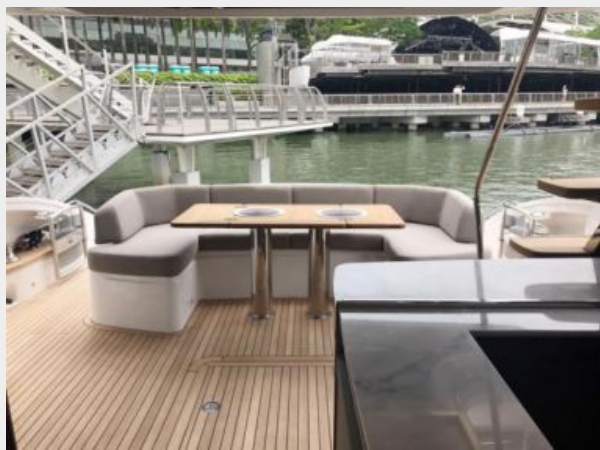
Princess S60 - World Premiere Edition (020517)-19