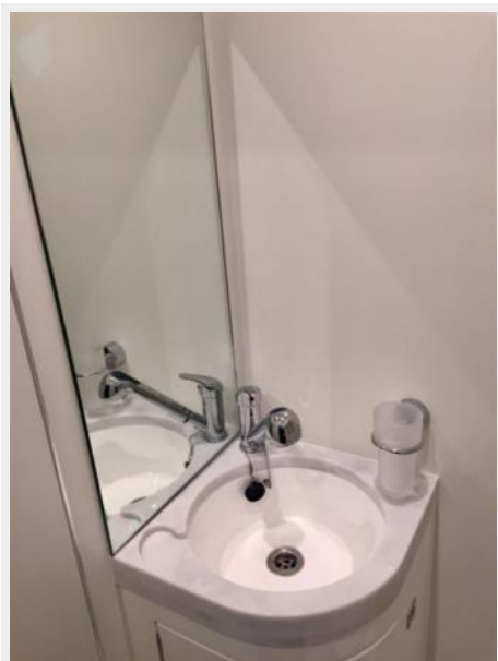
Princess S60 - World Premiere Edition (020517)-48