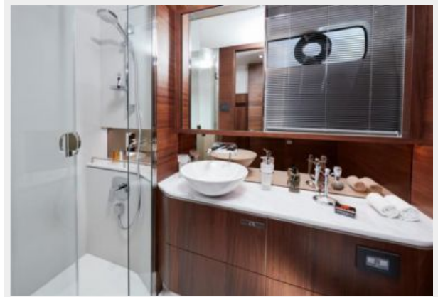
Princess S60 - World Premiere Edition (020517)-36