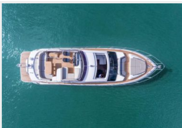
Princess S60 - World Premiere Edition (020517)-17