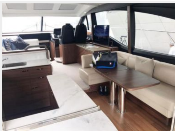
Princess S60 - World Premiere Edition (020517)-24