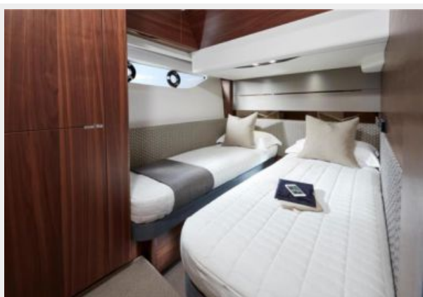
Princess S60 - World Premiere Edition (020517)-40