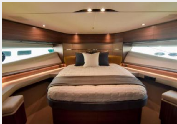
Princess S60 - World Premiere Edition (020517)-38