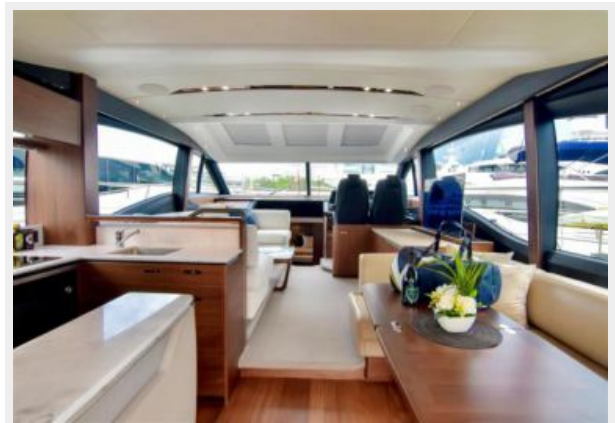
Princess S60 - World Premiere Edition (020517)-23