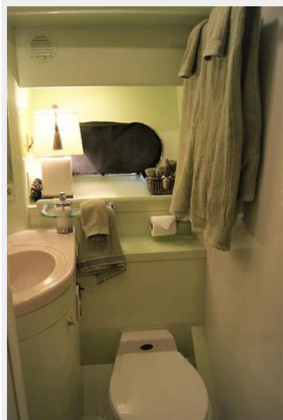
260 Master Head