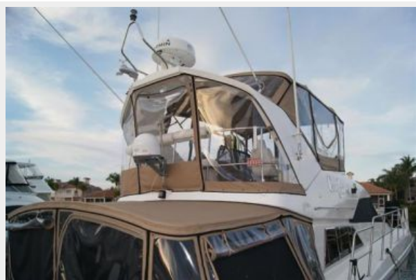
109 Flybridge Encl