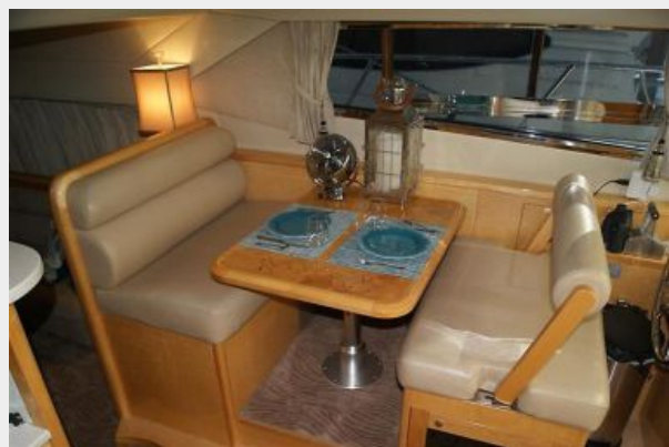
232 Dinette Table to Port