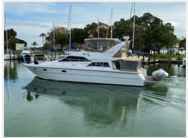
100 HR (Copy)