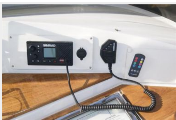
309 Simrad VHF