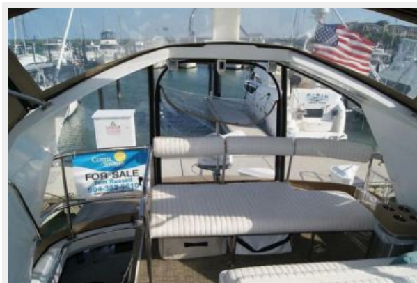
216 Flybridge to Aft