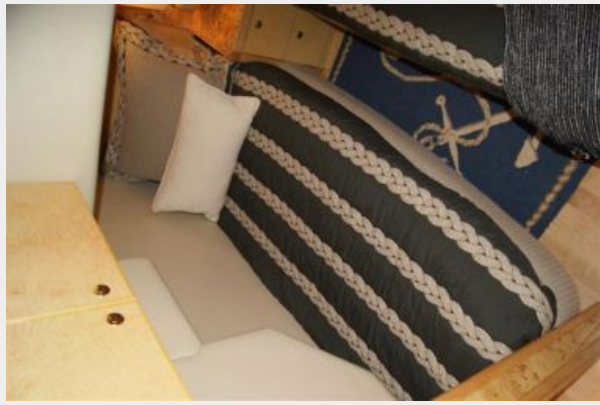
281 Bunk Guestroom Twin Bed and Pantry