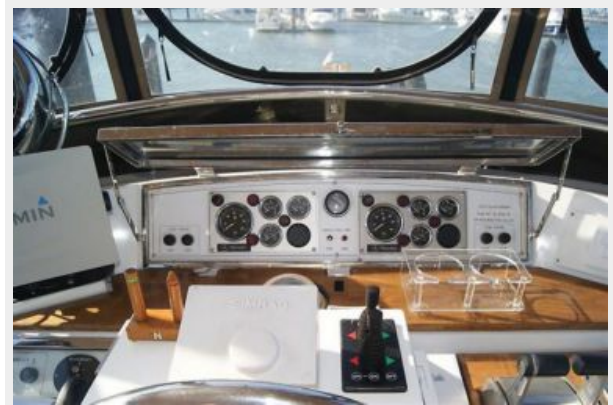
211 Flybridge Helm