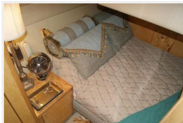
270 VIP Stateroom