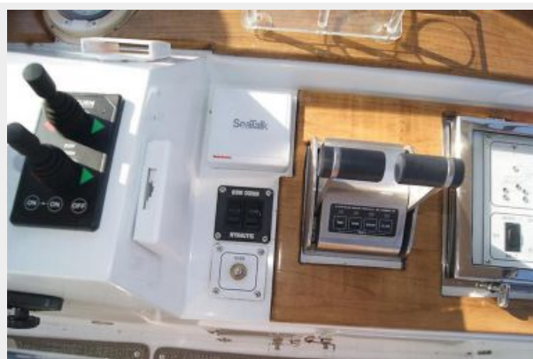
305 Throttle Thruster Trim