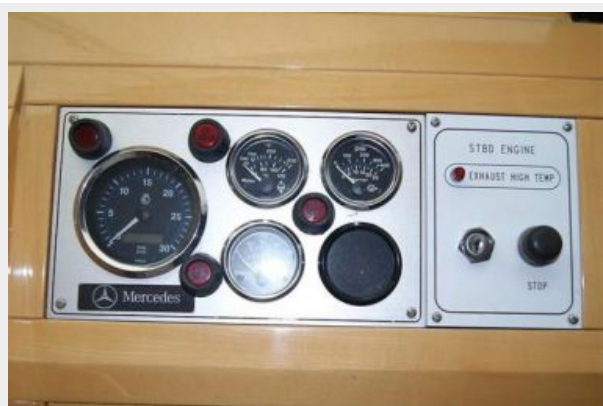
312 Stbd Engine Panel