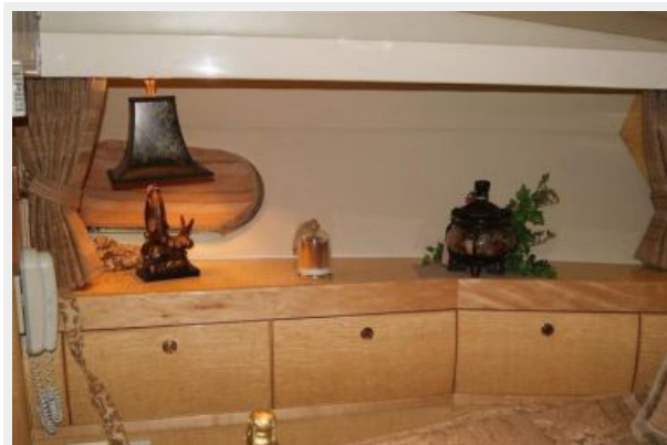
253 Master to Port