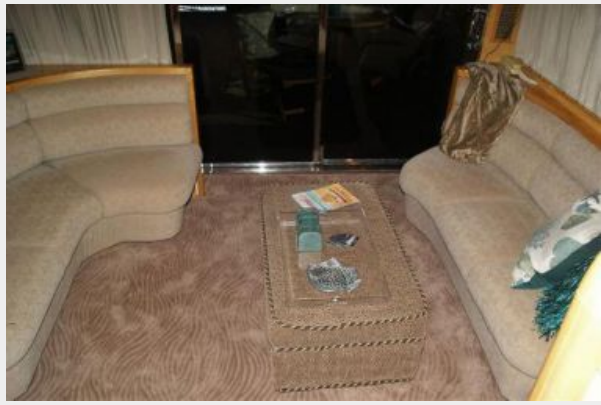
221 Salon to Aft