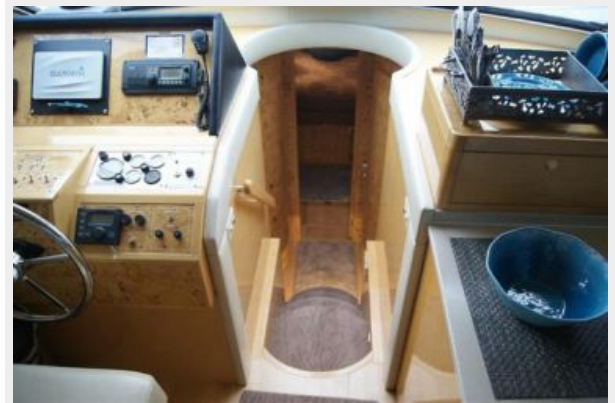
241 Helm Stairs Forward