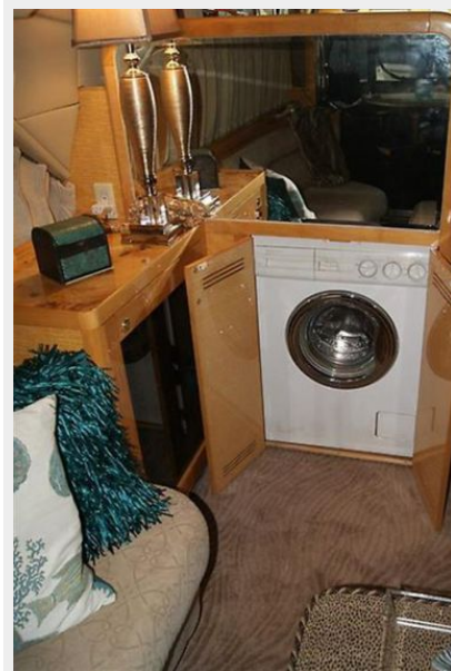
226 Salon Washer Dryer