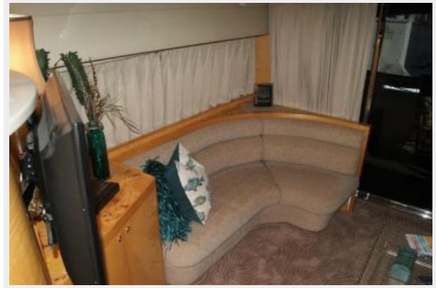
222 Salon to Starboard