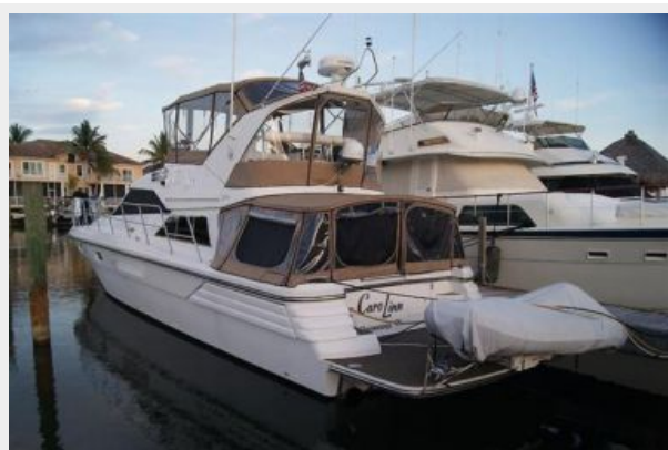
107 Port Stern