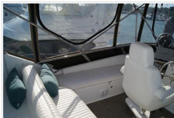
218 Flybridge to Port