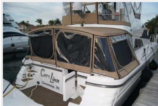
106 Cockpit Encl