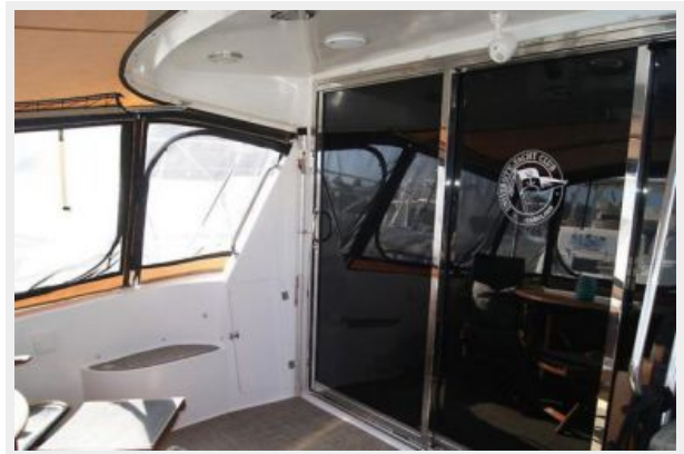
201 Entrance to Salon