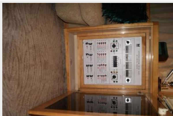
227 Salon Electrical Panel