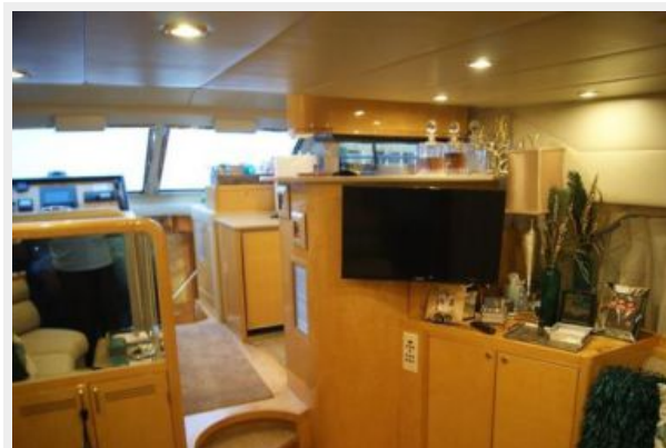
229 Salon Fwd