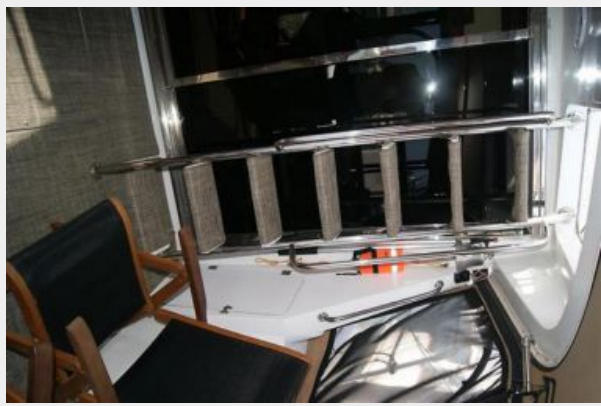
204 Cockpit Stairs to Flybridge