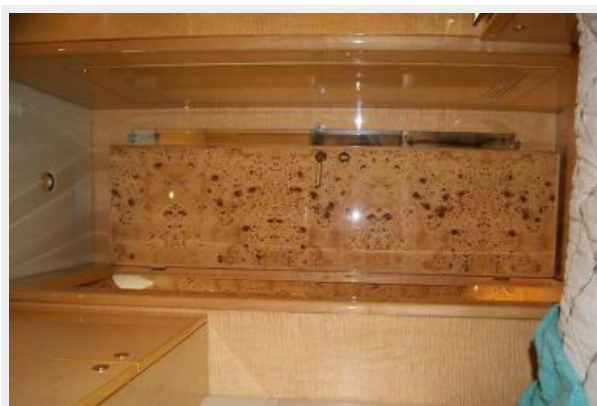
272 VIP Stateroom Joinery