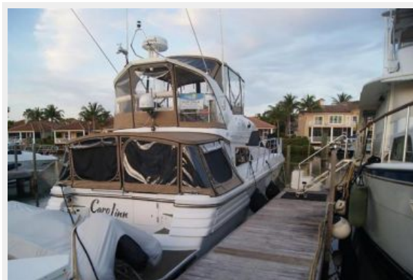
108 Starboard Stern