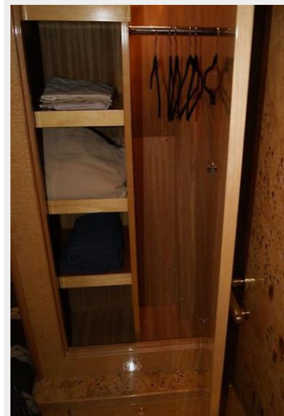
285 Guest Stateroom Locker Storage