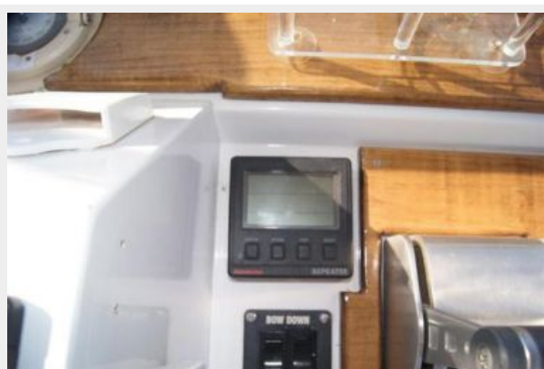
307 Raymarine Repeater