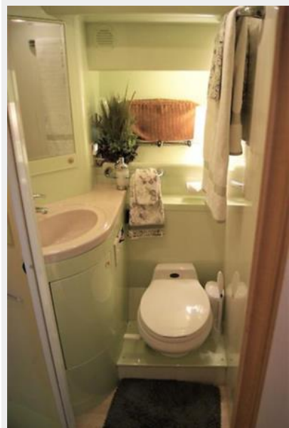
291 Guest Head