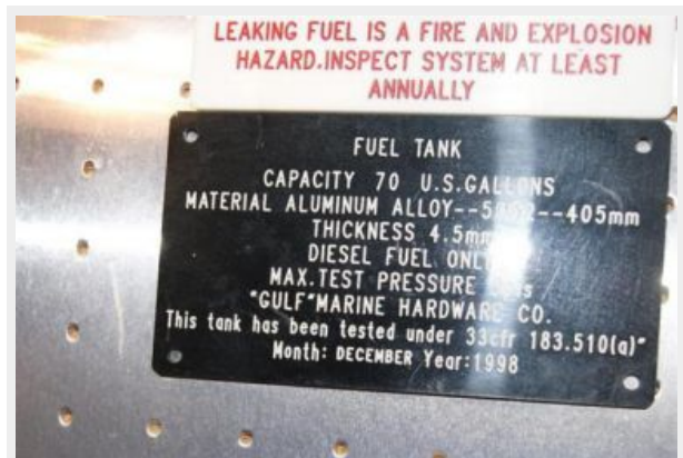
335 Fuel Tank Label