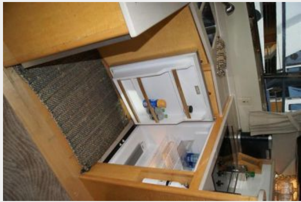
239 Galley Refrigerator