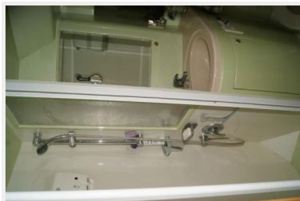
296 Guest Head Shower