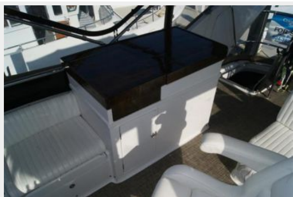
215 Flybridge Wet Bar