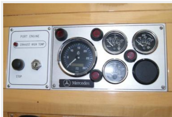
311 Port Engine Panel