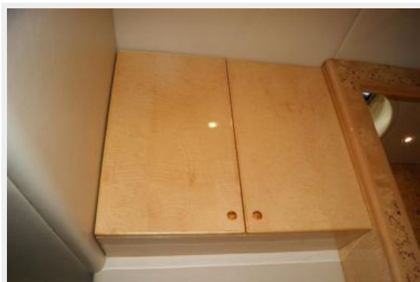
273 VIP Stateroom Pantry