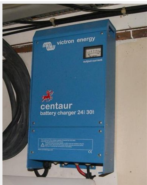
341 Centaur 24v 30A Batt Charger