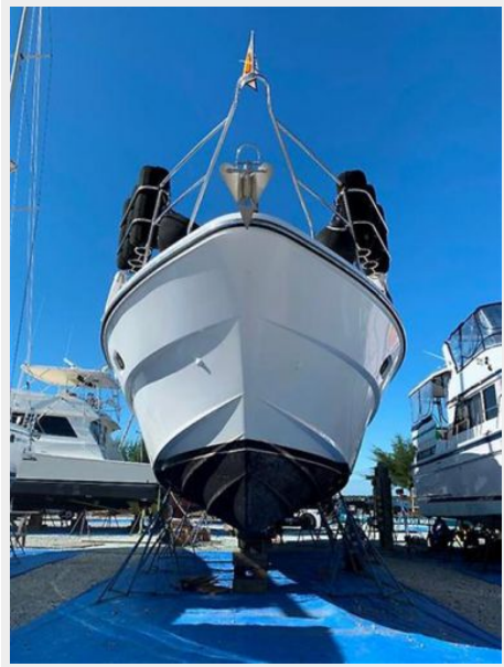
118 On the Hard