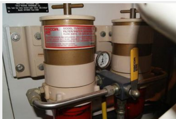
334 Stbd Racor & Guage