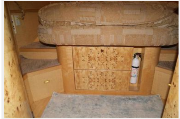
257 Master Drawer Storage