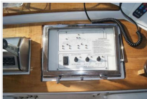
306 System Status