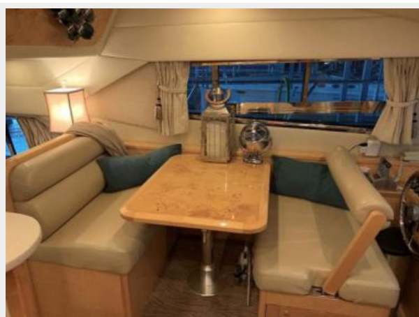
230 Dinette Table to Port