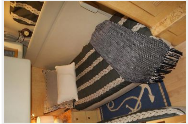
285 Guest Stateroom Locker Storage