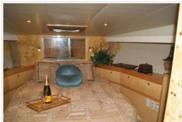
251 Master Berth