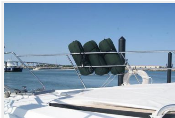
112 Fender Rack