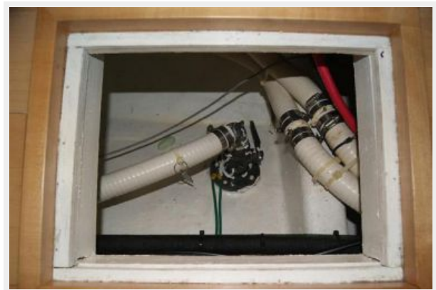
361 Tank Top