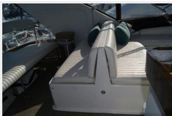
217 Flybridge Aft Port Seating