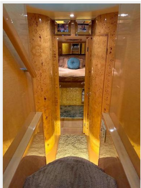
244 Master Entrance