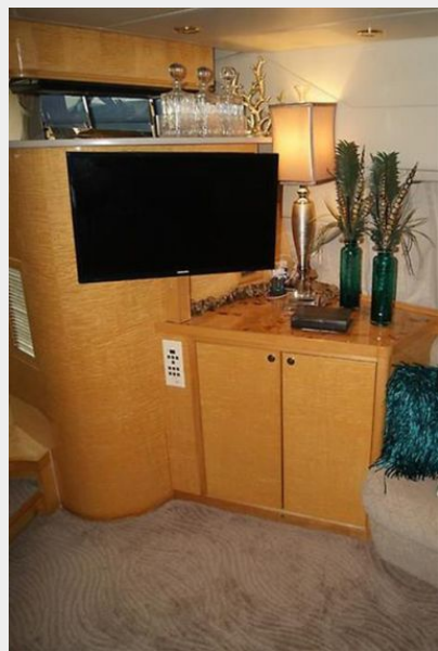
223 Salon Cabinet Starboard