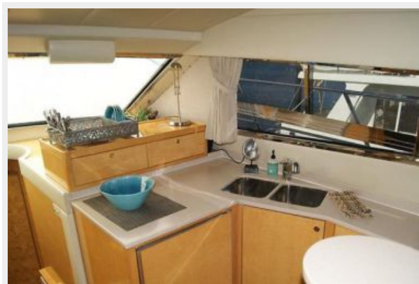
236 Galley to Forward