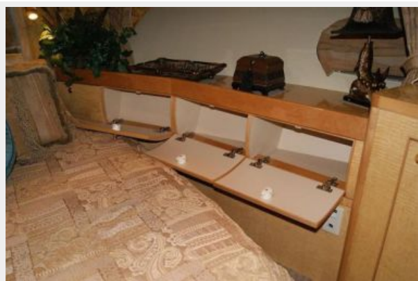
254 Master Storage