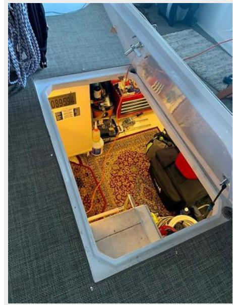
205 Eng Rm Access