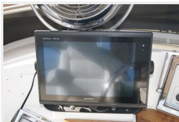
308 Garmin 7612