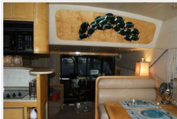
234 Helm to Aft