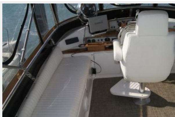
219 Flybridge to Port Forward