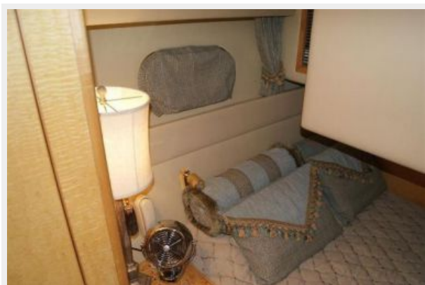
271 VIP Stateroom to Starboard