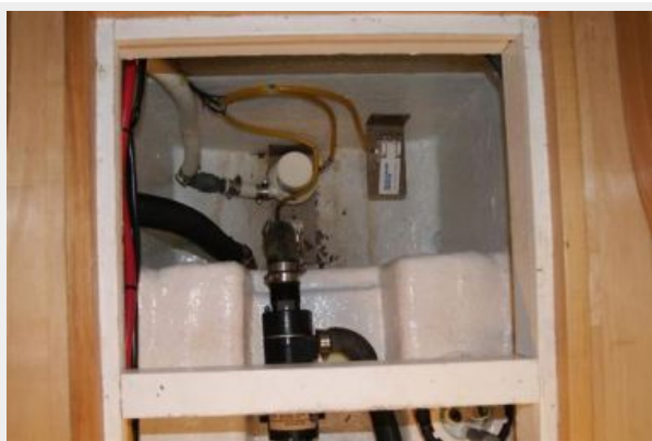
362 Tank & Bilge Area