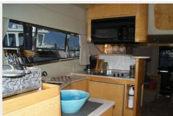
235 Galley to Starboard