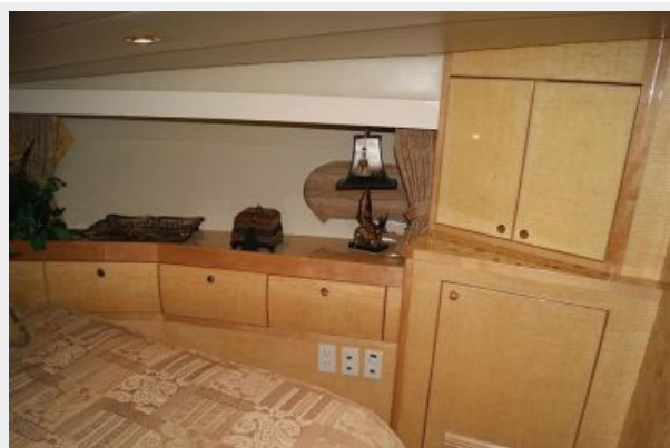
252 Master to Starboard