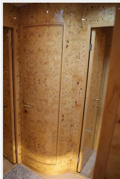
242 Landing Joinery