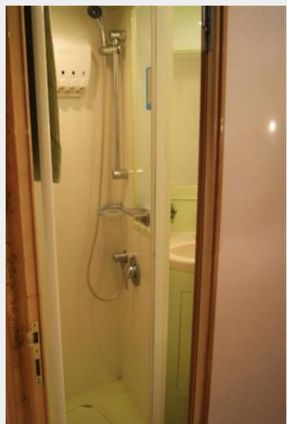
262 Master Head Shower