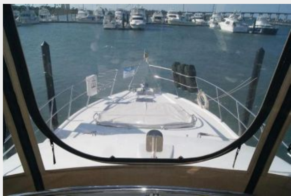
213 Flybridge to Foredeck