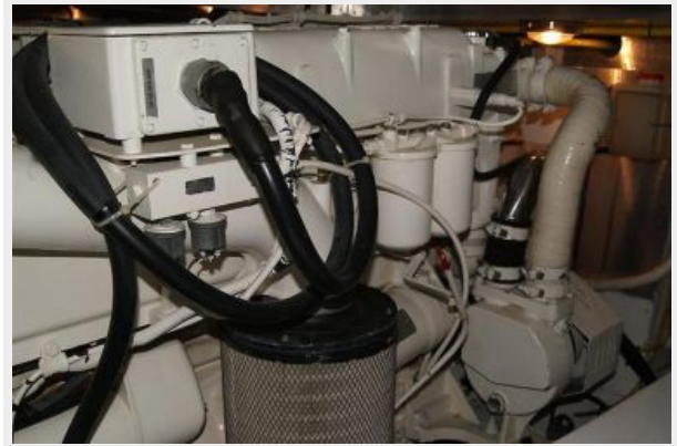
330 Port Engine Filters