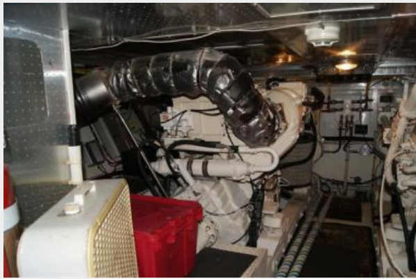
329 Port Engine