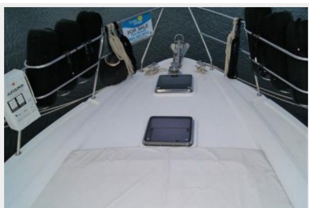
116 Foredeck Covers