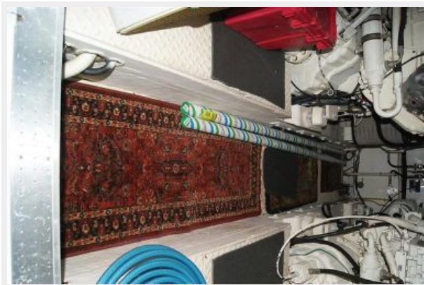
327 ER Deck