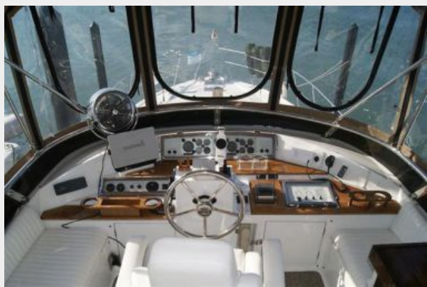
210 Flybridge to Forward