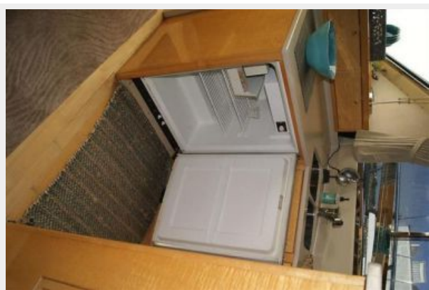
237 Galley Freezer