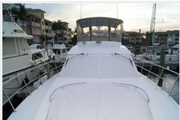
111 Bow to Aft