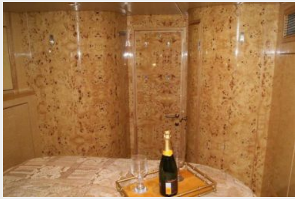
256 Master Joinery