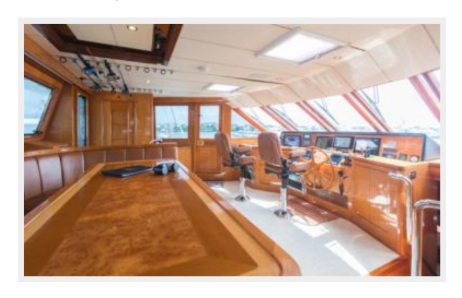
pilothouse and settee