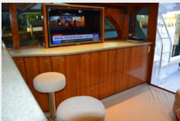
Salon Pop-Up TV