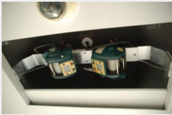
Miya Epoch Teaser reels