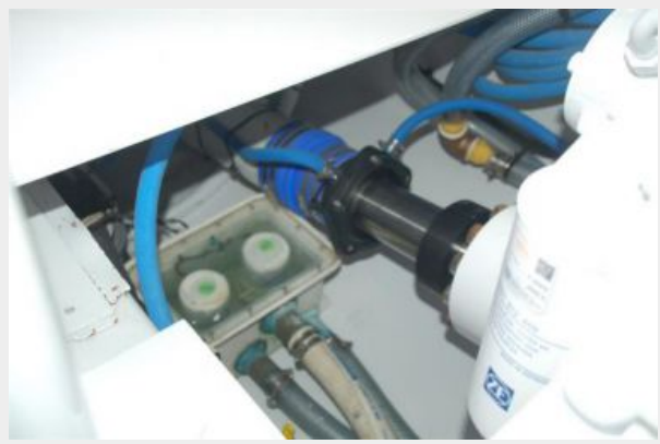
Tide shaft seals