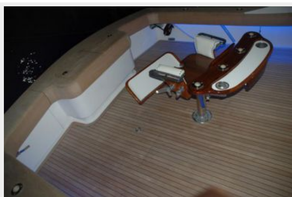
Cockpit with lighting