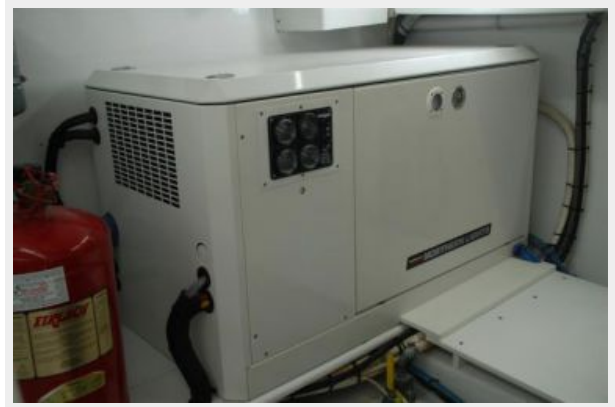
Northern Lights 20kW