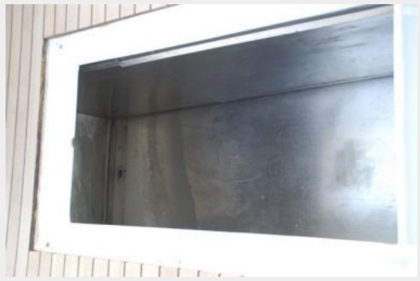
Underdeck fish box