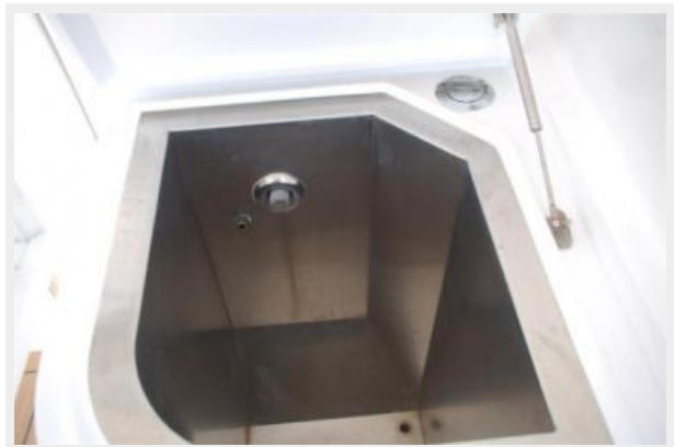
Crushed ice storage