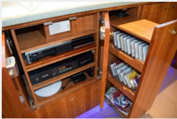
Storage stbd salon