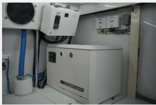
Northern Lights 8kW