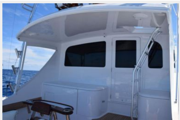
Large overhang with spray curtains