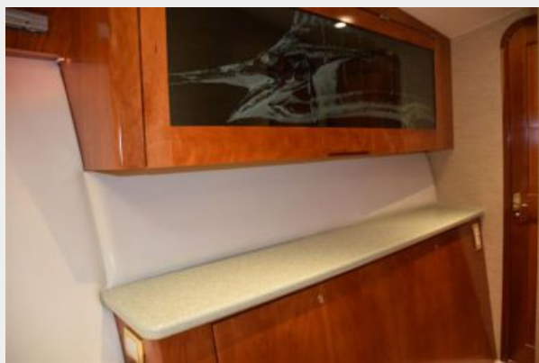
Fwd stateroom tackle storage cabinet