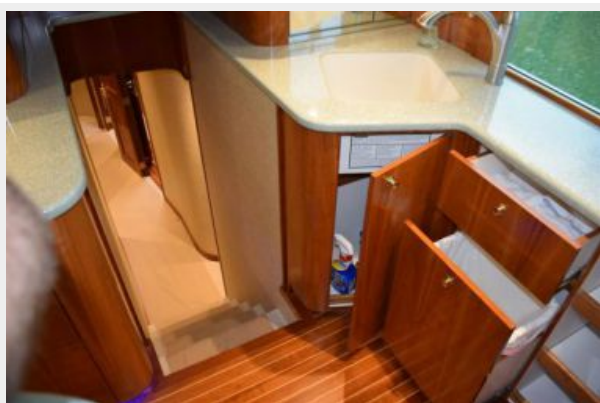
Galley storage and top of companionway