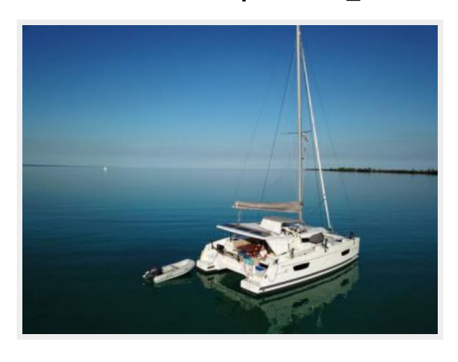
2018 FPL40 FMK iphoneDJI_0393