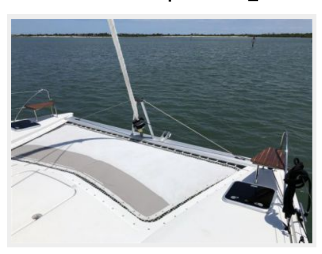
2018 FPL40 FMK iphonelMG_5618