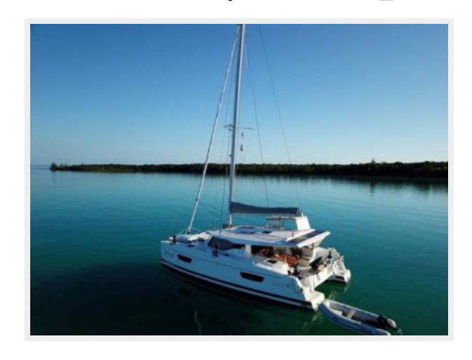
2018 FPL40 FMK iphone25%DJI_0389