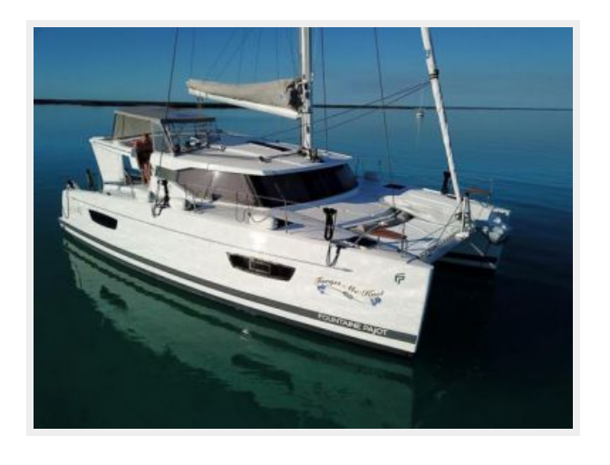
2018 FPL40 FMK iphone25%DJI_0400