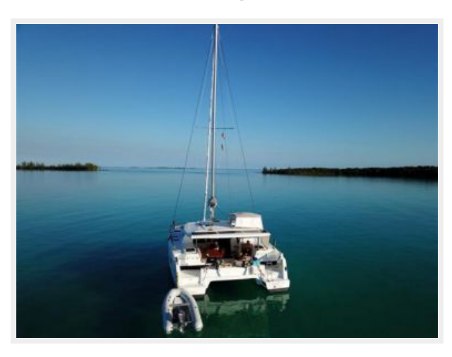
2018 FPL40 FMK iphoneDJI_0391