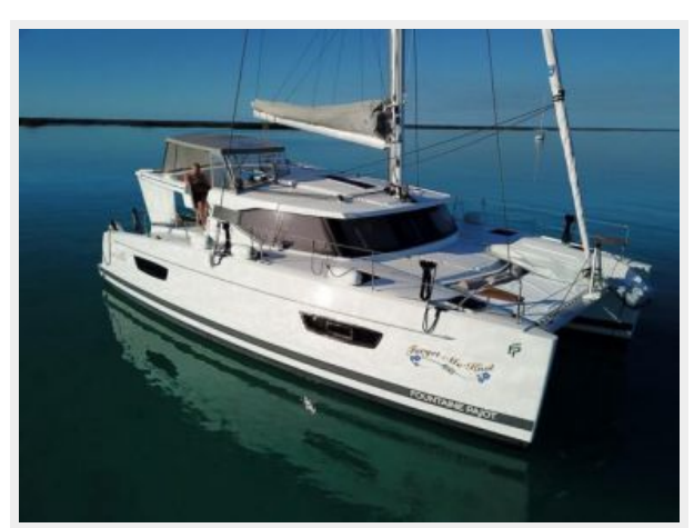
2018 FPL40 FMK iphone 25% DJI \_0399