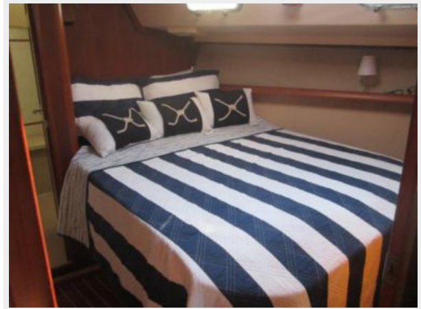
#6-2002 Island Packet 420 STAY FOOLISH Master cabin