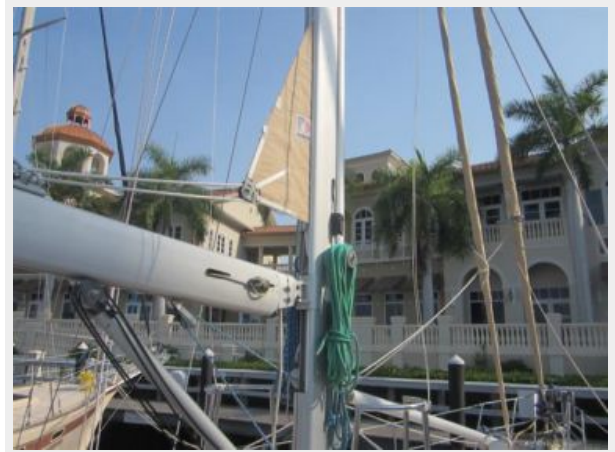
#24 2002 Island Packet 420 STAY FOOLISH In-mast furling mainsail