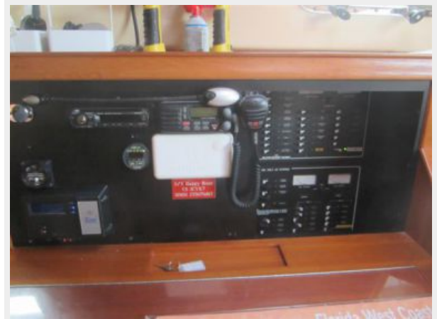
#12 2002 Island Packet 420 STAY FOOLISH Nav. station