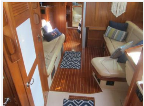
#8 2002 Island Packet 420 STAY FOOLISH Cabin