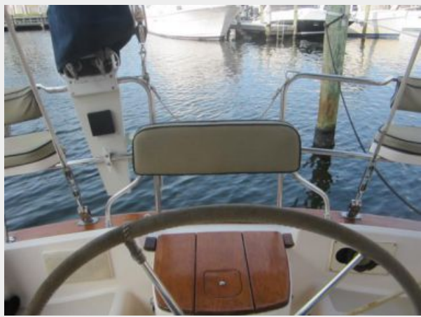
#23 2002 Island Packet 420 STAY FOOLISH Helm seat