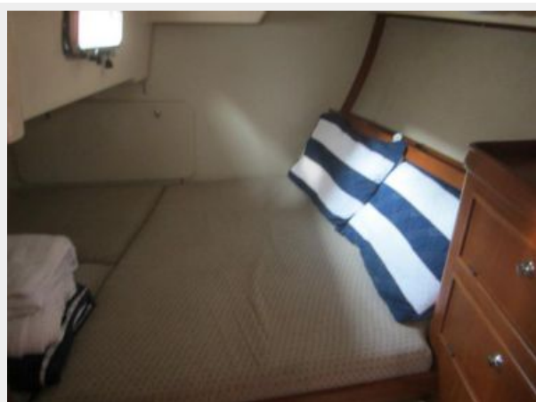
#17 2002 Island Packet 420 STAY FOOLISH Aft cabin