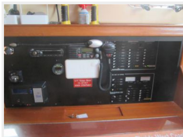
#12 2002 Island Packet 420 STAY FOOLISH Nav. station