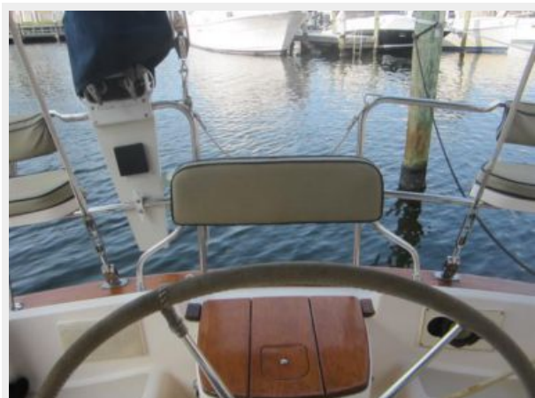
#23 2002 Island Packet 420 STAY FOOLISH Helm seat