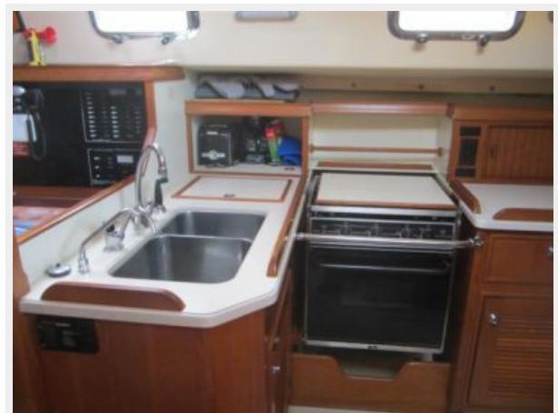
#14 2002 Island Packet 420 STAY FOOLISH Galley-2