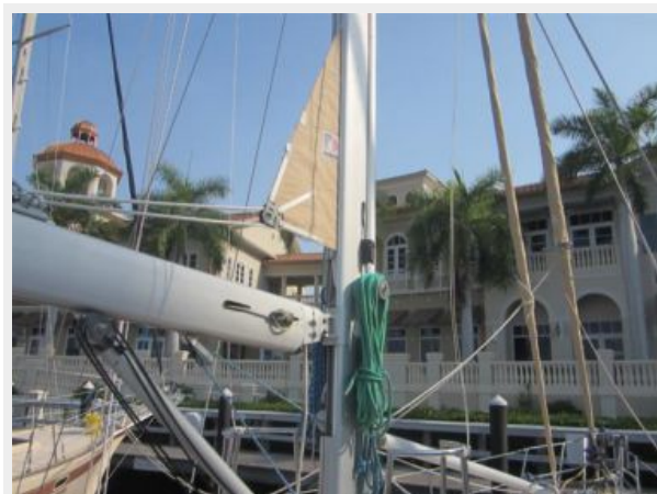
#24 2002 Island Packet 420 STAY FOOLISH In-mast furling mainsail