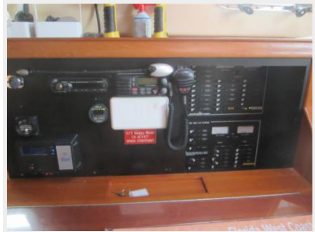
#12 2002 Island Packet 420 STAY FOOLISH Nav. station