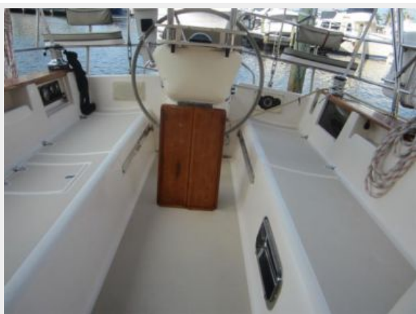
#19 2002 Island Packet 420 STAY FOLISH Cockpit seating