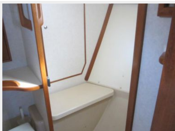
#5 2002 Island Packet 420 STAY FOOLISH Master shower