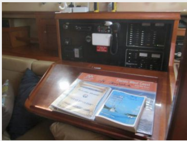
#11 2002 Island Packet 420 STAY FOOLISH Nav. Desk