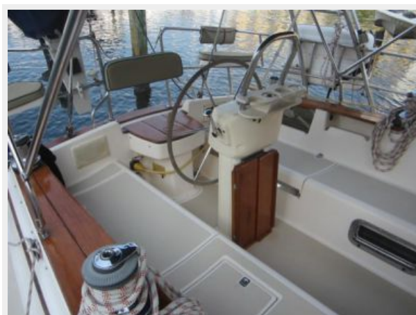
#20 2002 Island Packet 420 STAY FOOLISH Cockpit