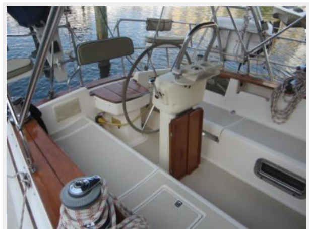
#20 2002 Island Packet 420 STAY FOOLISH Cockpit