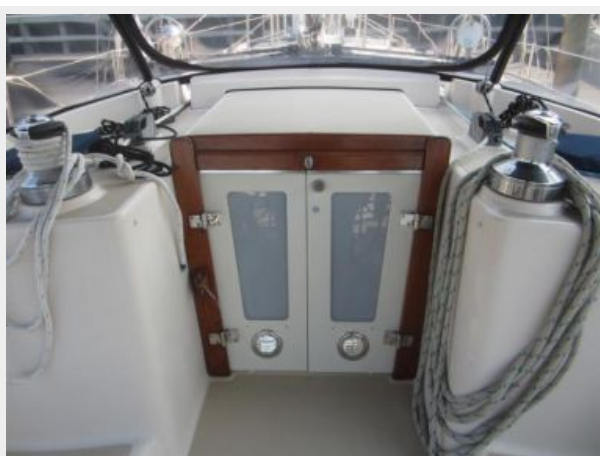
#21 2002 Island Packet 420 STAY FOOLISH Entry