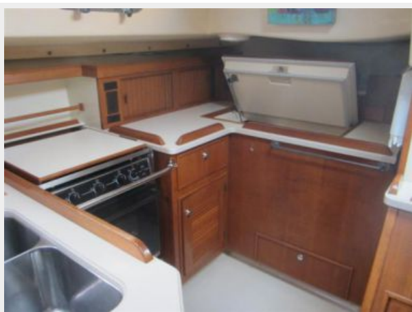
#13 2002 Island Packet 420 STAY FOOLISH Galley