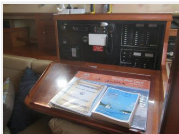
#11 2002 Island Packet 420 STAY FOOLISH Nav. Desk