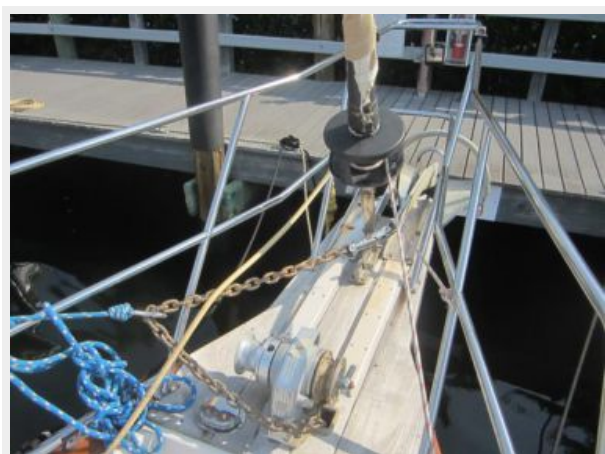
#25 2002 Island Packet 420 STAY FOOLISH Ground tackle