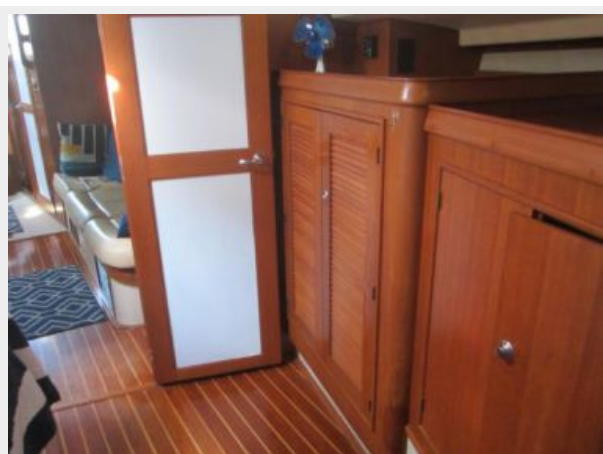
#7 2002 Island Packet 420 STAY FOOLISH Storage