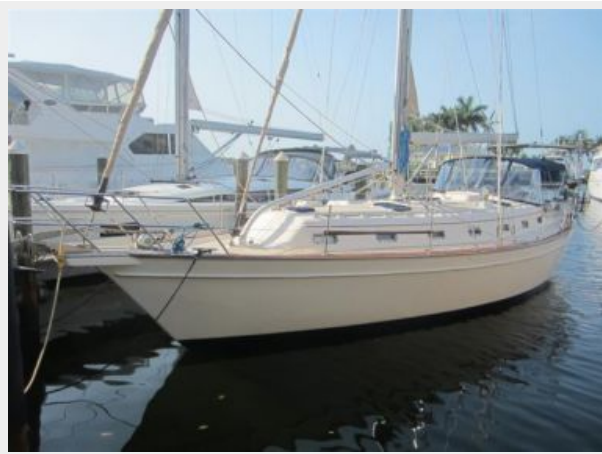
#1-2002 Island Packet 420 STAY FOOLISH