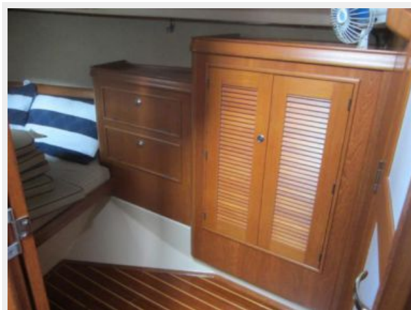
#18 2002 Island Packet 420 STAY FOOLISH aft cabin storage