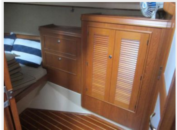
#18 2002 Island Packet 420 STAY FOOLISH aft cabin storage