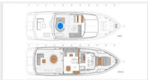
INACE 90 Explora_G.A_01