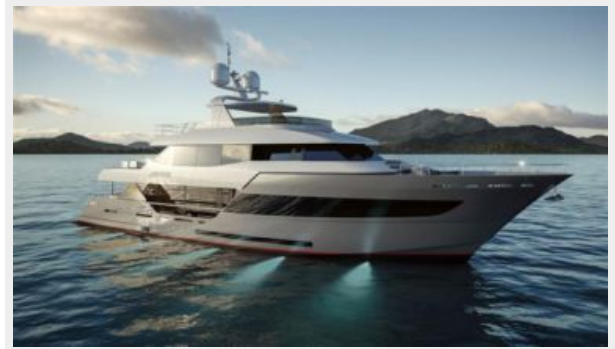
A 100 -Image 02-HR