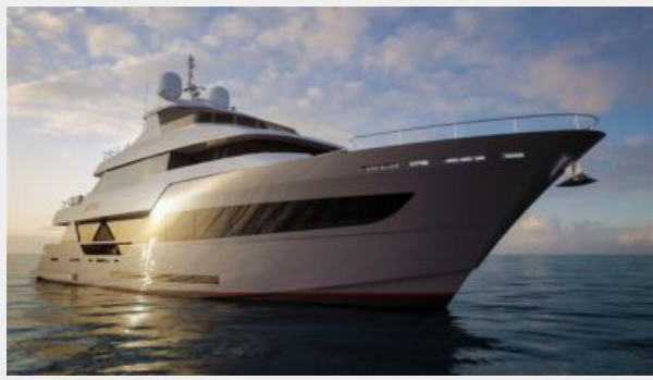
A 100 -Image 05-HR