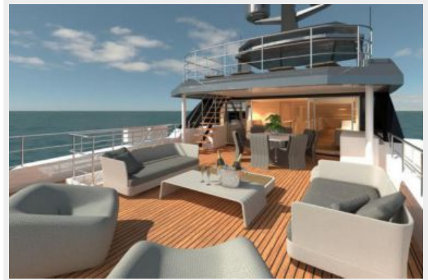
A 100 -Image 06-HR