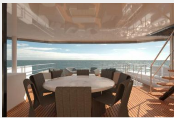
A 100 -Image 07-HR