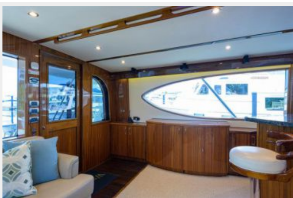
Salon Entertainment Area