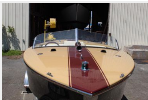
5 20 Cherubini Veloce 2009