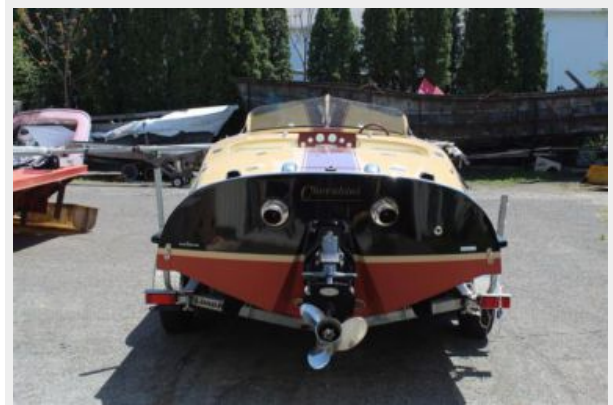
2 Cherubini Veloce 20 2009