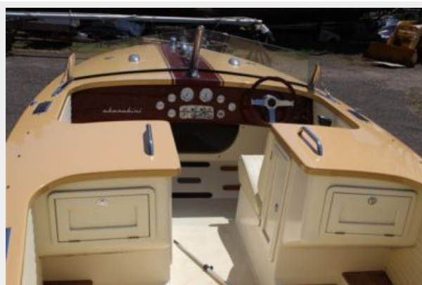
3 20 Cherubini Veloce 2009