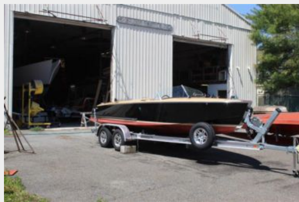
1 20 Cherubini Veloce 2009