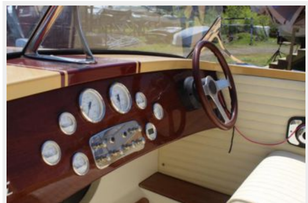
4 20 Cherubini Veloce 2009