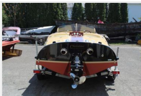
2 Cherubini Veloce 20 2009