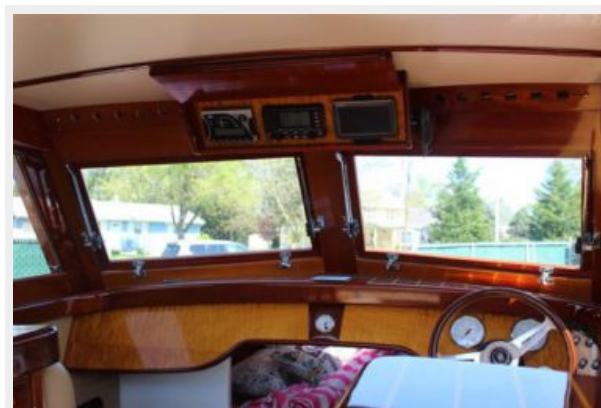
10 Cherubini 255 Sport Cruiser 2013