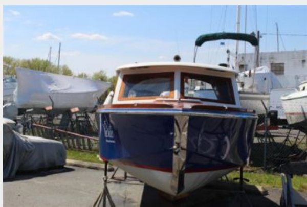
3 Cherubini 255 Sport Cruiser 2013