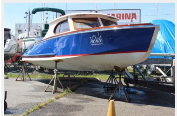
4 Cherubini 255 Sport Cruiser 2013