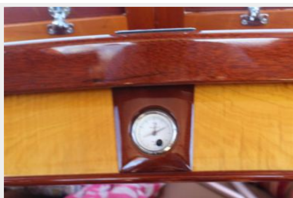
11 Cherubini 255 Sport Cruiser 2013