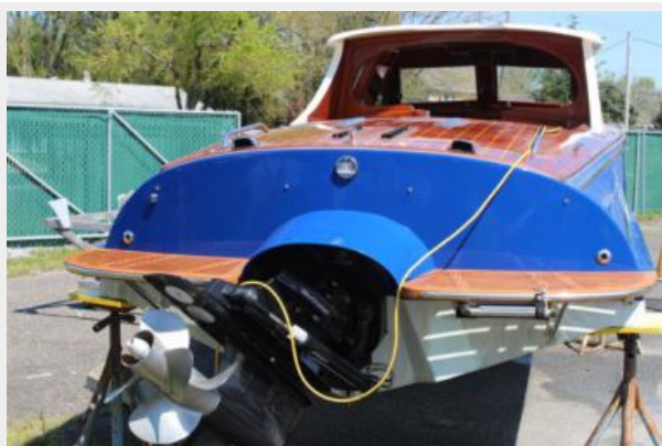
5 Cherubini 255 Sport Cruiser 2013