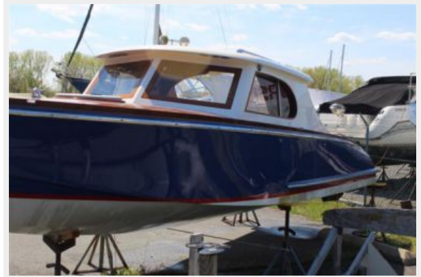
2 Cherubini 255 Sport Cruiser 2013