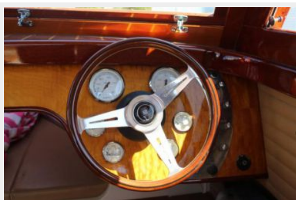
9 Cherubini 255 Sport Cruiser 2013