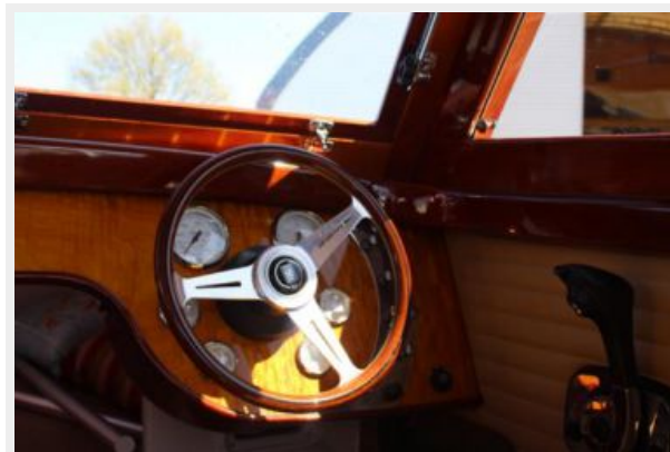
8 Cherubini 255 Sport Cruiser 2013