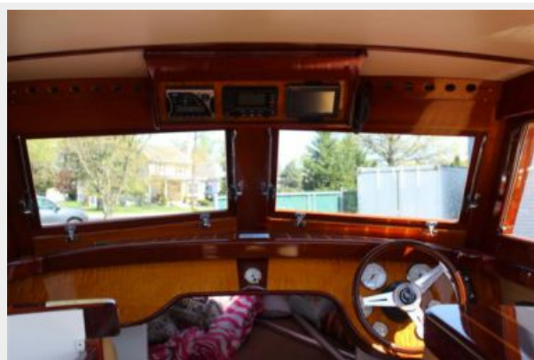
7 Cherubini 255 Sport Cruiser 2013