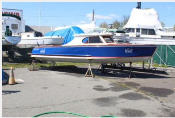
1 Cherubini 255 Sport Cruiser 2013