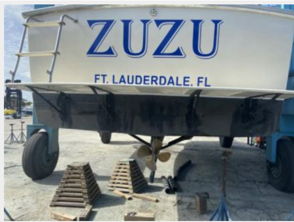
33 - 34' Mainship