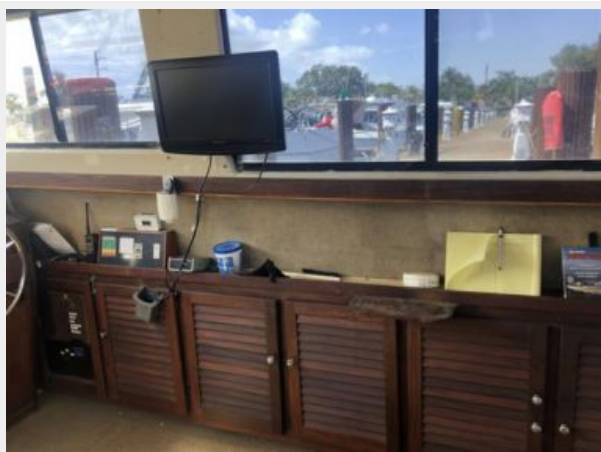
9 - 34' Mainship