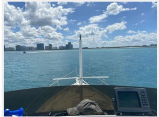
32 - 34' Mainship