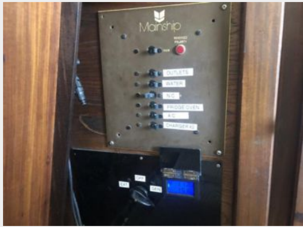
13 - 34' Mainship