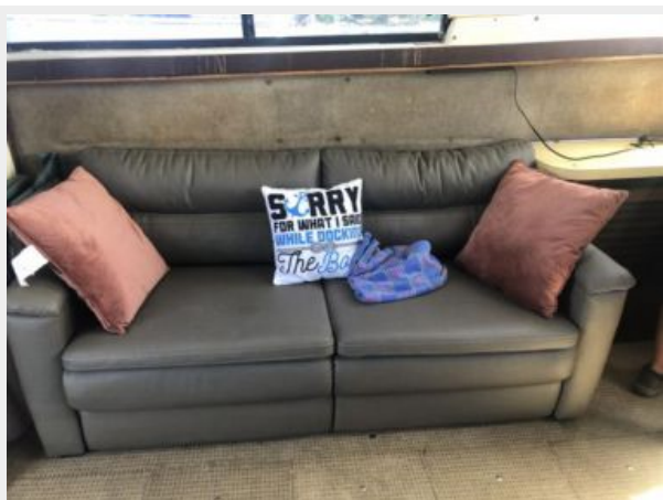
11 - 34' Mainship