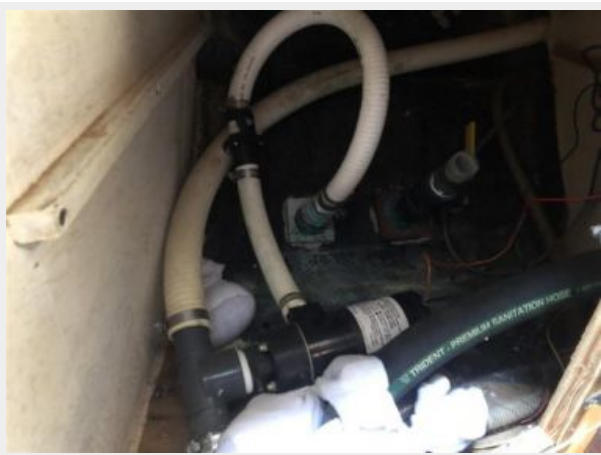
29 - 34' Mainship