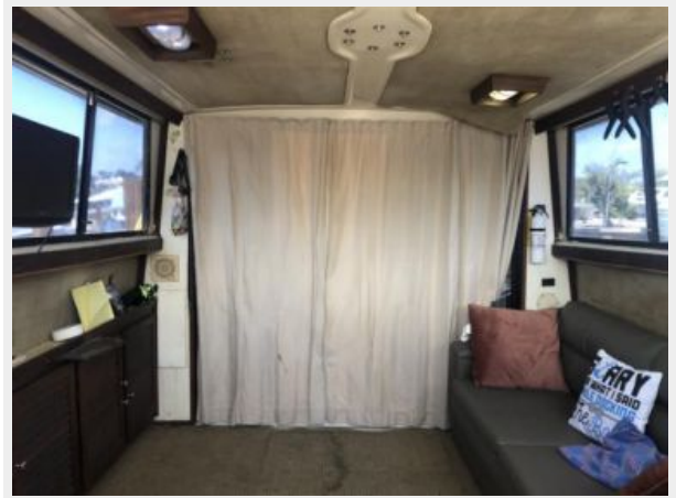
8 - 34' Mainship