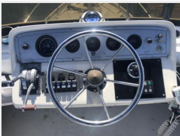
23 - 34' Mainship