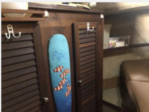
21 - 34' Mainship