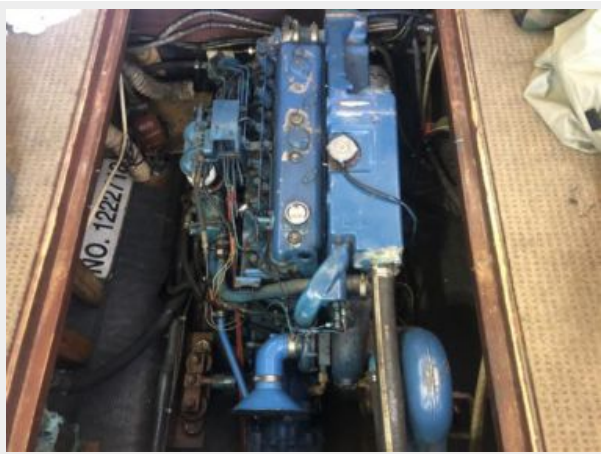
27 - 34' Mainship