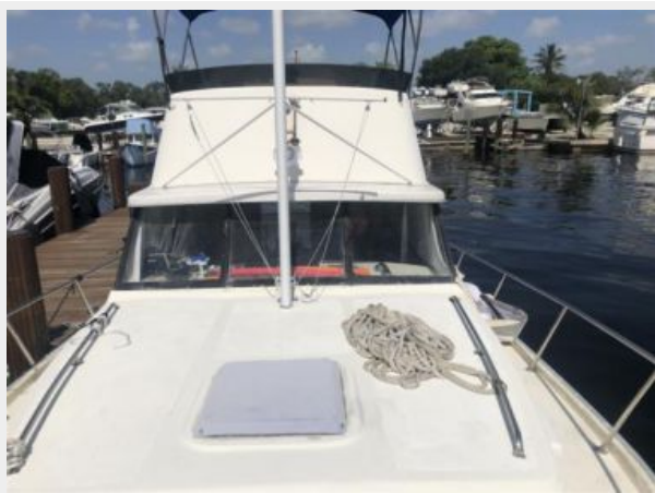
5 - 34' Mainship