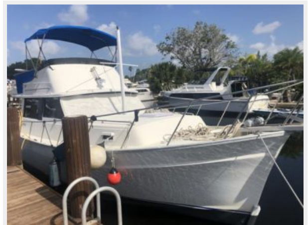
4 - 34' Mainship