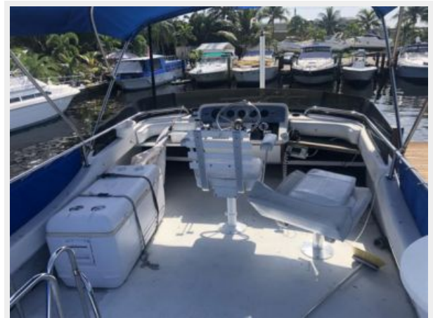
22 - 34' Mainship