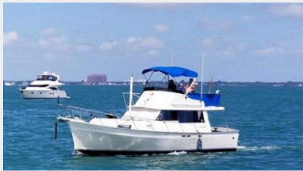
1 - 34' Mainship