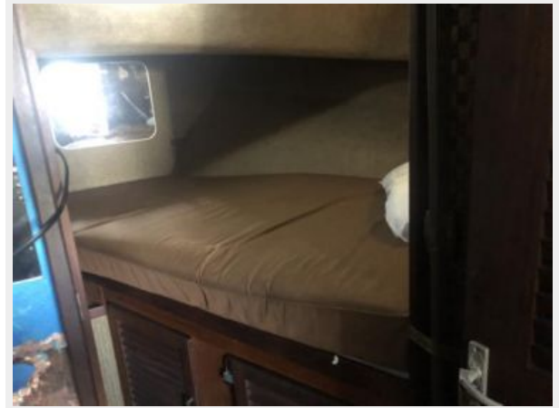
20 - 34' Mainship