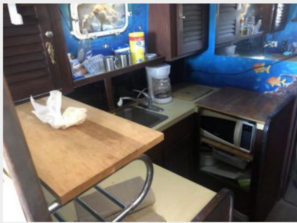
15 - 34' Mainship