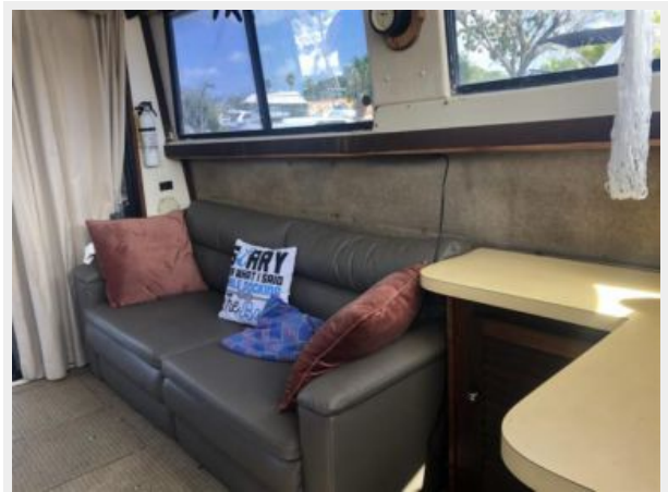
10 - 34' Mainship