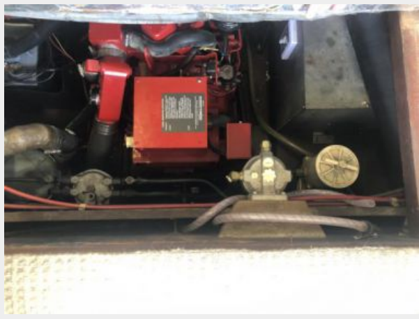
25 - 34' Mainship