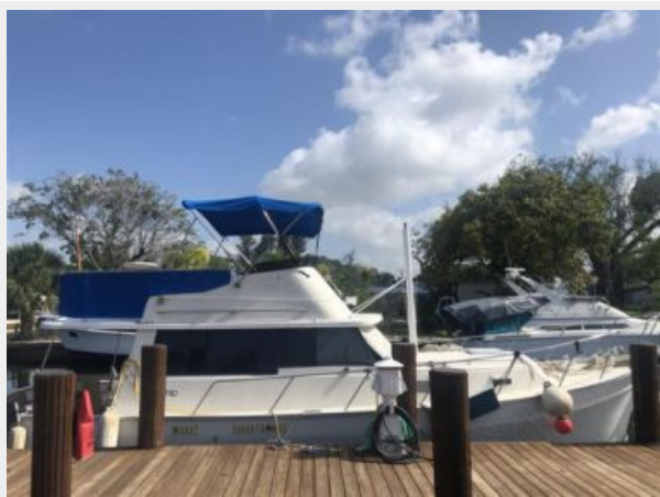
3 - 34' Mainship