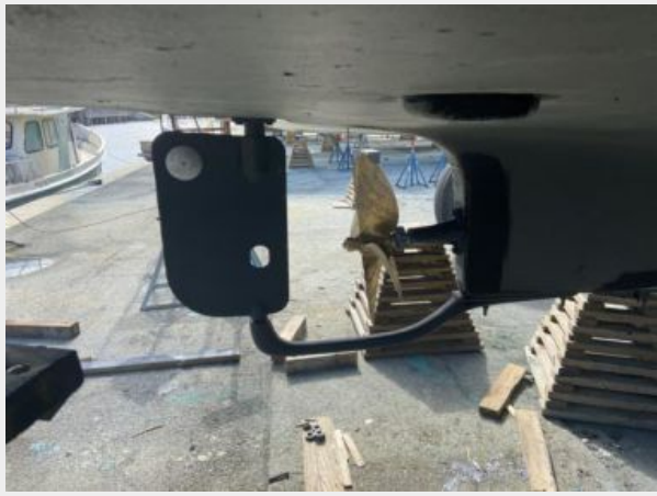
31 - 34' Mainship