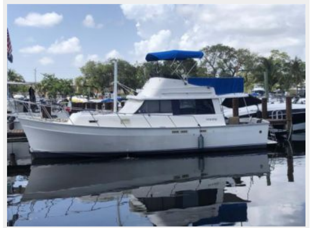
2 - 34' Mainship