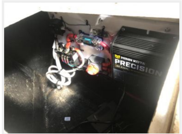
28 - 34' Mainship