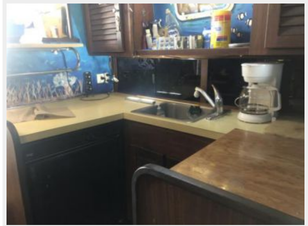
16 - 34' Mainship