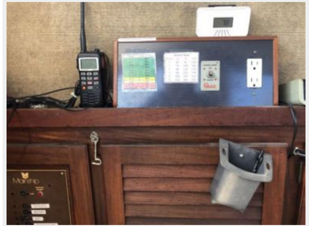
14 - 34' Mainship