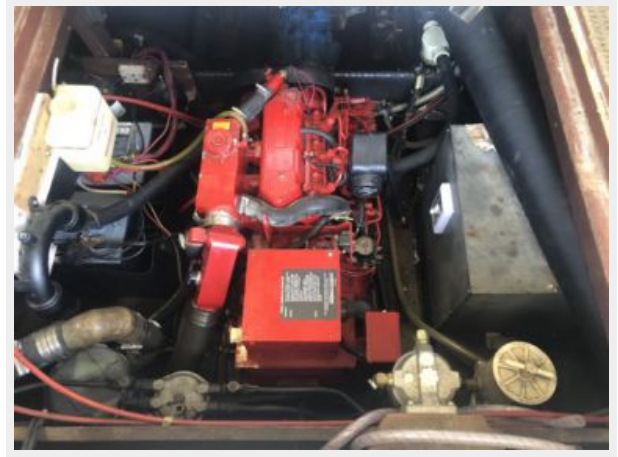
26 - 34' Mainship