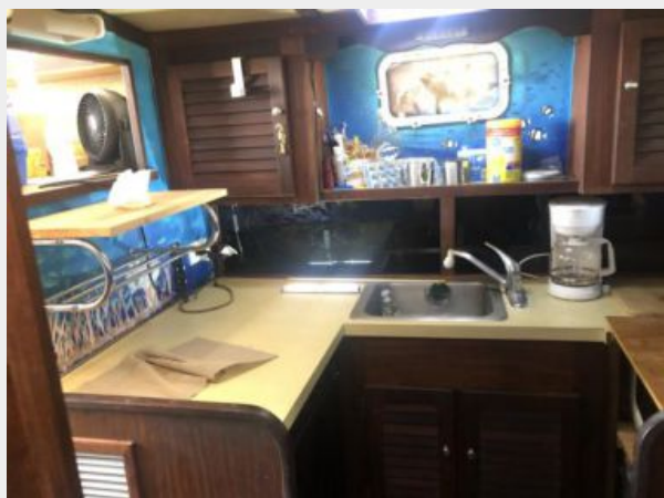
17 - 34' Mainship