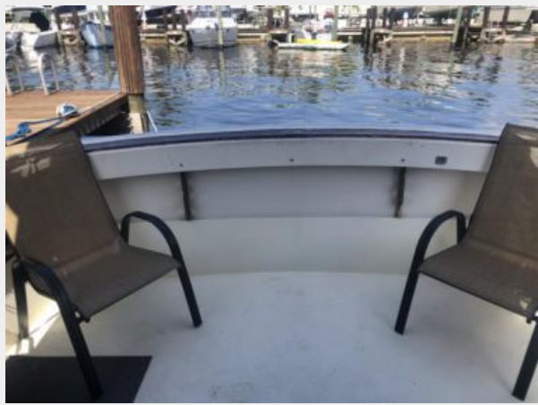
7 - 34' Mainship