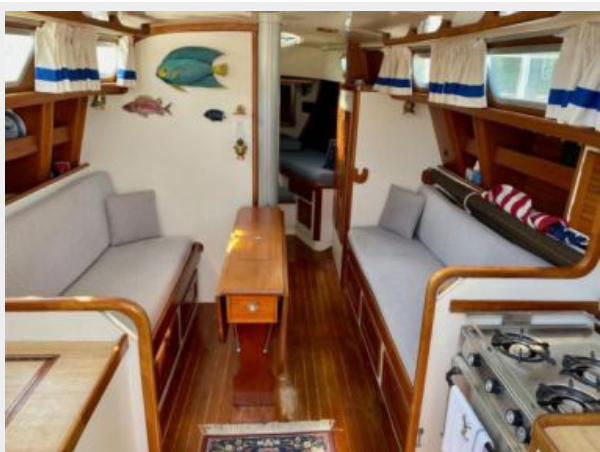
Bristol 35.5 - Extravagance - 31