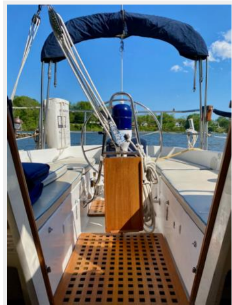
Bristol 35.5 - Extravagance - 30