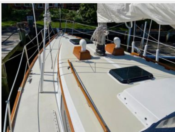
Bristol 35.5 - Extravagance - 13