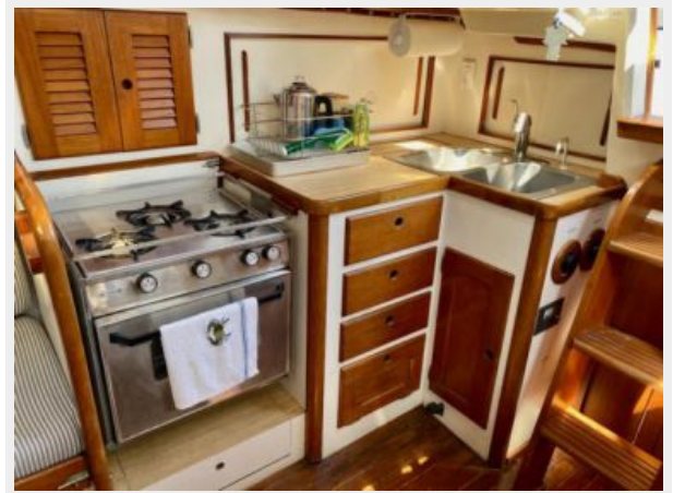
Bristol 35.5 - Extravagance - 36