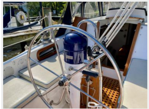
Bristol 35.5 - Extravagance - 24