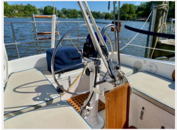
Bristol 35.5 - Extravagance - 22