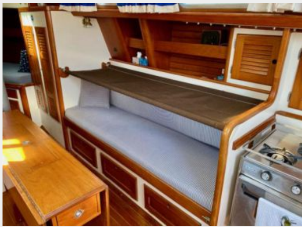
Bristol 35.5 - Extravagance - 33