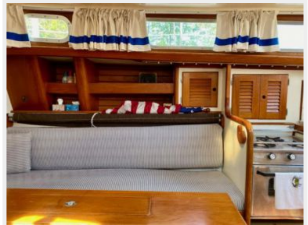
Bristol 35.5 - Extravagance - 34