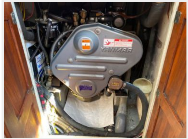
Bristol 35.5 - Extravagance - 61