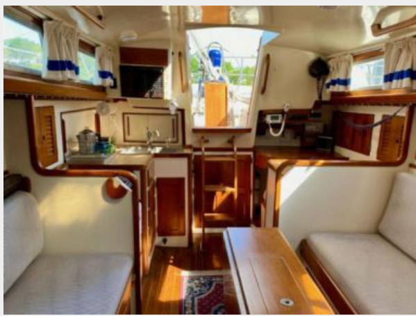
Bristol 35.5 - Extravagance - 37