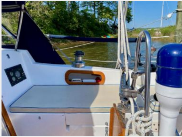
Bristol 35.5 - Extravagance - 27