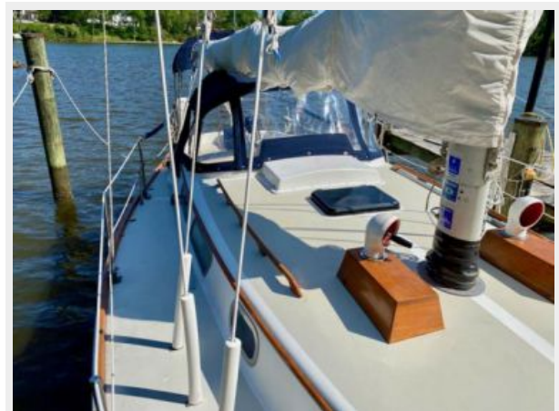
Bristol 35.5 - Extravagance - 20