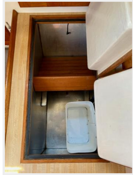
Bristol 35.5 - Extravagance - 40