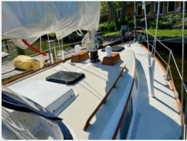
Bristol 35.5 - Extravagance - 21