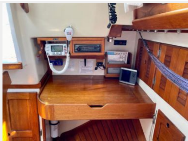
Bristol 35.5 - Extravagance - 41