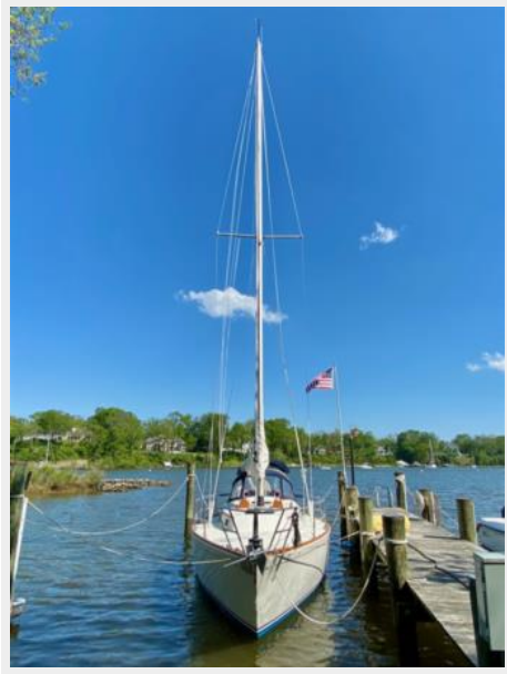
Bristol 35.5 - Extravagance - 9