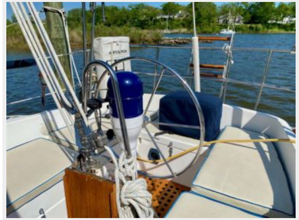
Bristol 35.5 - Extravagance - 28