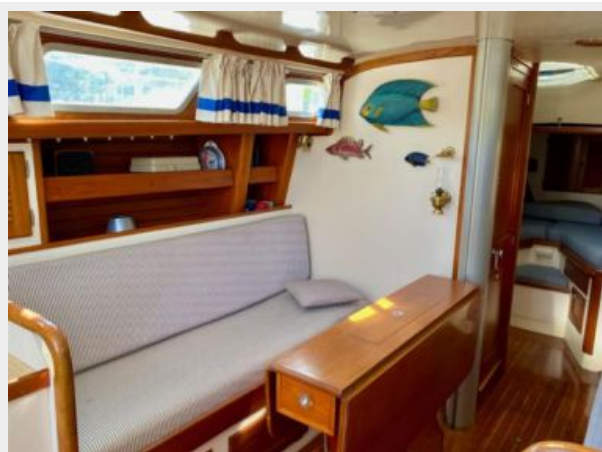
Bristol 35.5 - Extravagance - 43