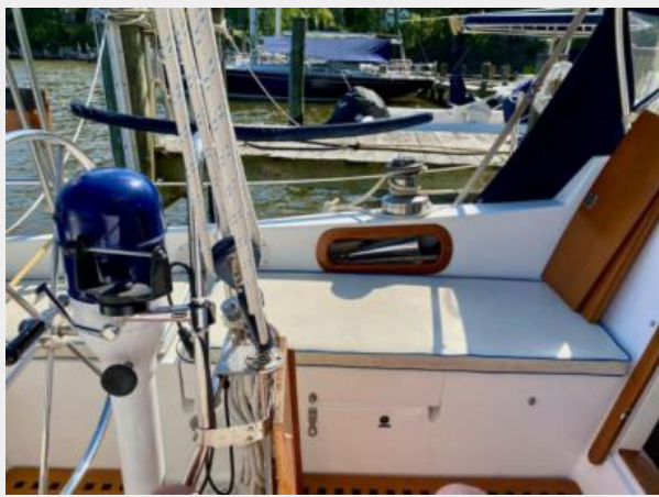
Bristol 35.5 - Extravagance - 23