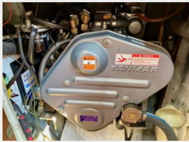
Bristol 35.5 - Extravagance - 62a