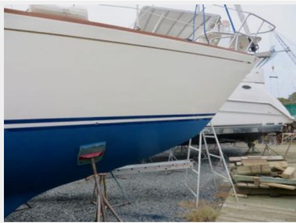
Bristol 35.5 - Extravagance - 63