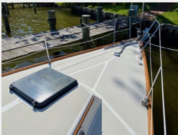
Bristol 35.5 - Extravagance - 17