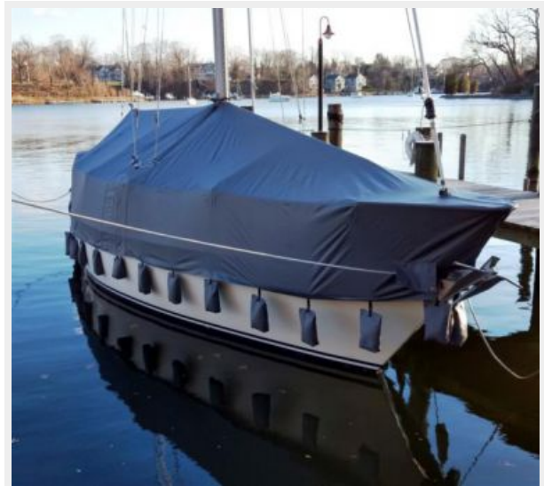
Bristol 35.5 - Extravagance - 62b