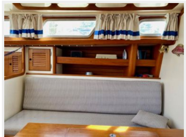
Bristol 35.5 - Extravagance - 42