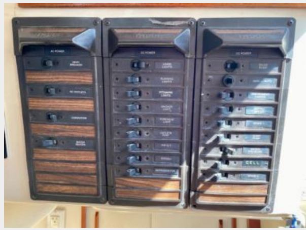
Bristol 35.5 - Extravagance - 60