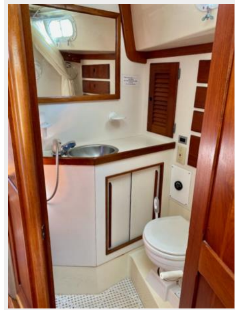
Bristol 35.5 - Extravagance - 50