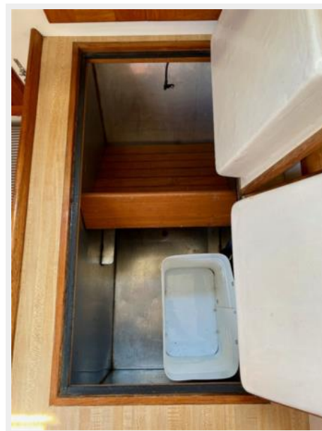
Bristol 35.5 - Extravagance - 40