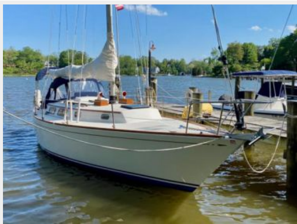
Bristol 35.5 - Extravagance - 7