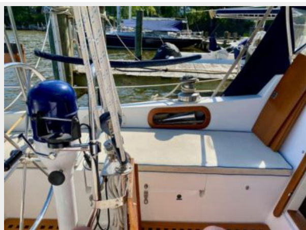
Bristol 35.5 - Extravagance - 23