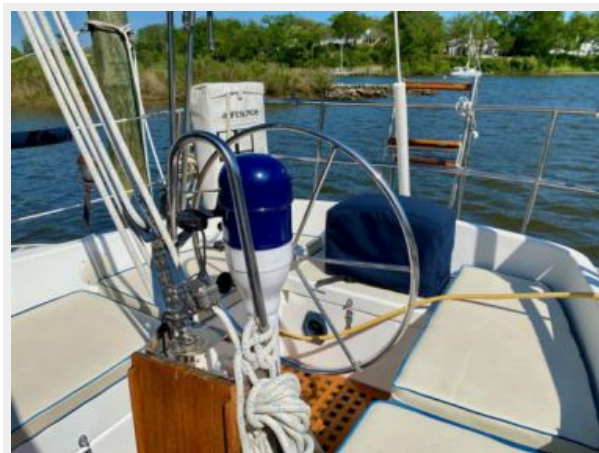
Bristol 35.5 - Extravagance - 28