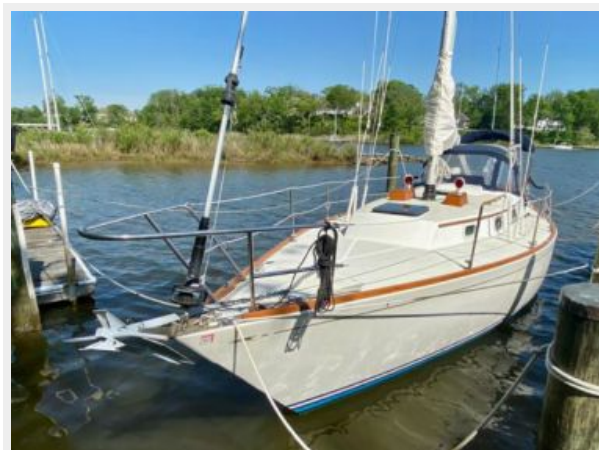
Bristol 35.5 - Extravagance - 10