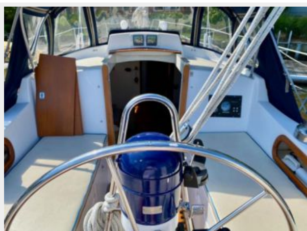
Bristol 35.5 - Extravagance - 25