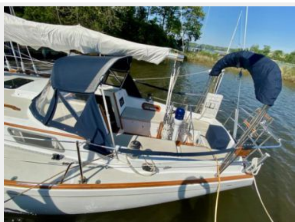
Bristol 35.5 - Extravagance - 11