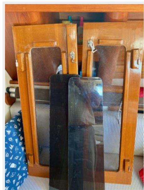
Bristol 35.5 - Extravagance - 59b