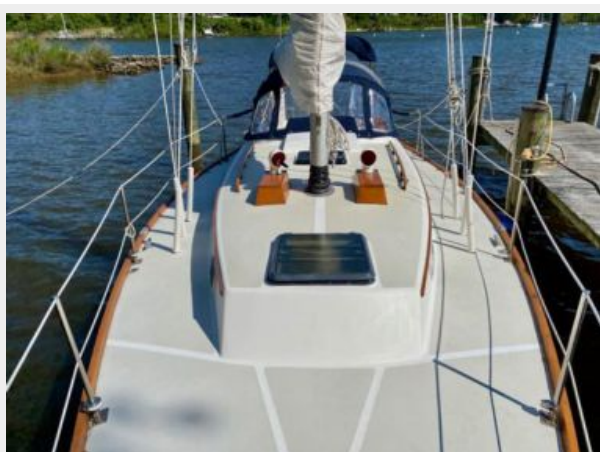
Bristol 35.5 - Extravagance - 19