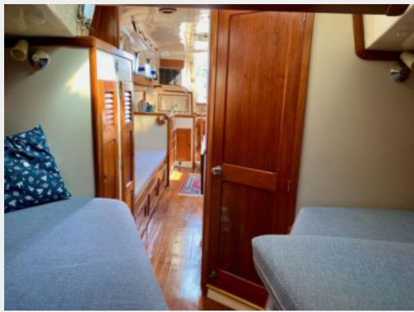
Bristol 35.5 - Extravagance - 55