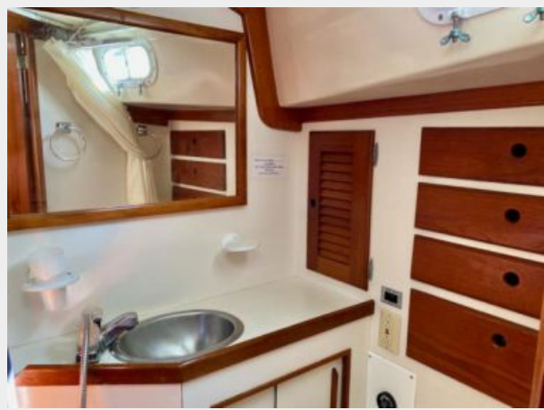
Bristol 35.5 - Extravagance - 49