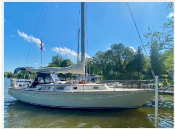
Bristol 35.5 - Extravagance - 6