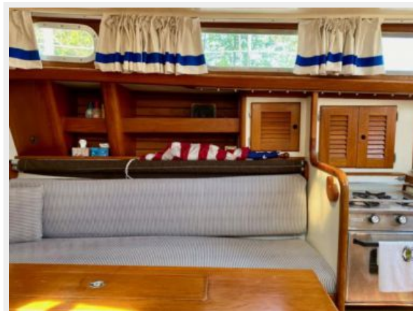
Bristol 35.5 - Extravagance - 34