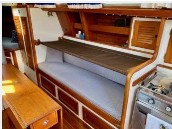
Bristol 35.5 - Extravagance - 33