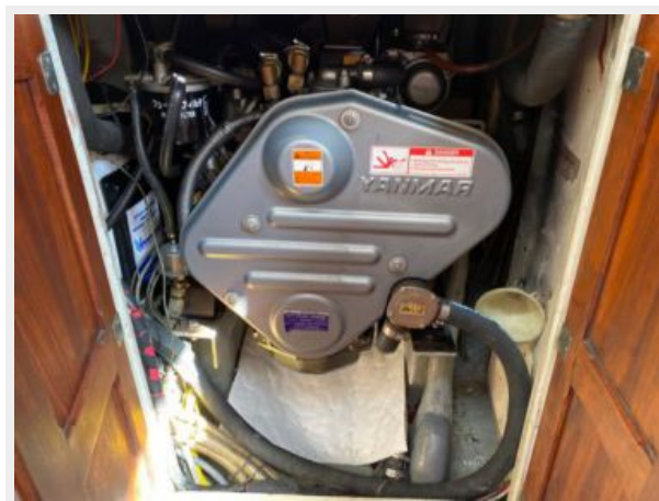
Bristol 35.5 - Extravagance - 61