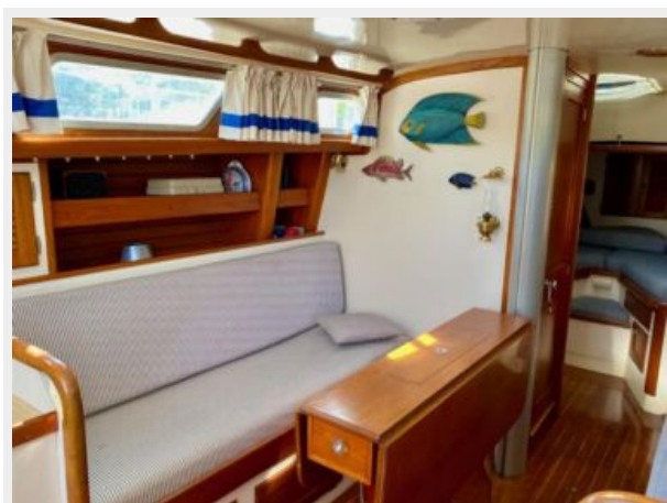
Bristol 35.5 - Extravagance - 43