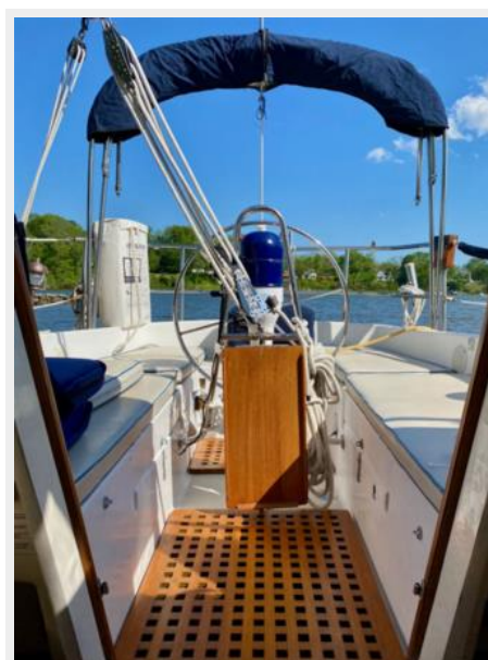
Bristol 35.5 - Extravagance - 30