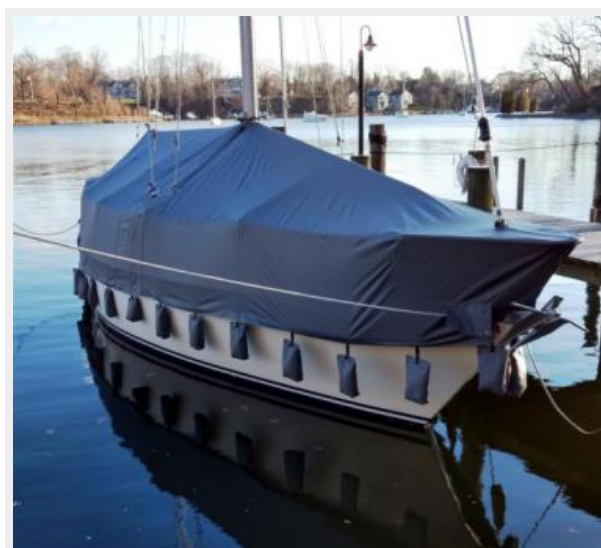
Bristol 35.5 - Extravagance - 62b