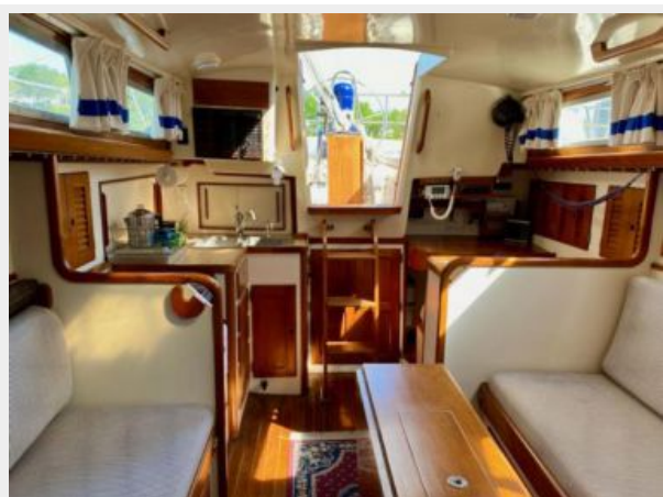
Bristol 35.5 - Extravagance - 37