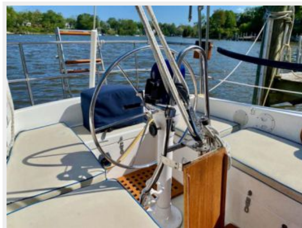
Bristol 35.5 - Extravagance - 22