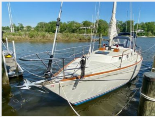
Bristol 35.5 - Extravagance - 1