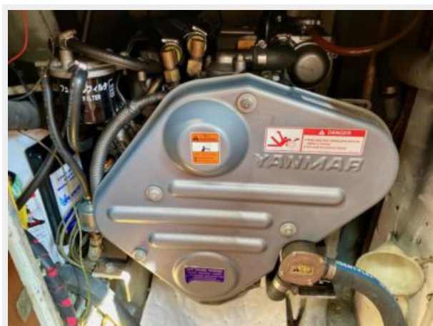
Bristol 35.5 - Extravagance - 62a