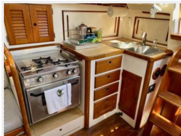
Bristol 35.5 - Extravagance - 36