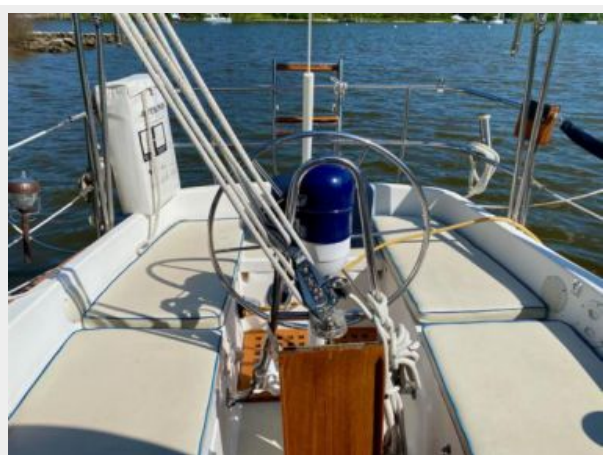
Bristol 35.5 - Extravagance - 29