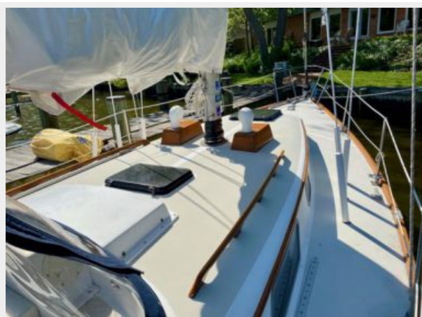
Bristol 35.5 - Extravagance - 21