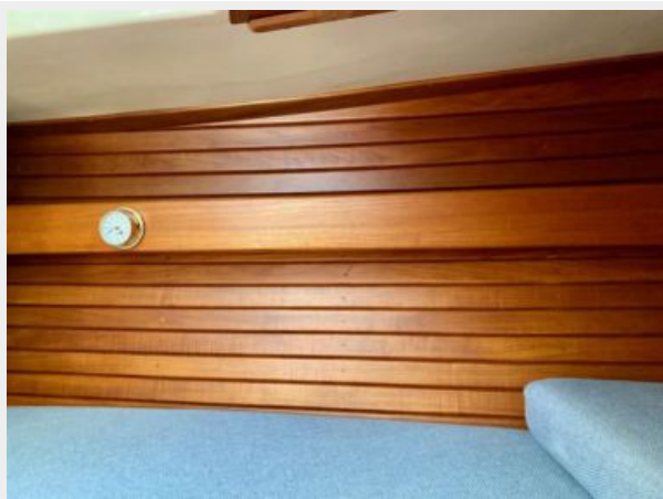
Bristol 35.5 - Extravagance - 57