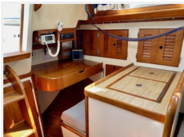
Bristol 35.5 - Extravagance - 39