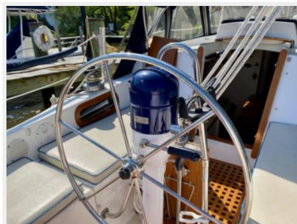
Bristol 35.5 - Extravagance - 24