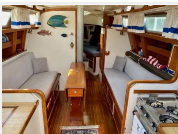
Bristol 35.5 - Extravagance - 31