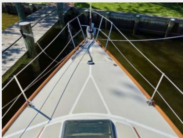
Bristol 35.5 - Extravagance - 15