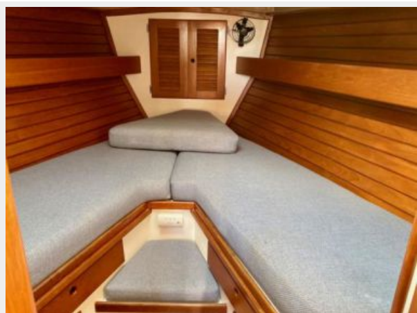
Bristol 35.5 - Extravagance - 51