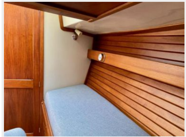
Bristol 35.5 - Extravagance - 56