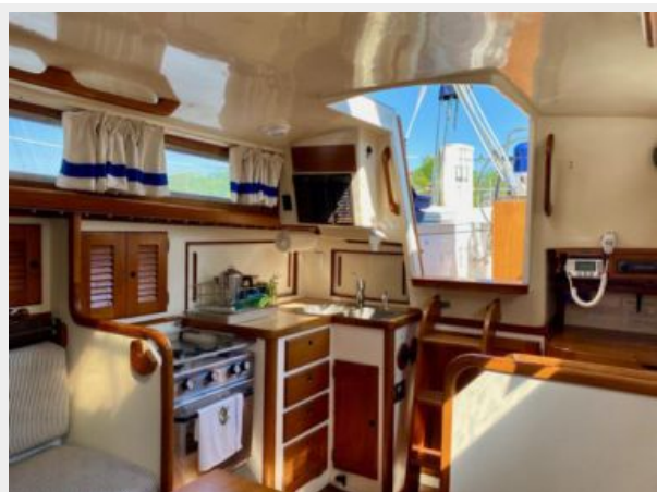
Bristol 35.5 - Extravagance - 35