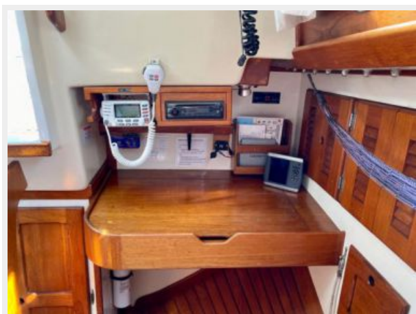
Bristol 35.5 - Extravagance - 41