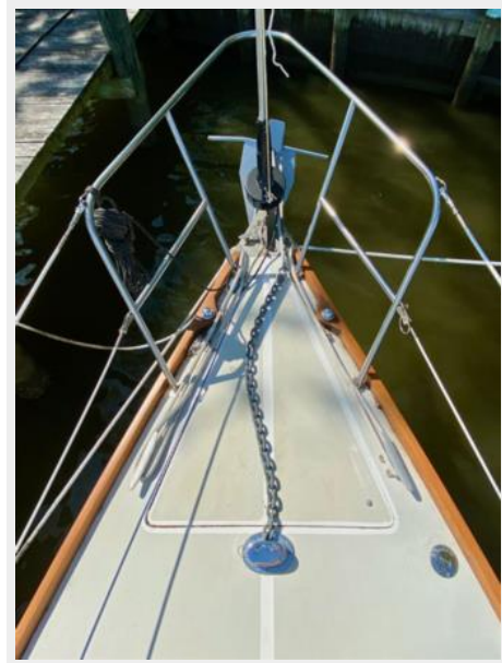
Bristol 35.5 - Extravagance - 16