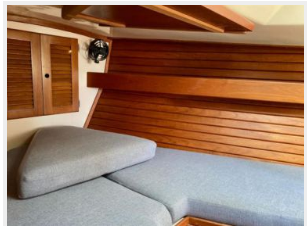
Bristol 35.5 - Extravagance - 52