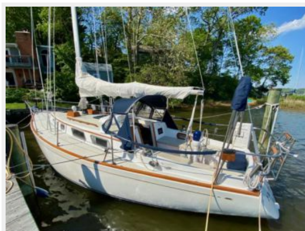
Bristol 35.5 - Extravagance - 12