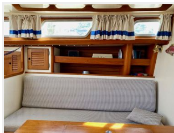
Bristol 35.5 - Extravagance - 42