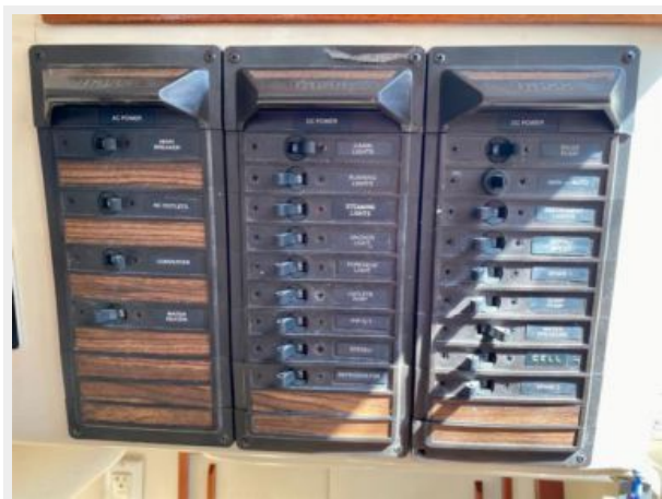
Bristol 35.5 - Extravagance - 60