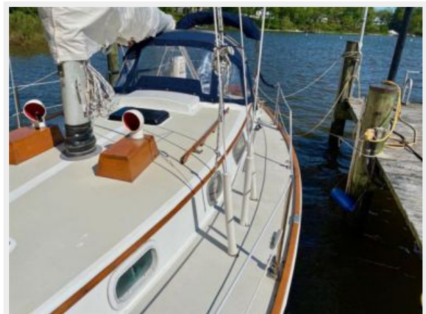
Bristol 35.5 - Extravagance - 18