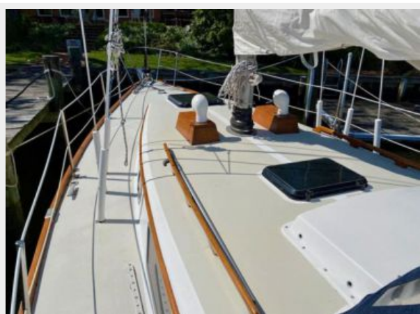
Bristol 35.5 - Extravagance - 13