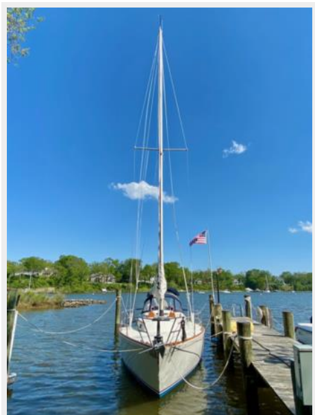
Bristol 35.5 - Extravagance - 9