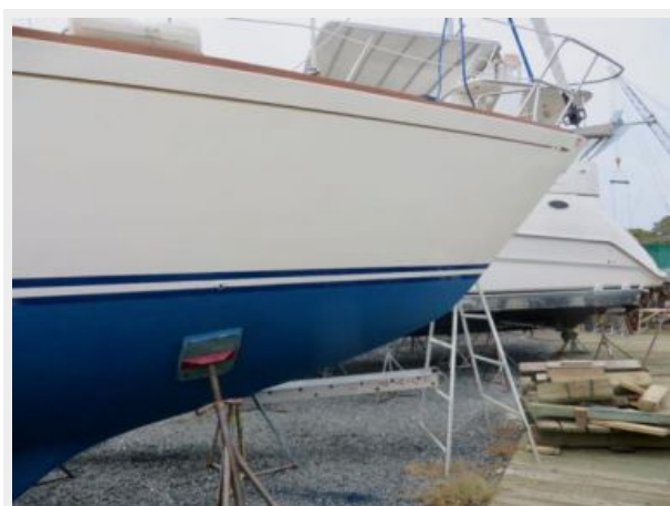
Bristol 35.5 - Extravagance - 63