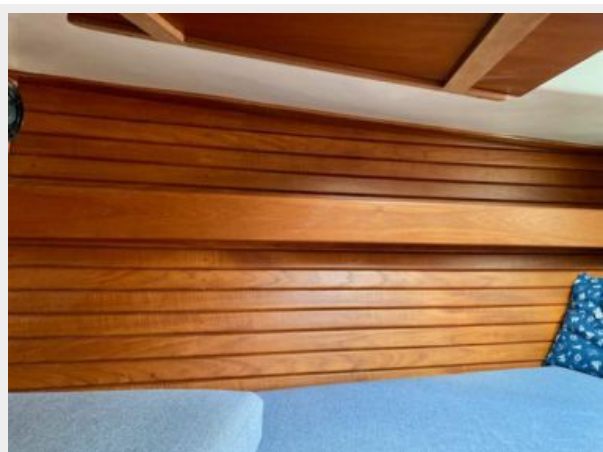
Bristol 35.5 - Extravagance - 53