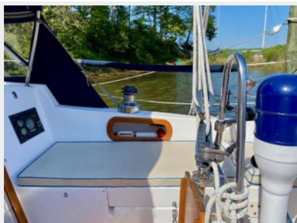
Bristol 35.5 - Extravagance - 27