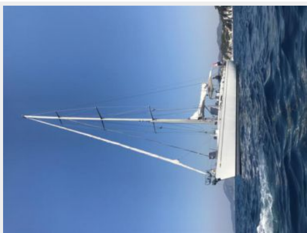
at anchor 4