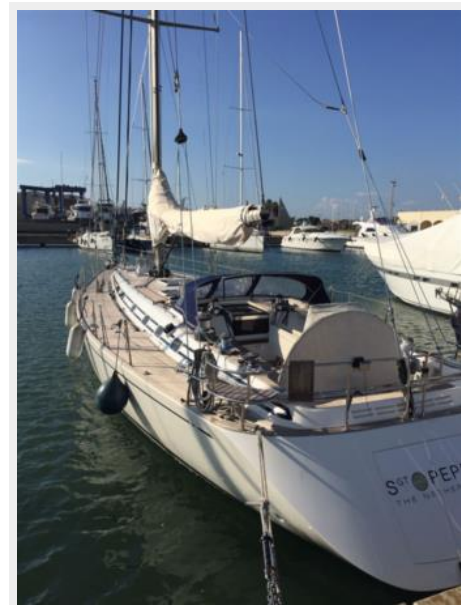
at mooring 1