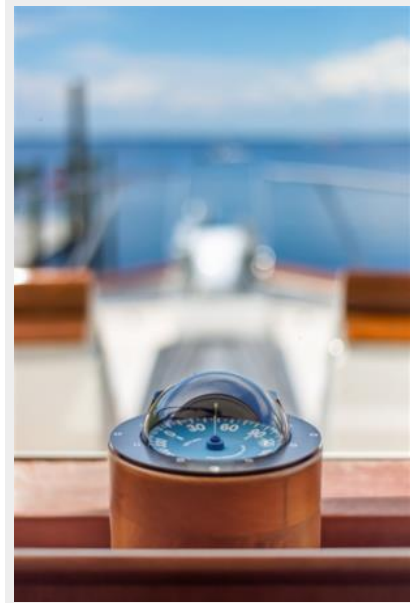
compass close up