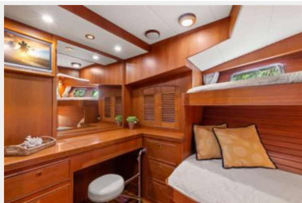
guest room with desk