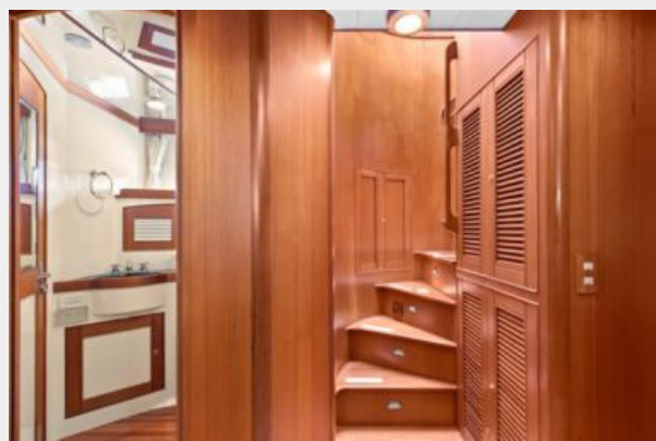
stairs and bathroom