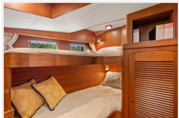
Guest room with bunks