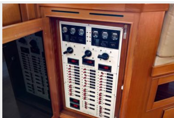
Close up Gen board