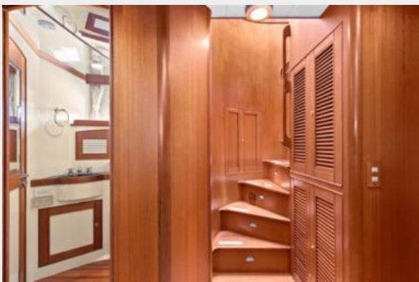
stairs and bathroom