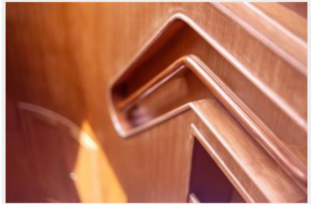
Wood close up