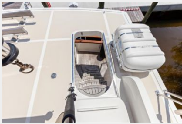
deck with salon doors