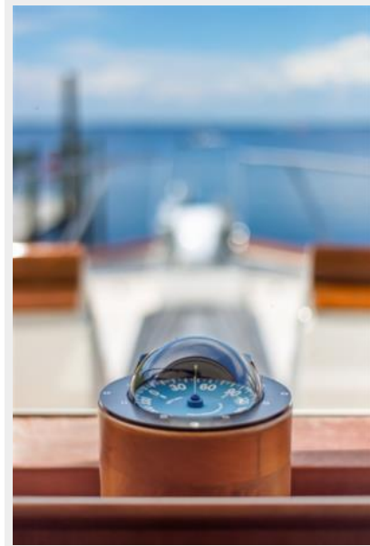
compass close up