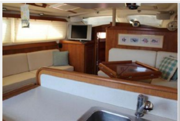
Main salon looking forward from galley