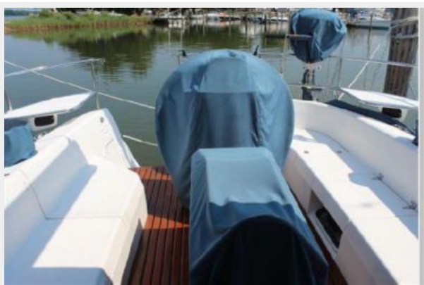
Cockpit looking aft