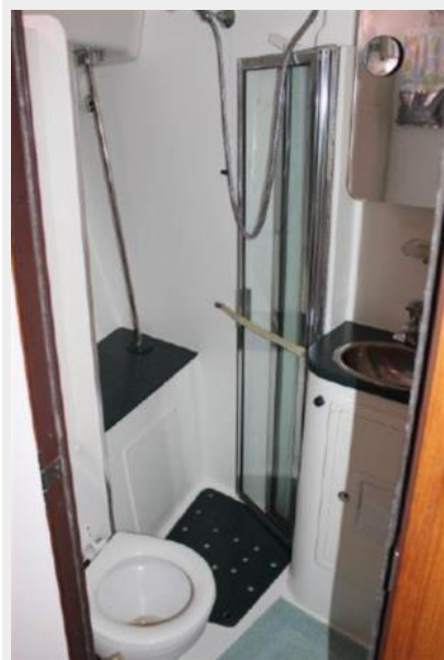
Forward head with separate shower stall