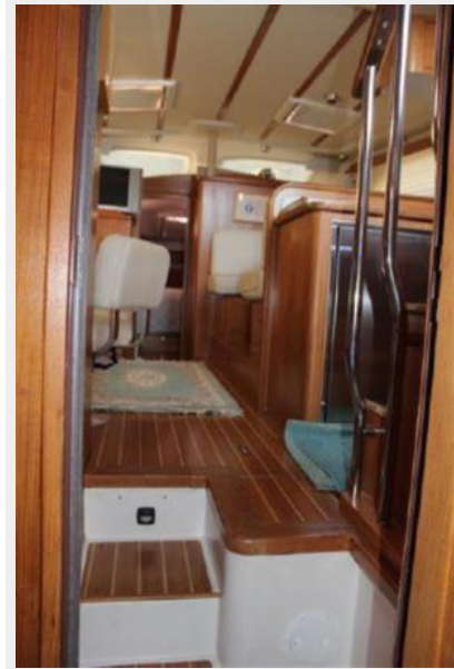
View from aft stateroom looking into salon