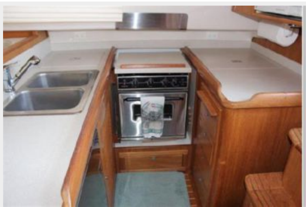
U-shaped sea galley