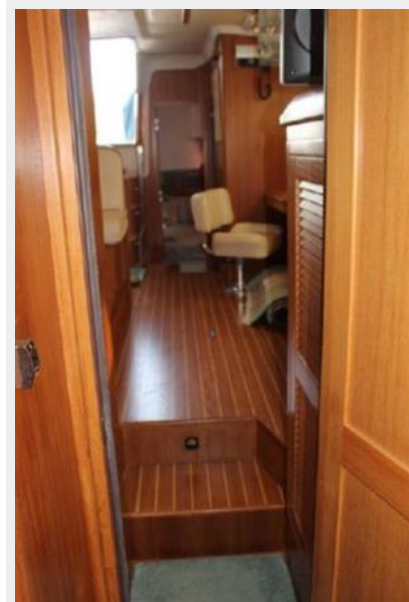
View from forward stateroom looking aft