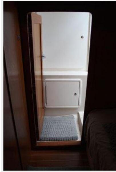
Interior access from aft cabin to Pantry, work station, storage compartment