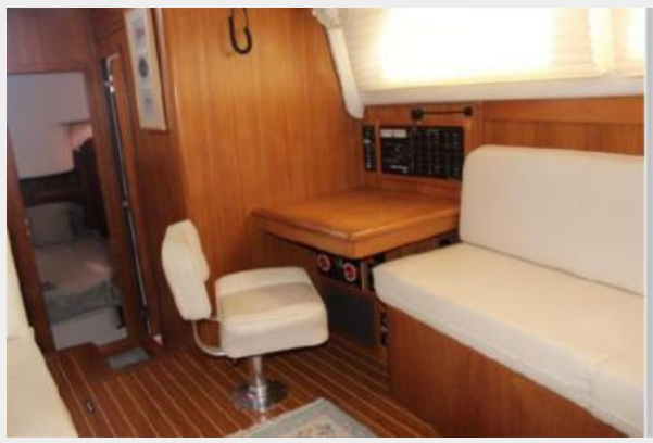
Navigation station in salon