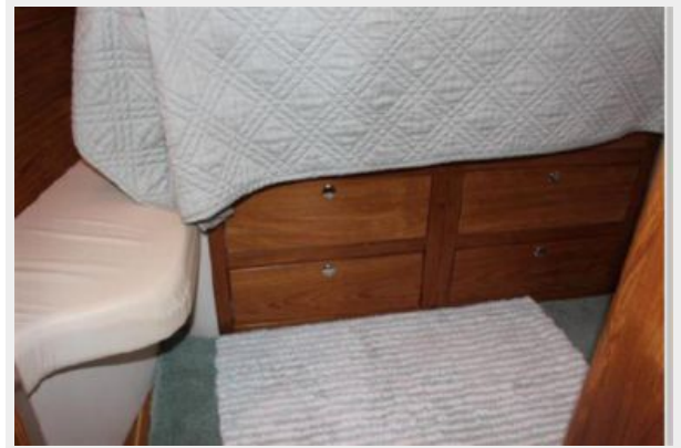
Seating and storage forward stateroom