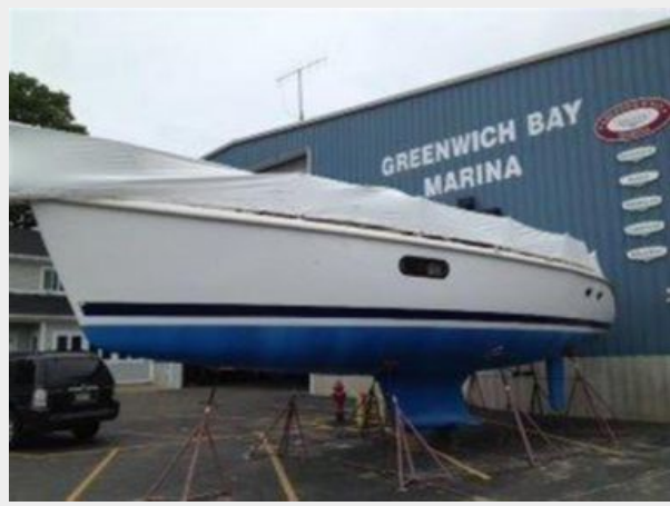
Topsides and bottom freshly painted