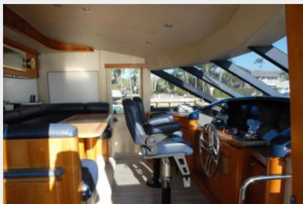
Pilothouse opens to galley with seating for 7