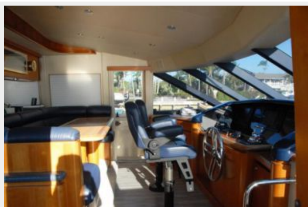
Pilothouse opens to galley with seating for 7