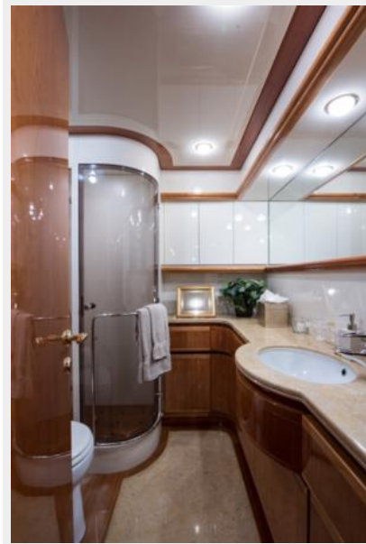
CREW AREA / LAUNDRY