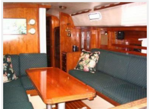
MAIN CABIN TABLE AT HALF