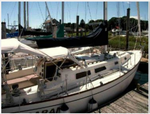
DODGER, Bimini AND CONNECTOR