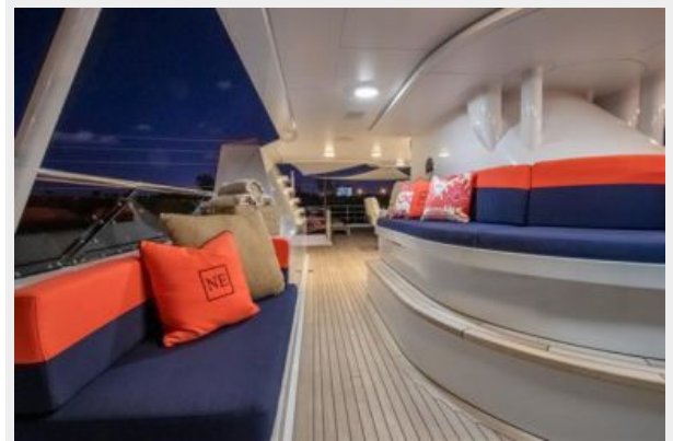
Forward Sundeck Seating