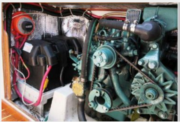
Engine room area details