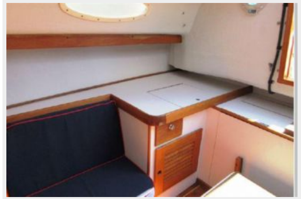
Cabin starboard aft