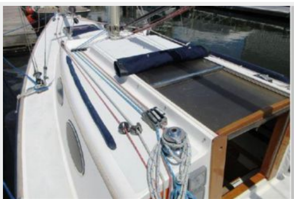
Port side forward