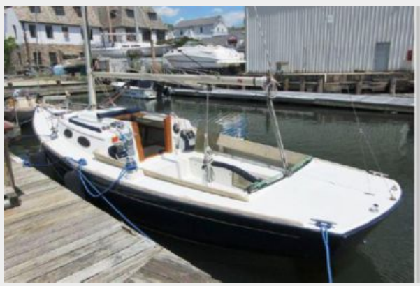
Port side, aft