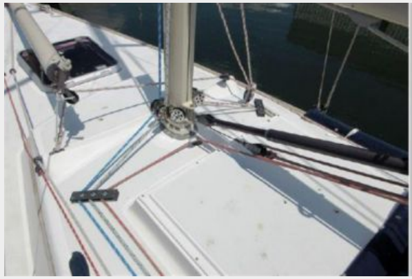
Mast step area