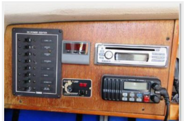
Electronics & electrical panel, starboard aft