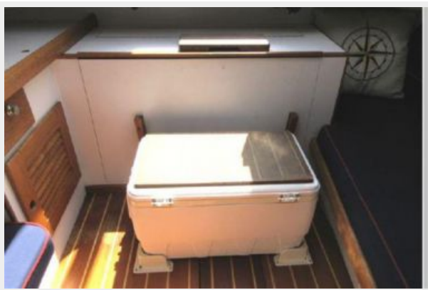
Cooler & Companionway entrance & engine box