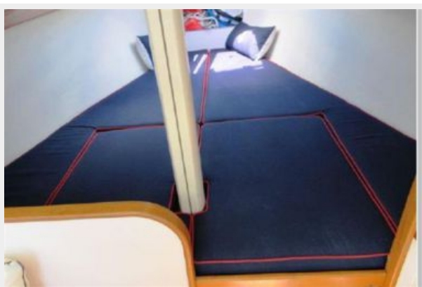
Forecabin berth w/ filler pieces