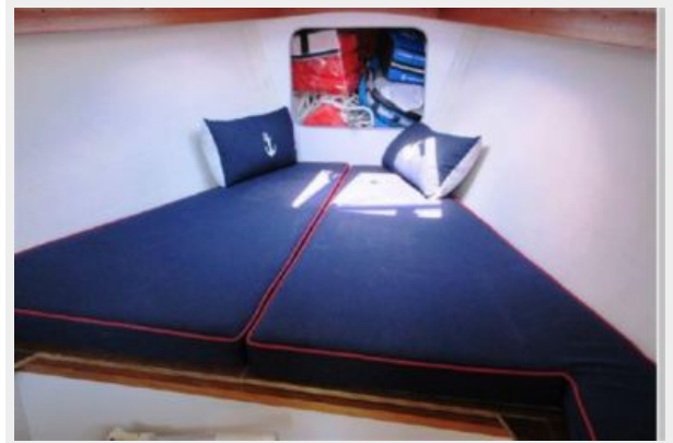
V-berth w/ out filler pieces