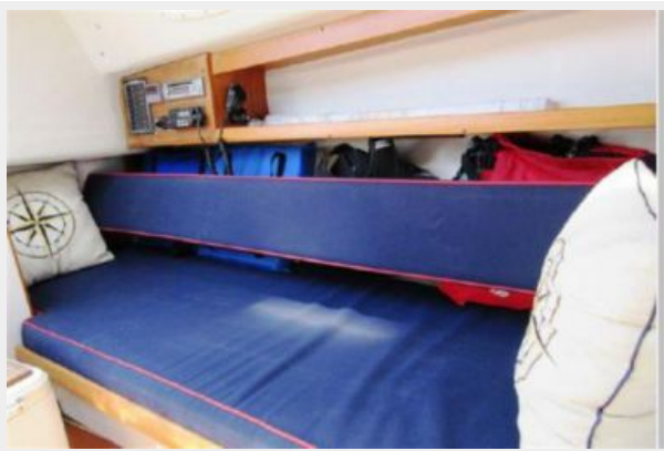
Cabin port side, aft