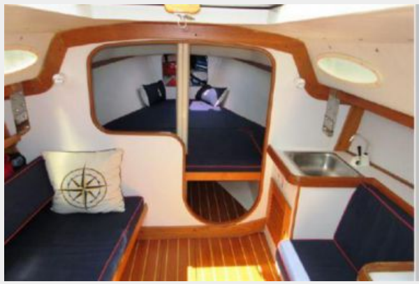
Cabin area & berth