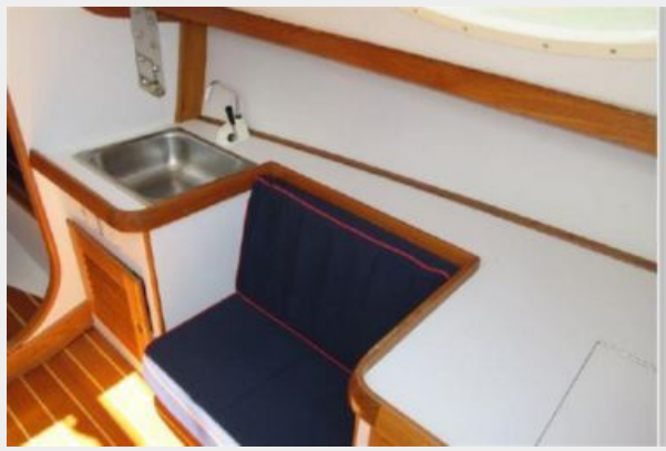
Cabin forward detail