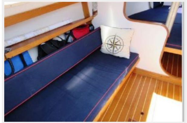
Cabin, port side