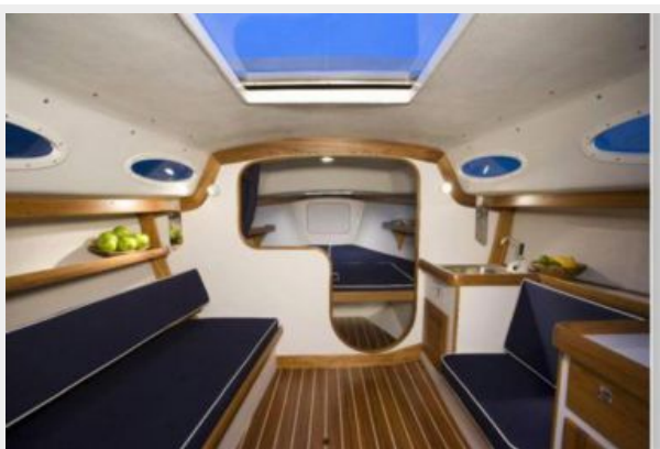
28 Express Interior - Brochure