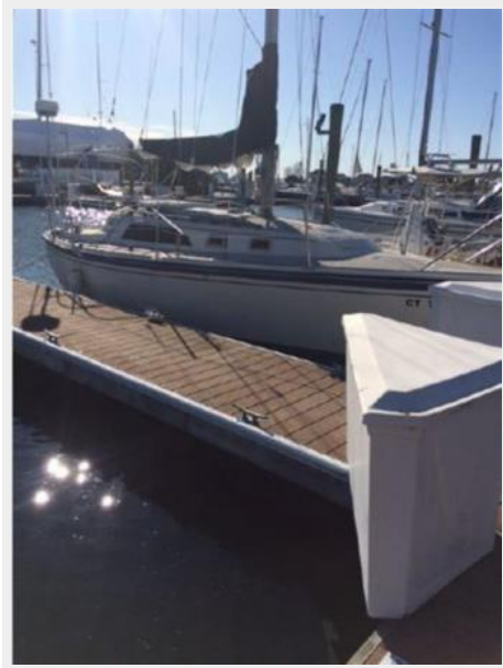
STB VIEW DOCKSIDE