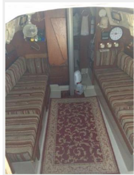
MAIN CABIN FROM MAIN HATCH