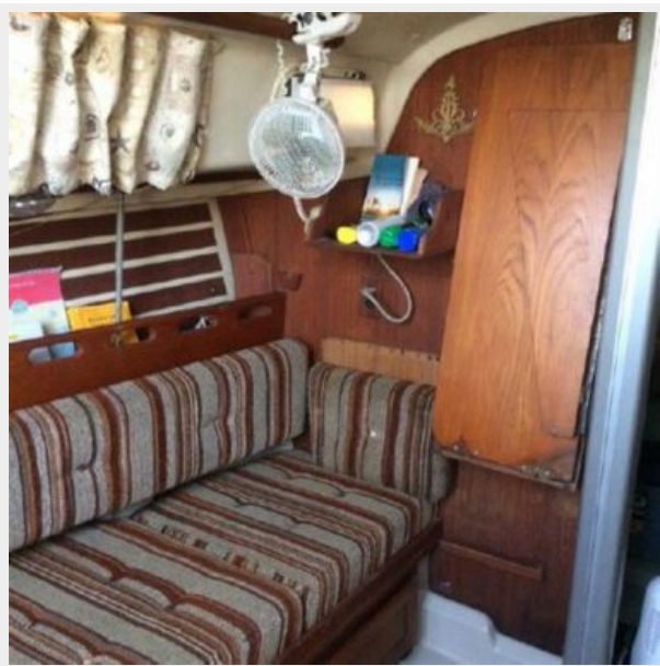
DINETTE TABLE IN STOWED POSITION PORT SETTEE BERTH SLIDES OUT FOR A DOUBLE