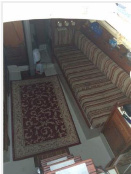
MAIN SALON STB SIDE FROM MAIN HATCH