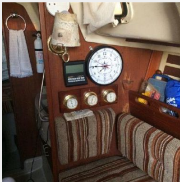
MAIN SALON LOOKING FORWARD STB SIDE