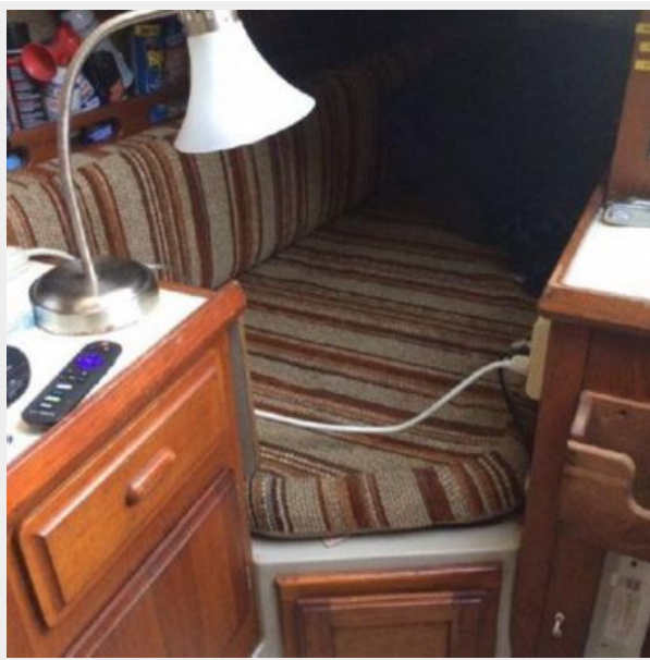
QUARTER BERTH ON STB SIDE