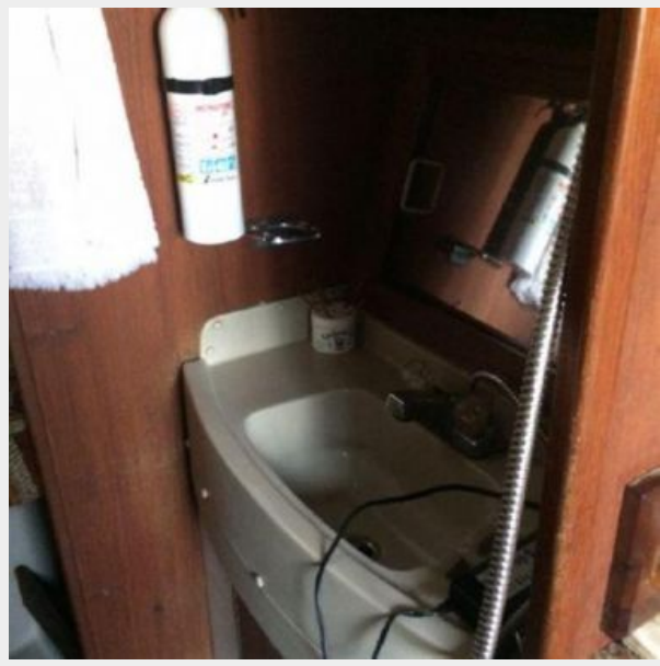
VANITY IN HEAD TO STB