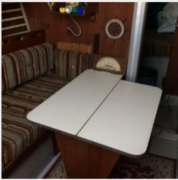
DINETTE TABLE IN FULL OPEN POSITION