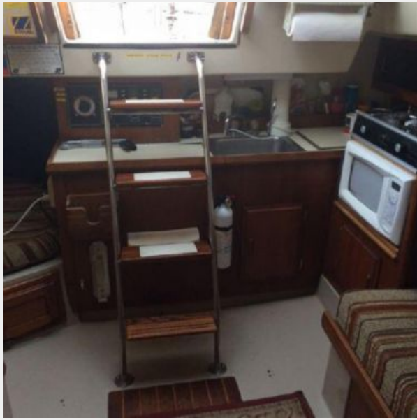
MAIN SALON LOOKING AFT QUARTERBERTH ON STB SIDE GALLEY ON PORT SIDE