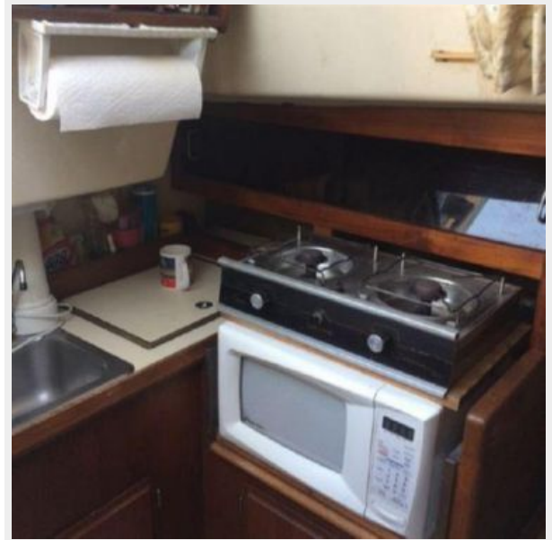
GALLEY SOWING SS SINK ICE BOX MICRO WAVE WITH 2 BURNER STOVE