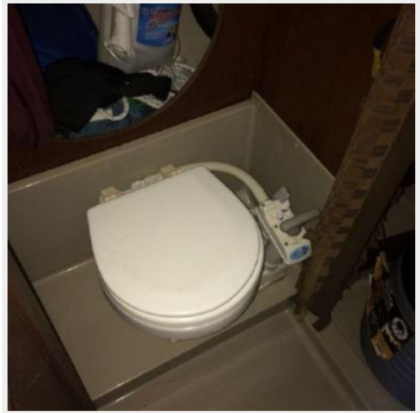
TOILET IN HEAD TO STB WITH PRIVACY CURTAINS FORE AND AFT