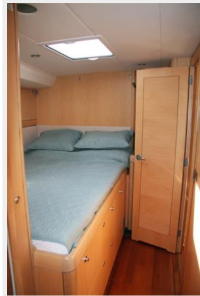
Stbd. Guest Cabin