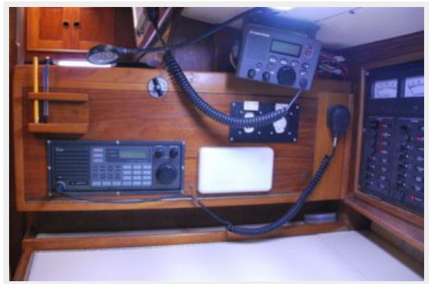
Chart table 3