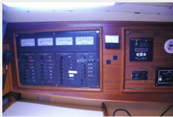
Chart table 2