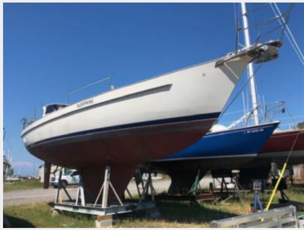
42 Niagara Starboard Bow