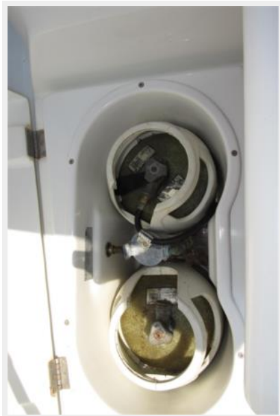
Fibreglass Propane Tanks