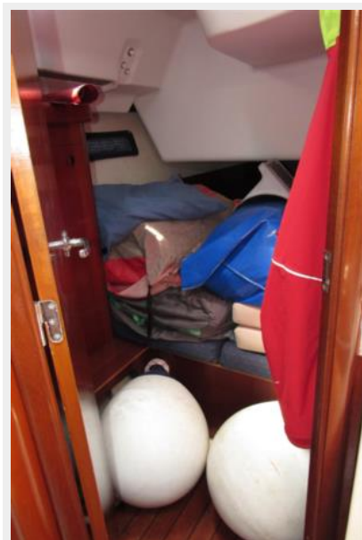
Starboard Aft Cabin - storage cabin