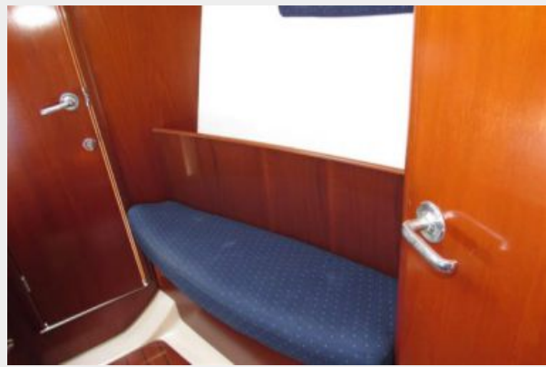
Bench in Forward Cabin