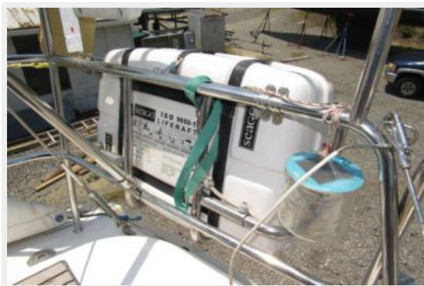
Liferaft on custom bracket