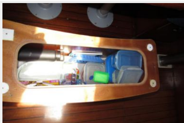
Storage Under Middle Bench