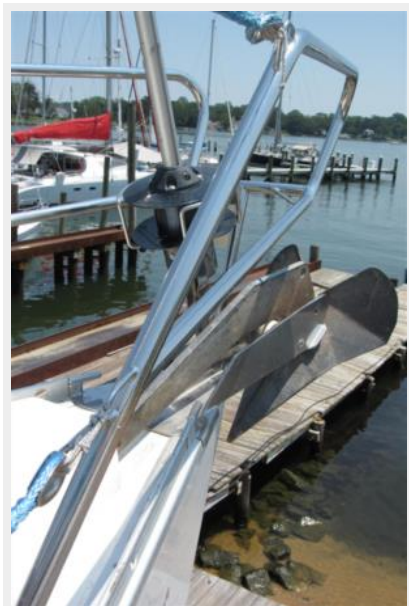
Anchor on bowsprit