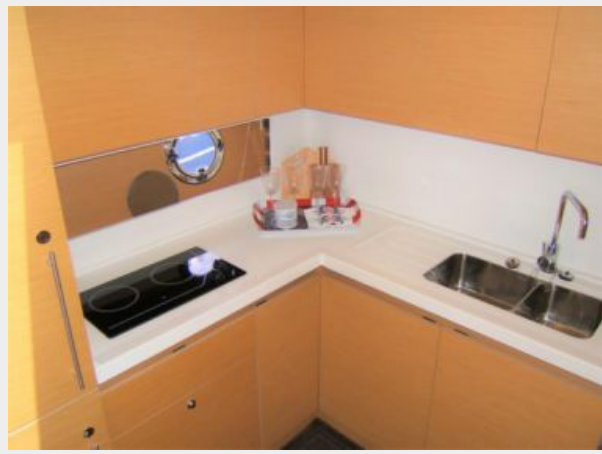
2020-06-20 22.31.05 - Copy - Copy