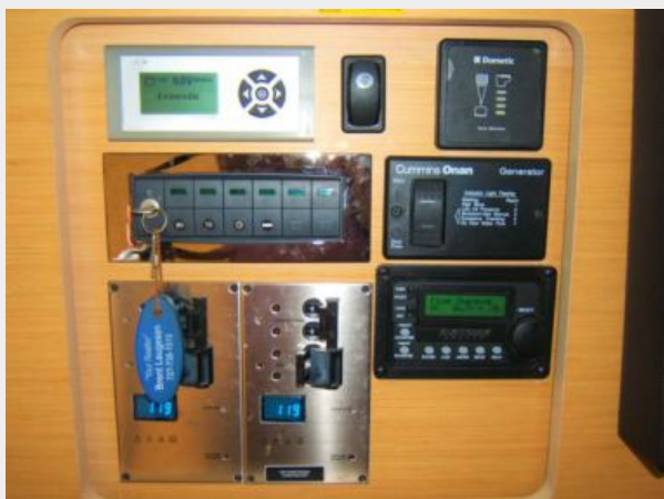
2020-06-20 22.30.27 - Copy - Copy