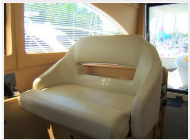
2020-06-20 22.26.26 - Copy - Copy