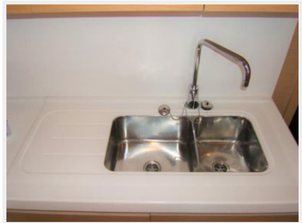
2020-06-20 22.32.09 - Copy - Copy