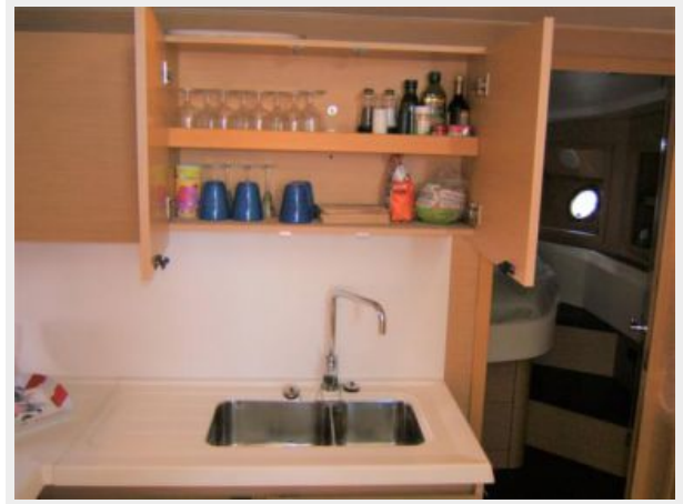
2020-06-20 22.31.26 - Copy - Copy