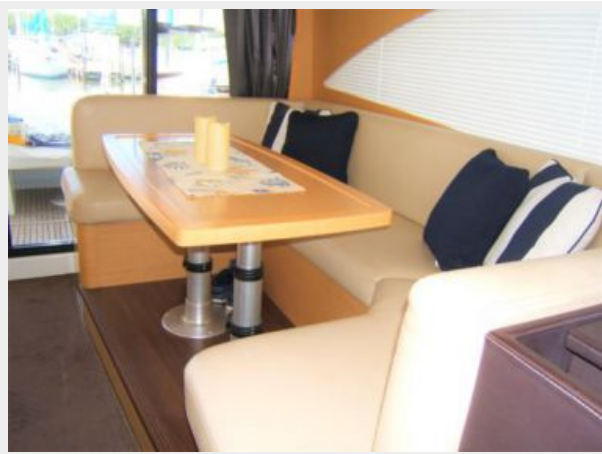
2020-06-20 22.25.26 - Copy - Copy