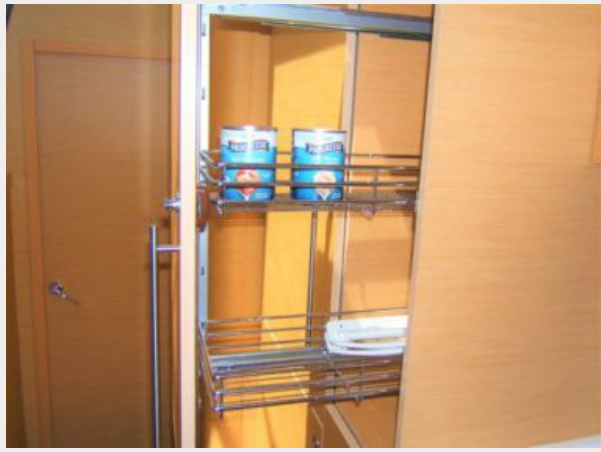
2020-06-20 22.34.33 - Copy - Copy