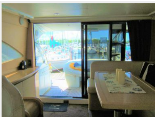
2020-06-20 22.21.51 - Copy - Copy