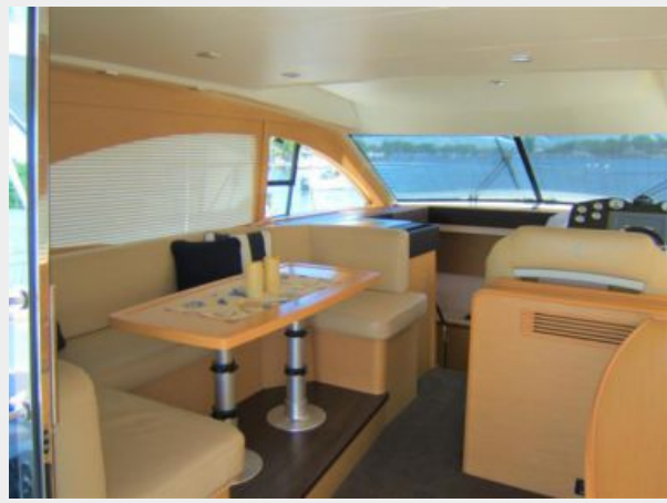
2020-06-20 22.22.33 - Copy - Copy