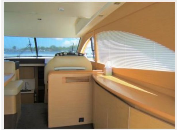
2020-06-20 22.23.57 - Copy - Copy