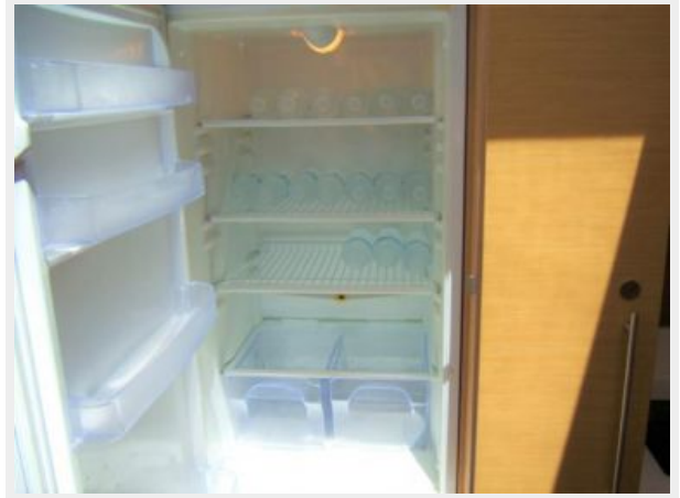
2020-06-20 22.35.30 - Copy - Copy