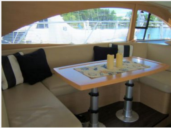
2020-06-20 22.27.52 - Copy - Copy