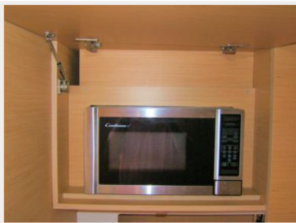
2020-06-20 22.32.20 - Copy - Copy