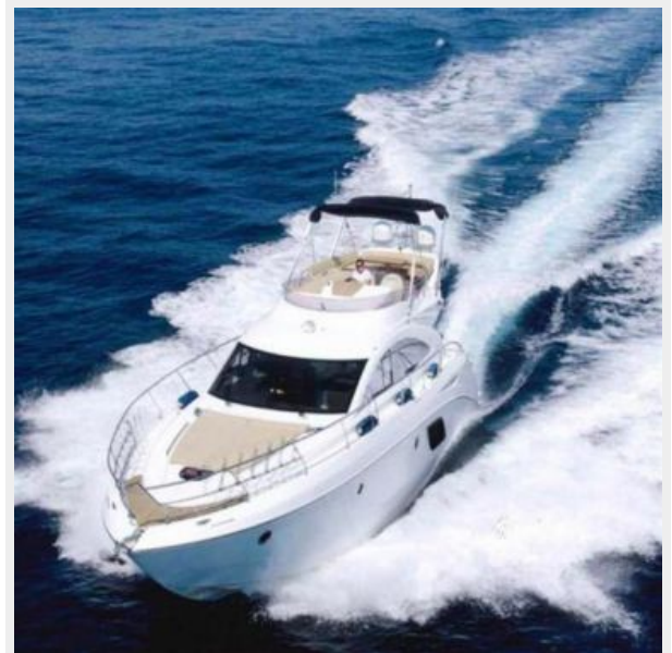
2020-06-20 22.21.08 - Copy - Copy