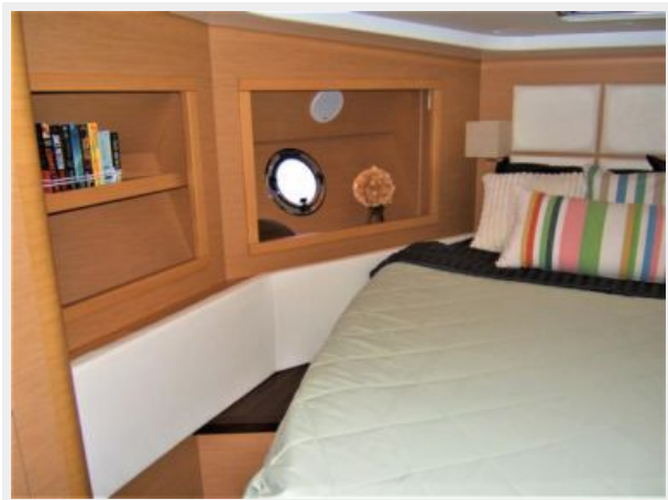
2020-06-20 22.41.53 - Copy - Copy