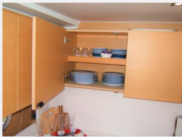
2020-06-20 22.31.42 - Copy - Copy