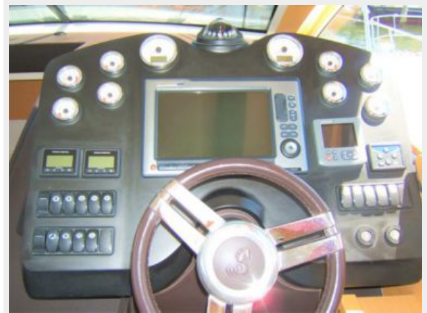
2020-06-20 22.30.03 - Copy - Copy