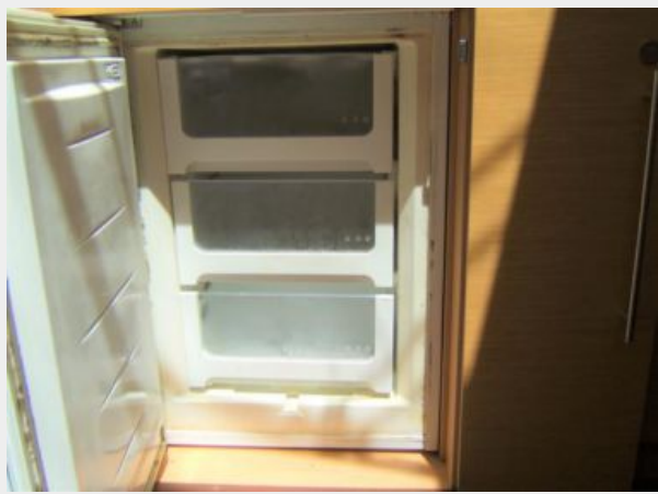
2020-06-20 22.36.47 - Copy - Copy