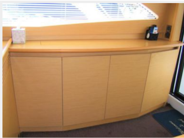
2020-06-20 22.26.48 - Copy - Copy