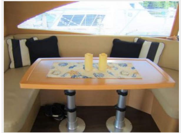
2020-06-20 22.28.05 - Copy - Copy