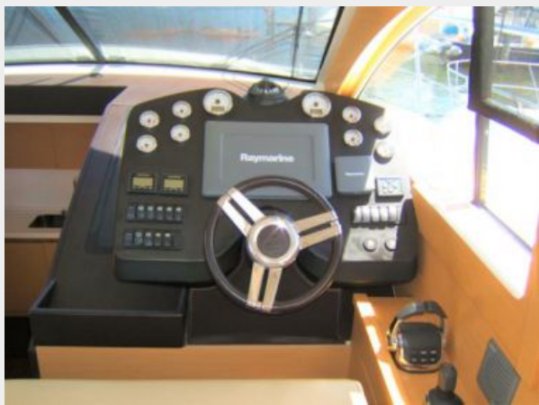
2020-06-20 22.28.55 - Copy - Copy