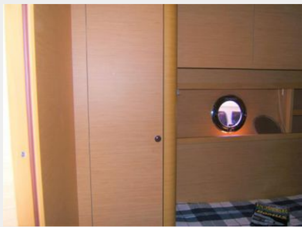
2020-06-20 22.37.58 - Copy - Copy