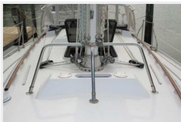
S/S guard at mast