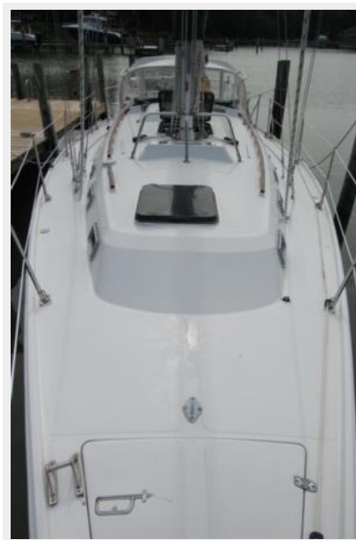
Deck looking aft