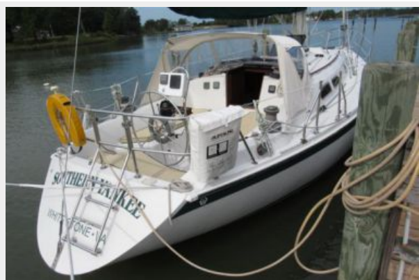
Transom and cockpit