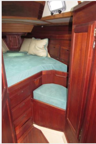
V-berth storage & bunk