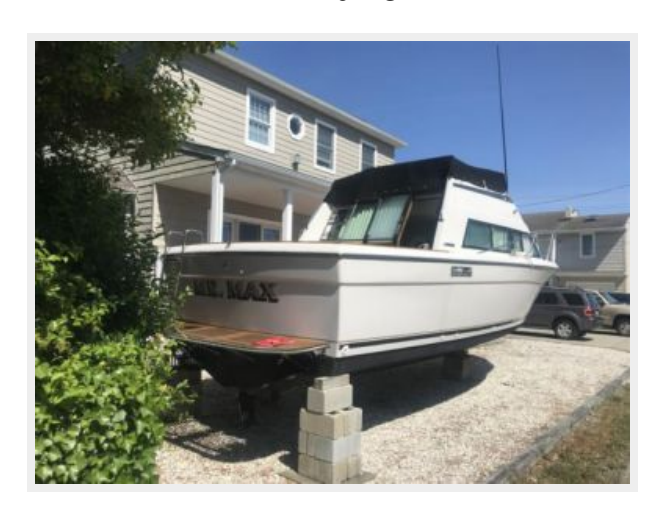
Mr Max 3