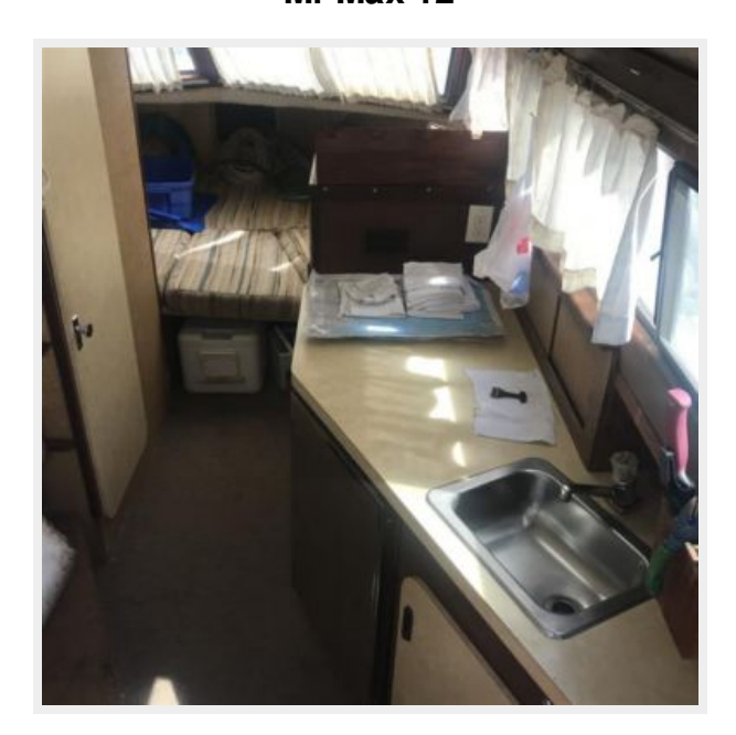
Mr Max 12