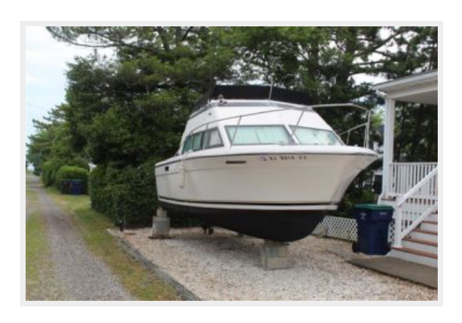
Mr Max 1