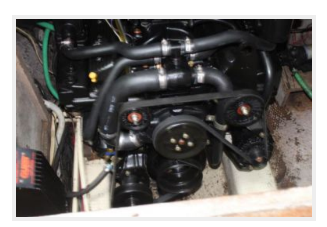
Mr Max 15