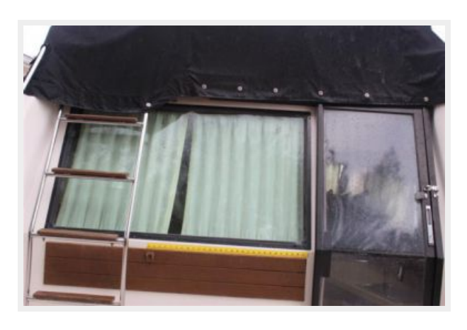
Mr Max 5