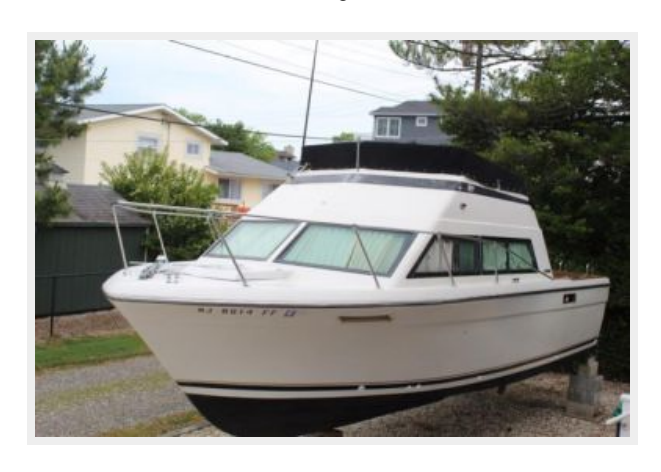
Mr Max 4