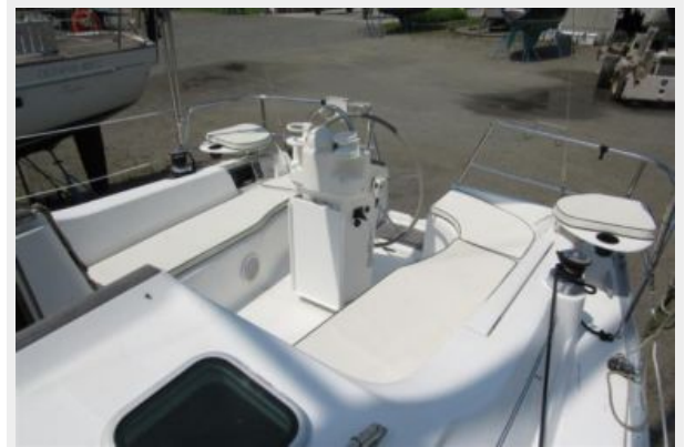
Transom with ladder down