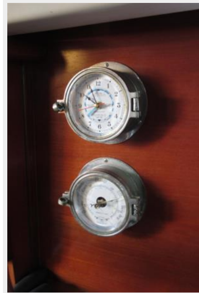
Clock and Barometer