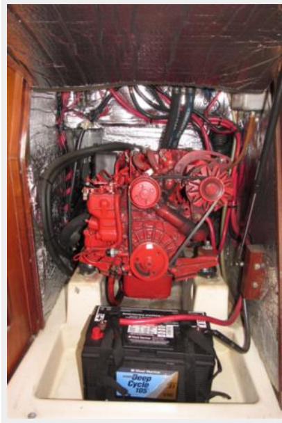
Engine and start battery