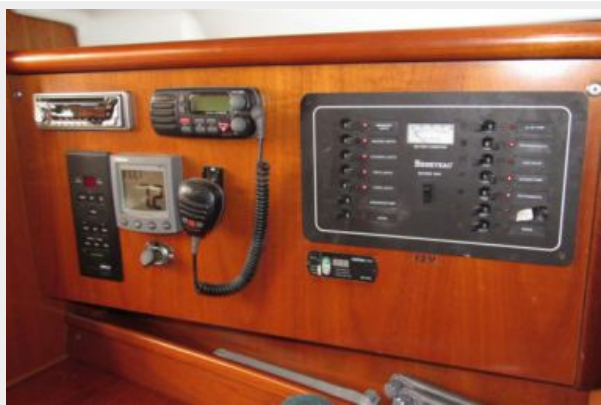
Instruments and electrical panel