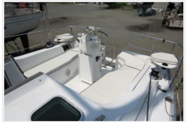
Transom with ladder down