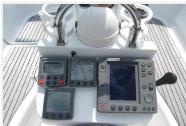
Instruments at helm