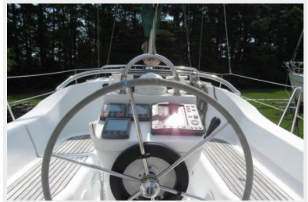
Wheel, pedestal and instruments