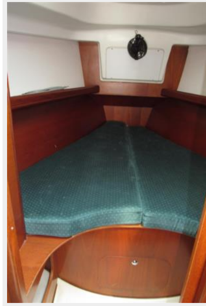
V-berth without filler cushion