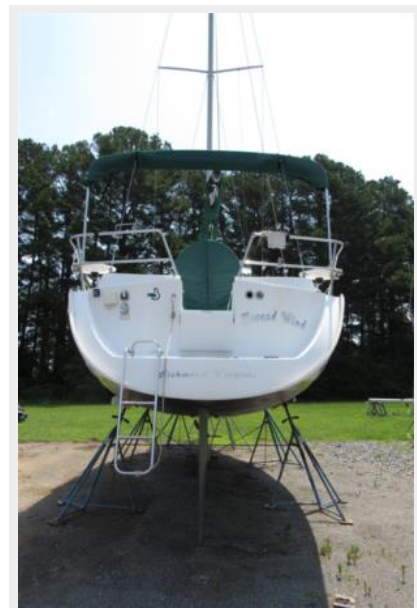
Transom with ladder down