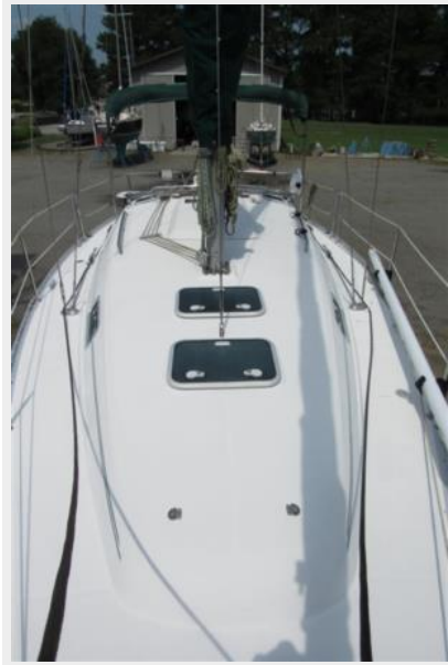
Deck from bow