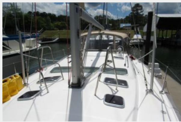
Deck hatches & granny bars at mast