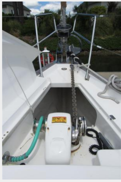
Anchor locker, windlass and anchor washdown