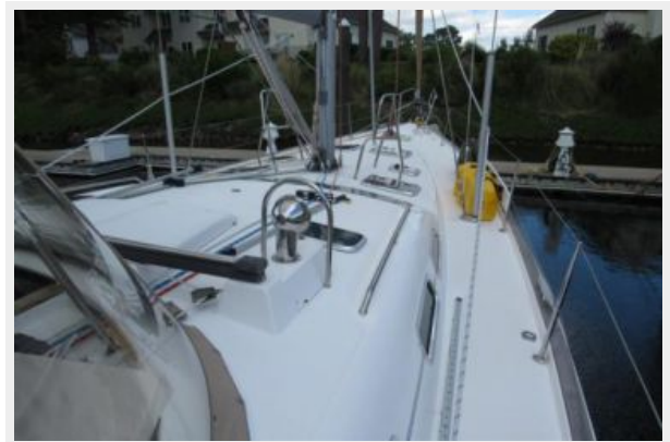
Starboard side deck