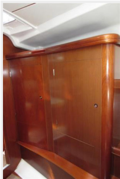
Custom storage port