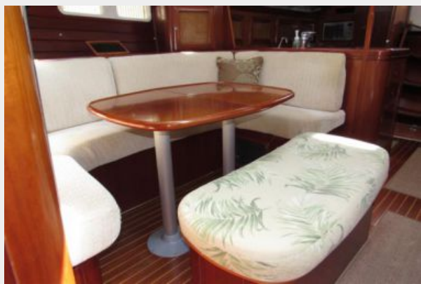
Dinette with Tommy Bahama fabric on bench seat