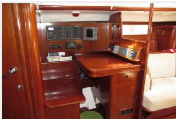
IMG_9220 - Copy (2)