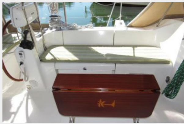
Port cockpit seating and table with leaves down