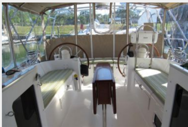
Cockpit & full enclosure from companionway