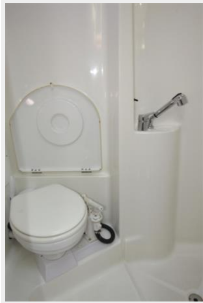
Forward head and shower