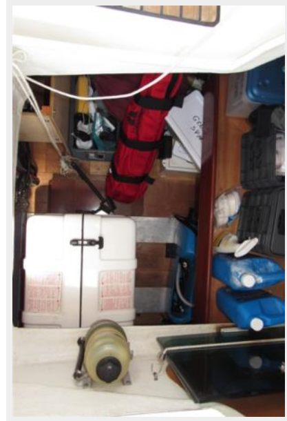
Cockpit storage locker