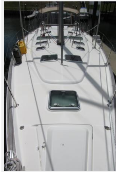
Deck looking aft