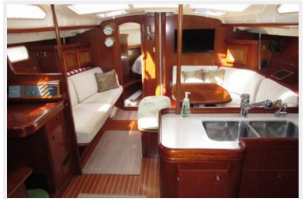
IMG_9216 - Copy (2)