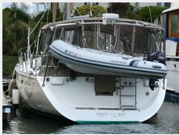
IMG_2329 - Copy