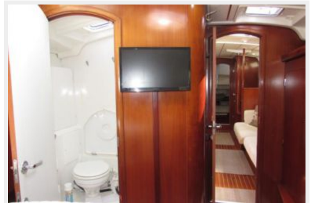
Forward cabin looking aft