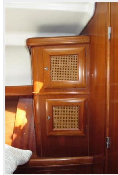
Custom storage starboard