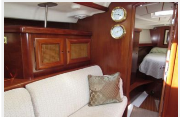
Port settee, storage, clock, barometer