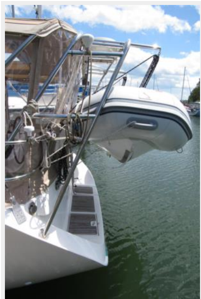
Arch & davits