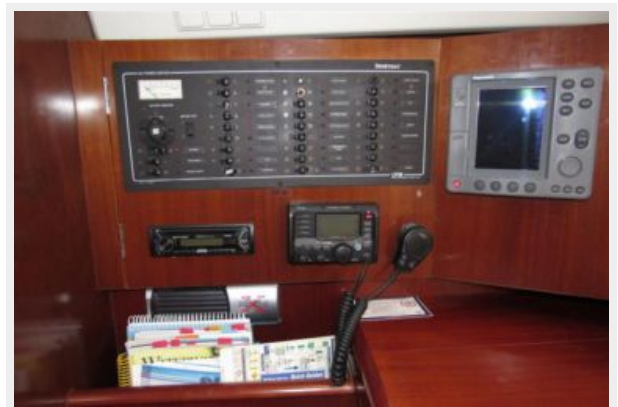
Electrical panel and electronics