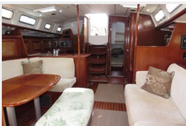
Salon looking aft