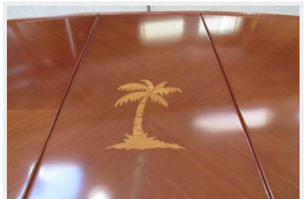
Tommy Bahama inlay in dining table insert