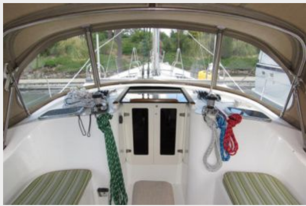
Companionway with Zarcor doors & winches on coachroof