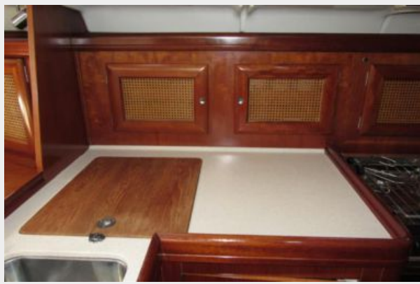
Teak Freezer top