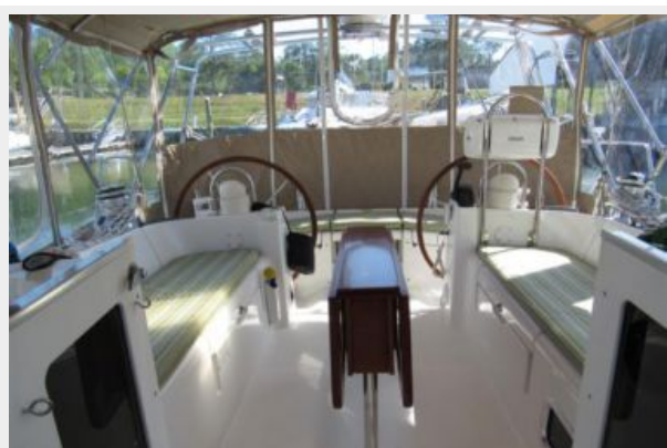
Cockpit & full enclosure from companionway