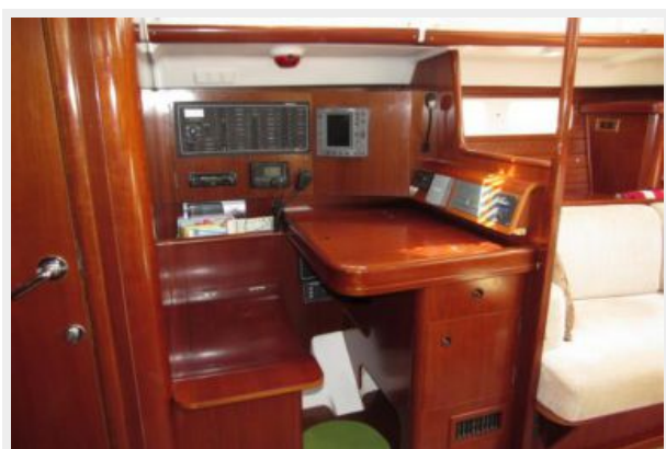
IMG_9220 - Copy (2)