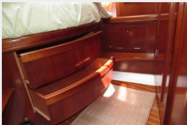
Storage in forward cabin