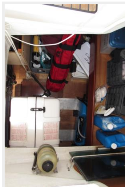
Cockpit storage locker