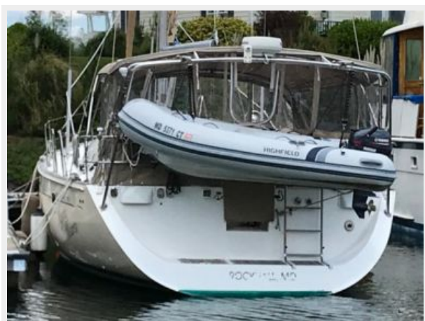
IMG_2329 - Copy