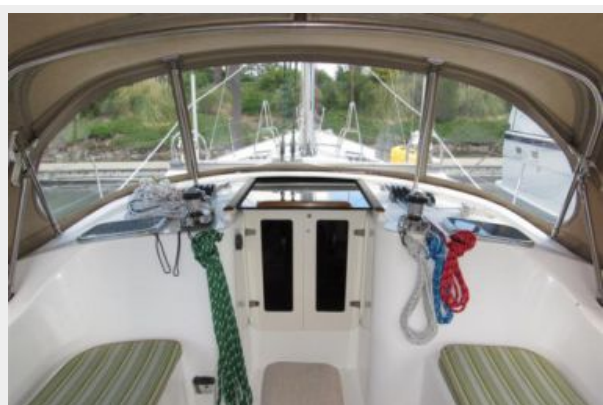
Companionway with Zarcor doors & winches on coachroof