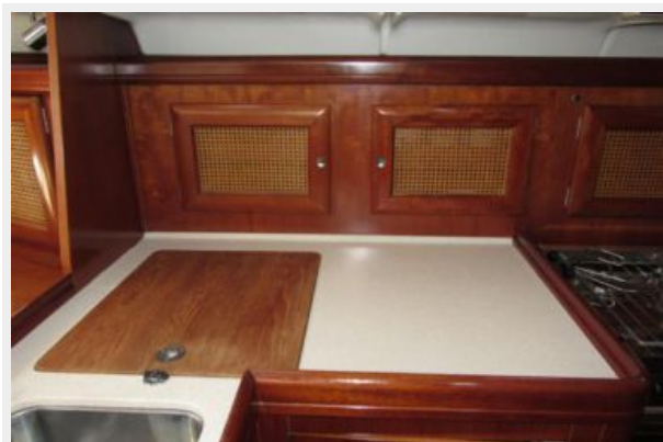
Teak Freezer top