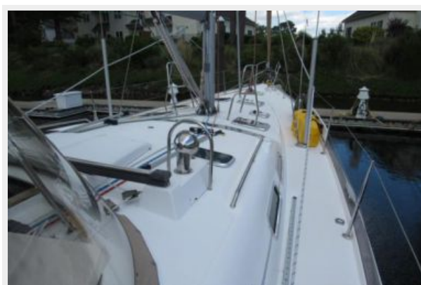
Starboard side deck