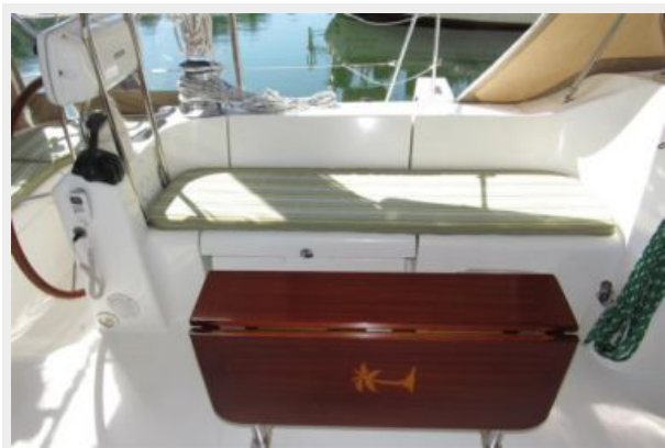
Port cockpit seating and table with leaves down