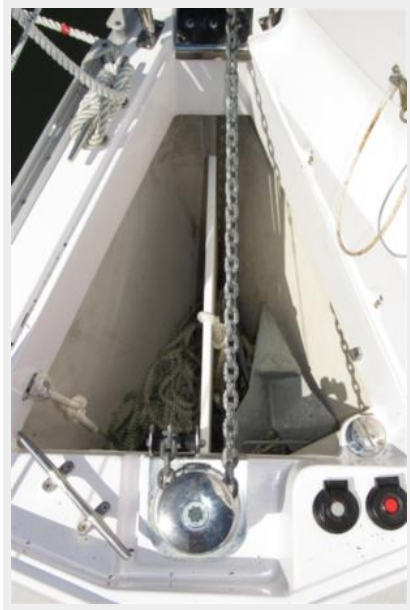
Anchor locker and windlass