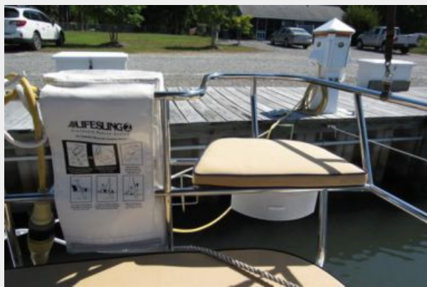
Perch seat on stern rail & lifesling