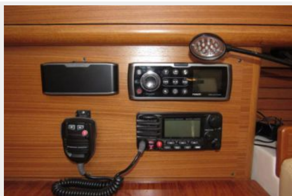
VHF & Stereo