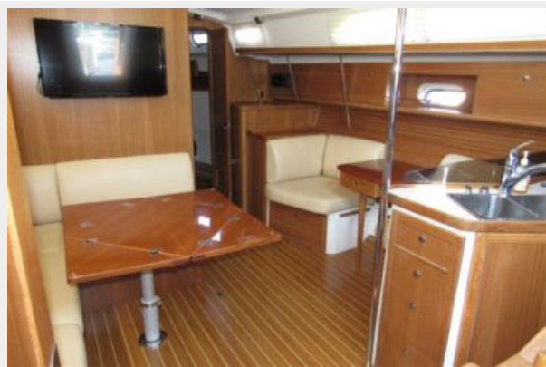
Dining table folded out