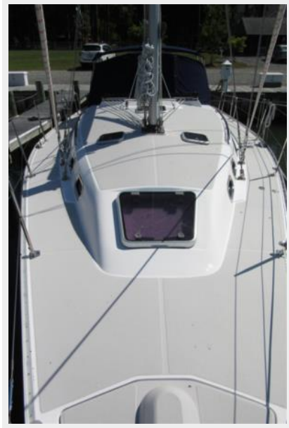
Deck from bow