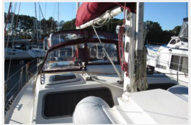
Cabin top and canvas