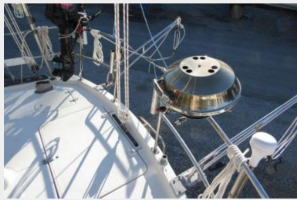
Stern rail with BBQ and davits