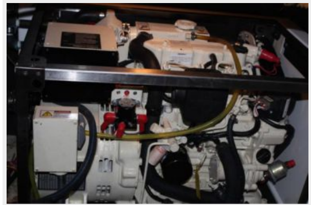
Generator with cover off