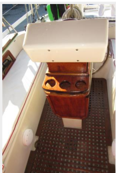
Table and cup holders