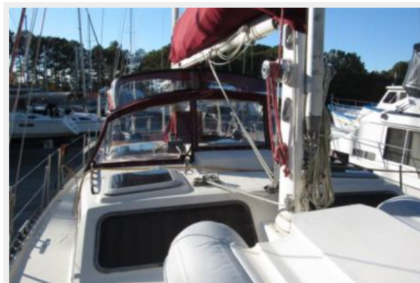
Cabin top and canvas