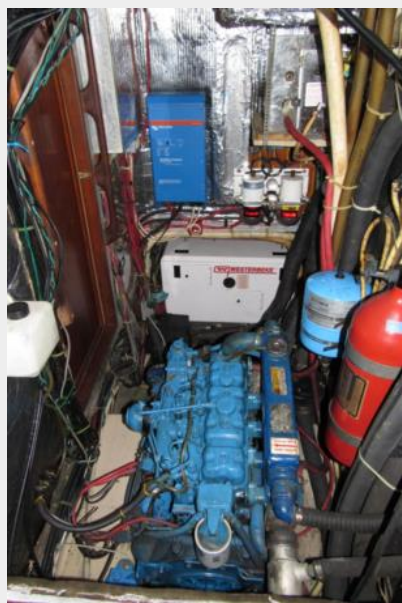
Engine room access from aft cabin