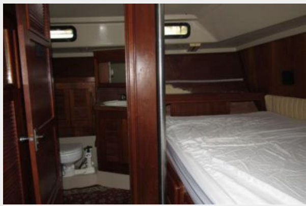
Aft cabin bunk and access to head