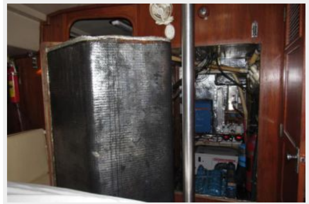
Aft cabin closet 3