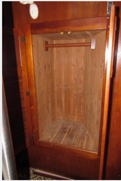
Aft cabin closet 2