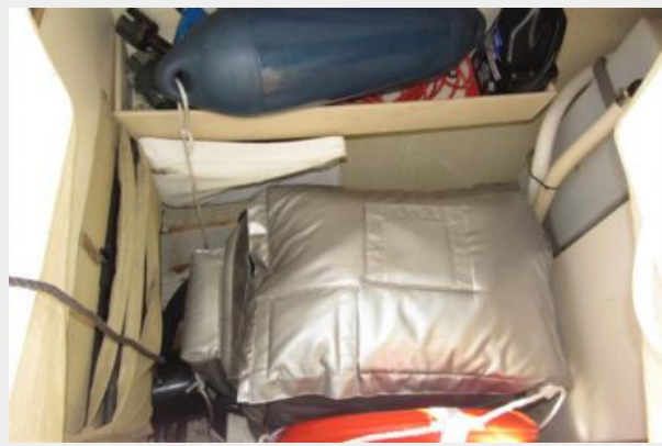
Cockpit storage and generator cover