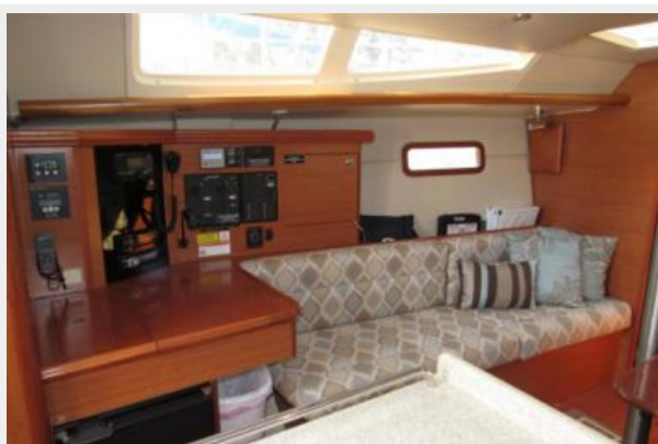
Port settee and nav station