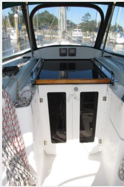
Zarcor saloon-style doors