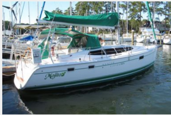
Mojito on the dock