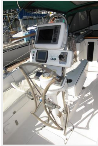
Folding wheel and pedestal