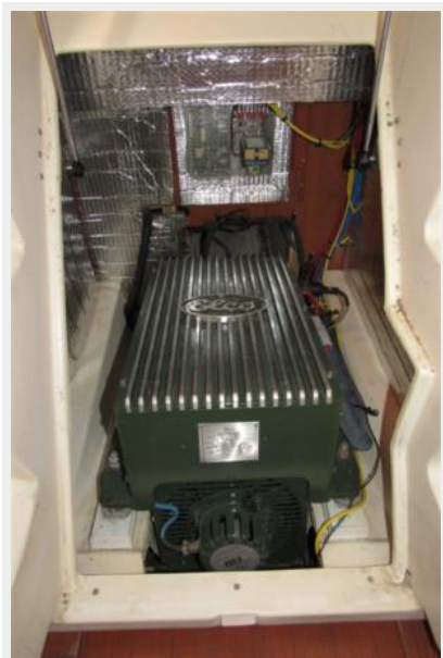
Elco Electric Engine