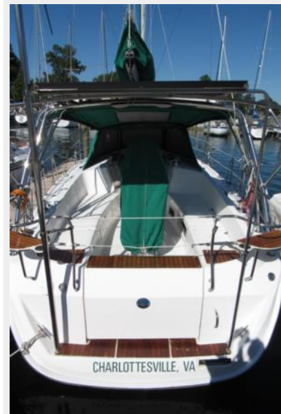
Stern, transom up