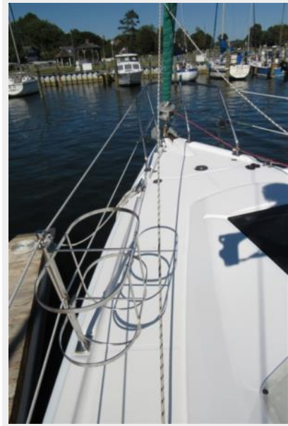
Fender holders on stanchion