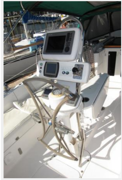
Folding wheel and pedestal