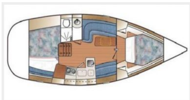
Catalina 310 layout