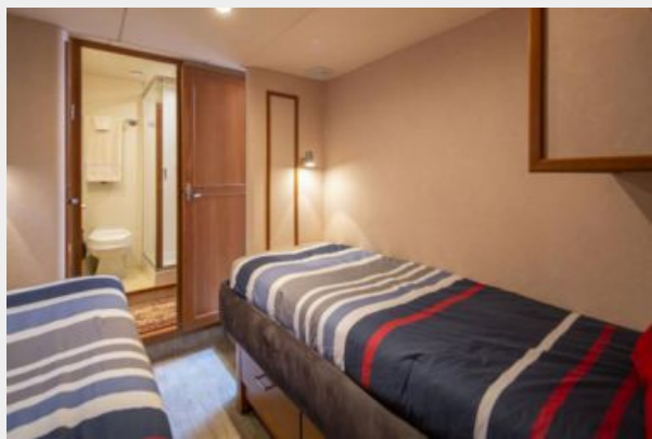
Day / Guest Head