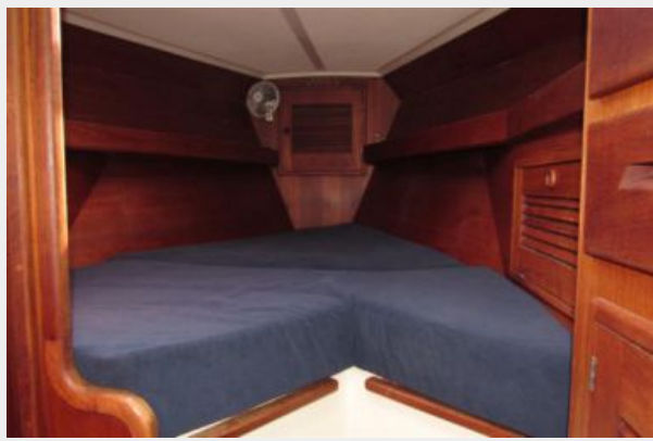
V-berth with insert removed