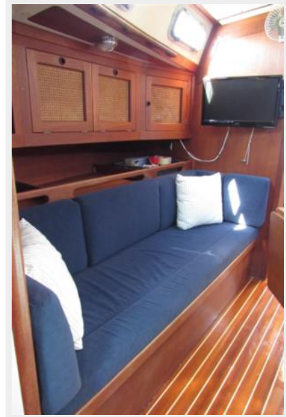
Refinished floor section in salon