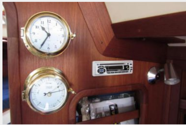
Clock, Barometer and Stereo