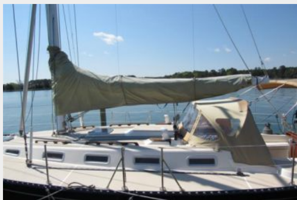
Mid deck from dock