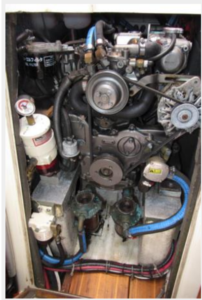
Yanmar engine - low hours