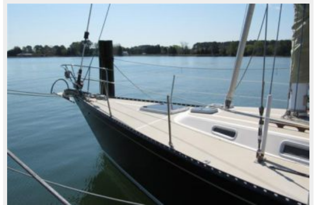
Foredeck from dock