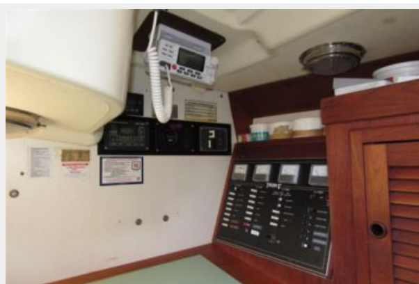
Electrical panel and electronics at nav station