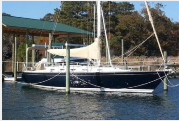
On the dock 2020