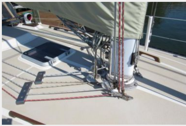
Mast base showing lines leading aft