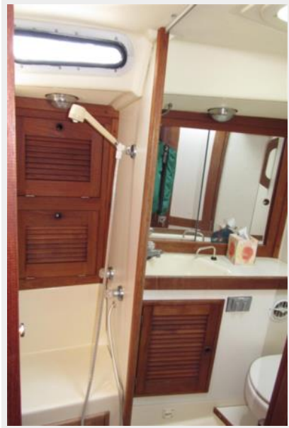
Separate shower area