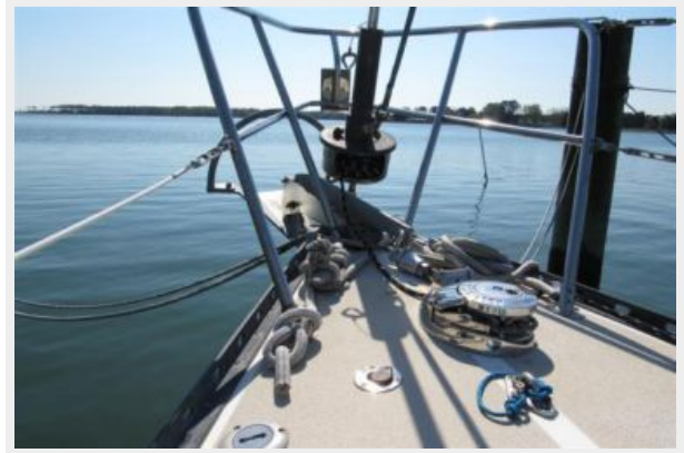
Bow & Electric Windlass