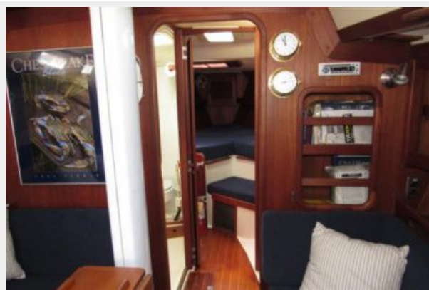
Salon, forward bulkhead and accommodations