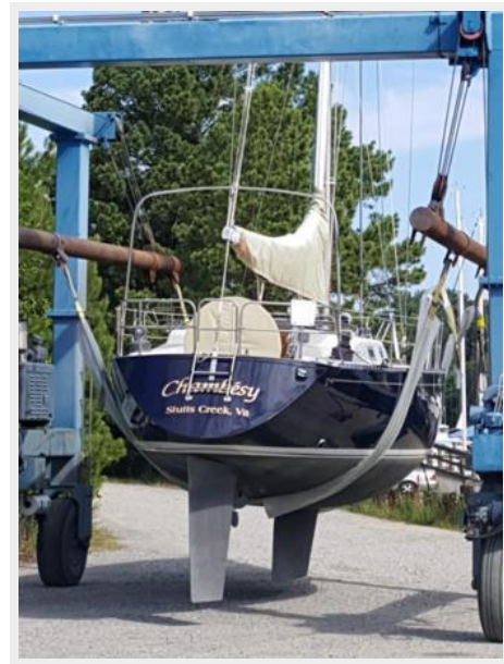
Newly painted transom 06-19