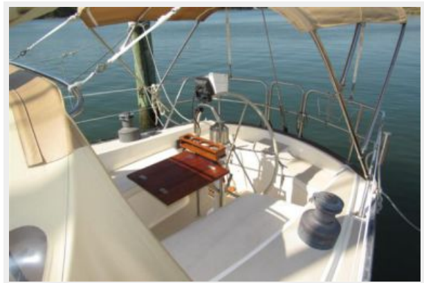
Cockpit with Table up