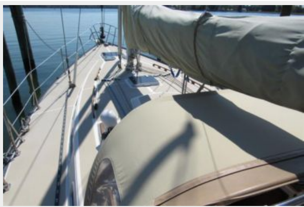
Port side deck