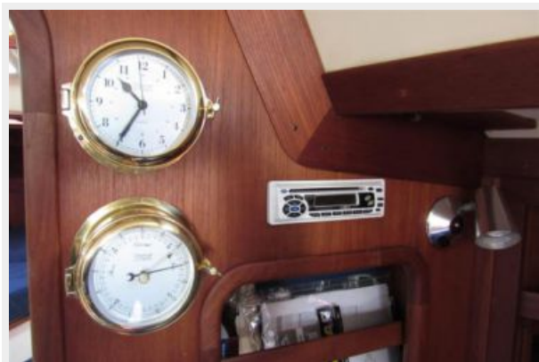
Clock, Barometer and Stereo