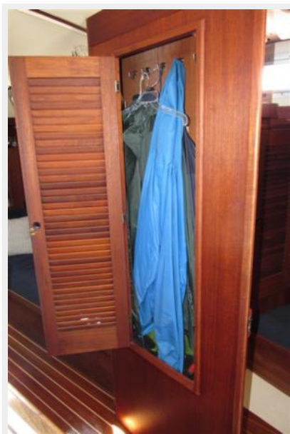
Hanging locker opposite galley