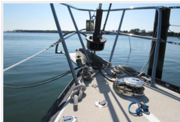
Bow & Electric Windlass