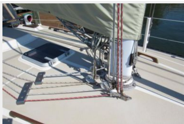
Mast base showing lines leading aft