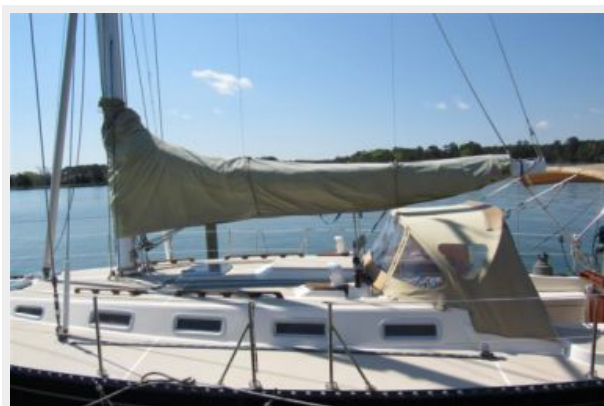
Mid deck from dock