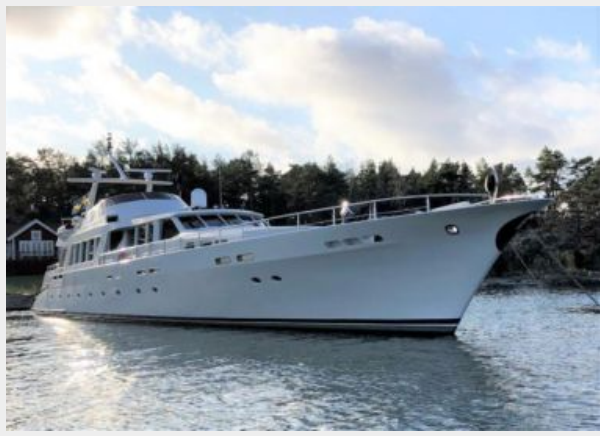
United Spirit bow