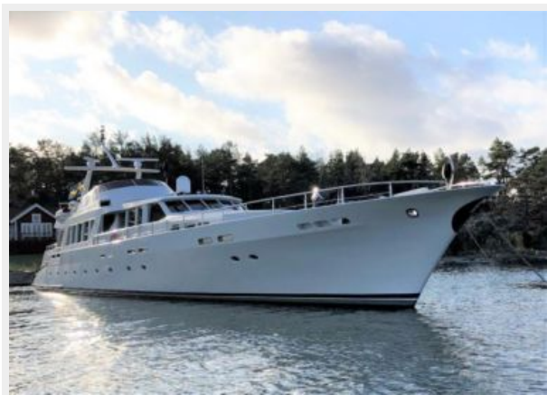
United Spirit bow