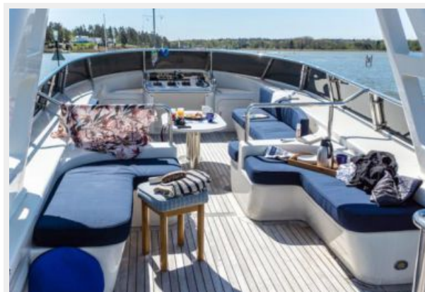
united-spirit_sundeck cushions (1)