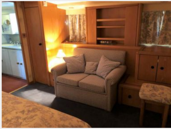
United Spirit double cabin 1