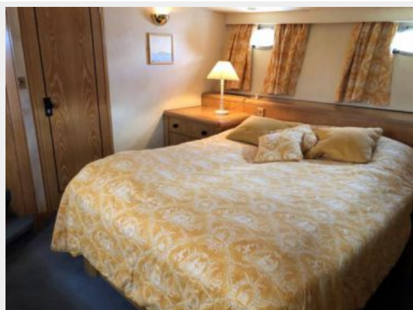
United Spirit double cabin 2