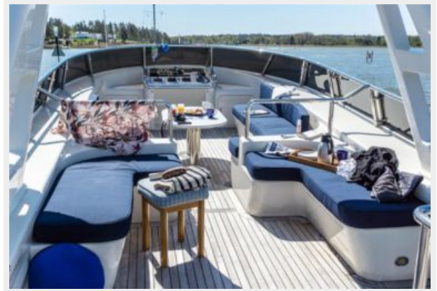
united-spirit_sundeck cushions (1)