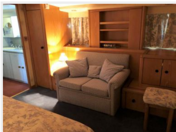
United Spirit double cabin 1