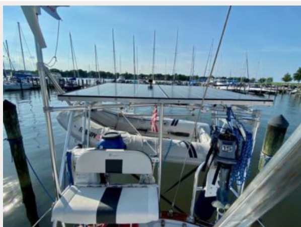
Irwin 43 MK III - Ancora Qui - 9