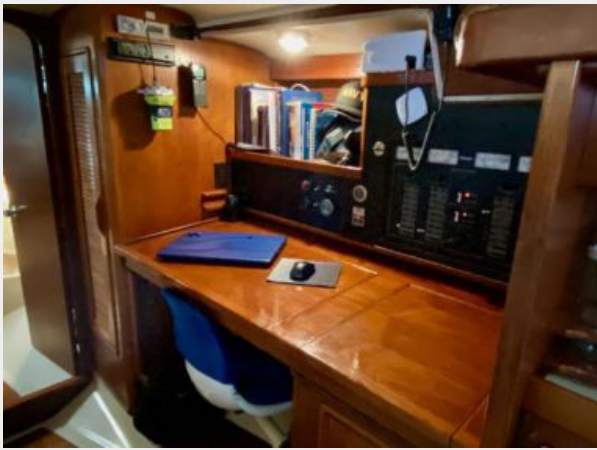
Irwin 43 MK III - Ancora Qui - 57