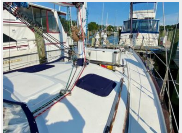
Irwin 43 MK III - Ancora Qui - 14