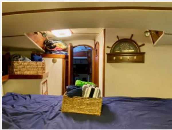
Irwin 43 MK III - Ancora Qui - 47