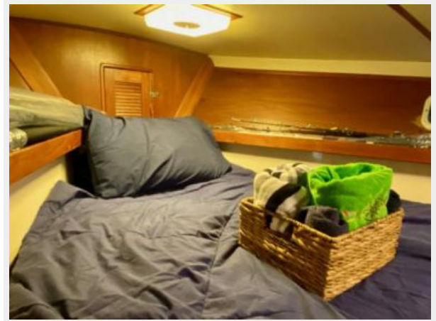
Irwin 43 MK III - Ancora Qui - 48