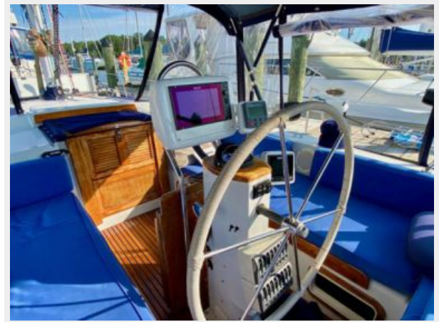
Irwin 43 MK III - Ancora Qui - 30