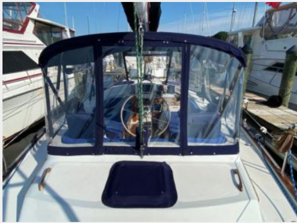
Irwin 43 MK III - Ancora Qui - 11