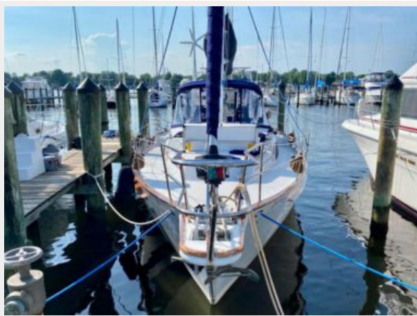
Irwin 43 MK III - Ancora Qui - 3