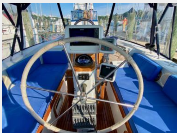
Irwin 43 MK III - Ancora Qui - 31