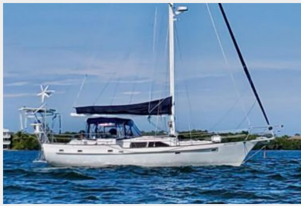
Irwin 43 MK III - Ancora Qui - 1