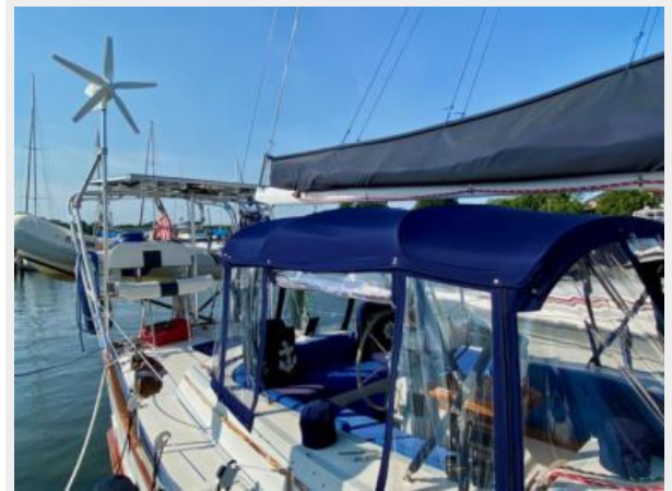
Irwin 43 MK III - Ancora Qui - 6