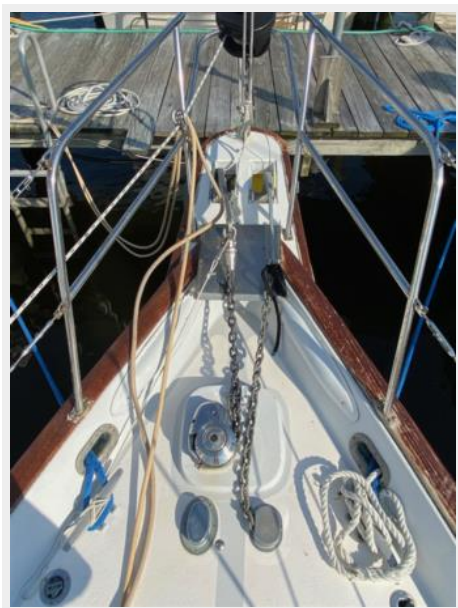
Irwin 43 MK III - Ancora Qui - 21