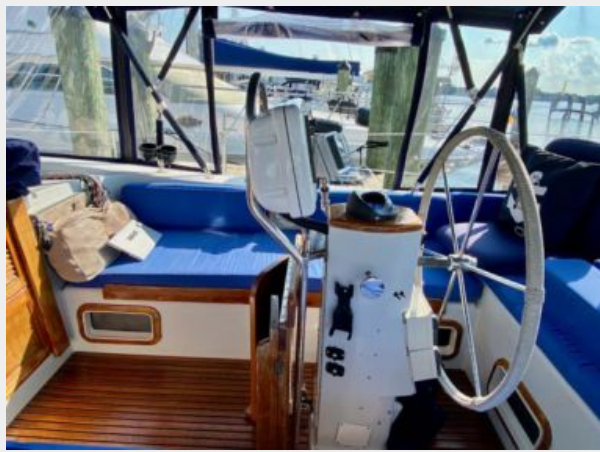
Irwin 43 MK III - Ancora Qui - 29