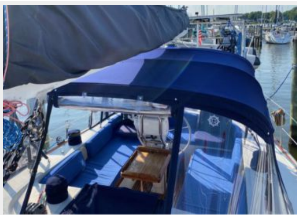
Irwin 43 MK III - Ancora Qui - 25