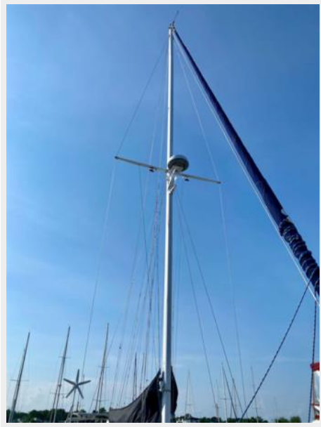
Irwin 43 MK III - Ancora Qui - 5