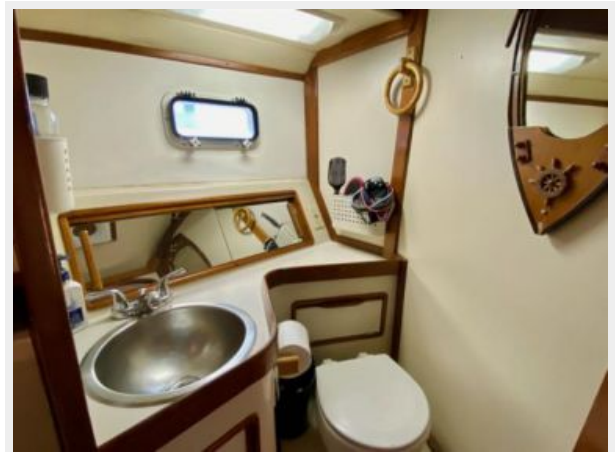
Irwin 43 MK III - Ancora Qui - 66