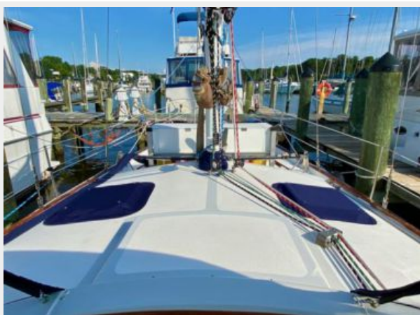
Irwin 43 MK III - Ancora Qui - 15