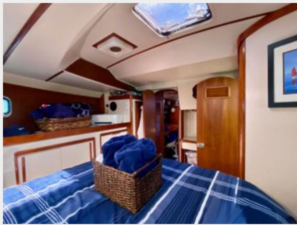
Irwin 43 MK III - Ancora Qui - 63