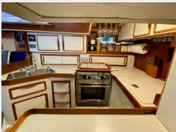
Irwin 43 MK III - Ancora Qui - 53