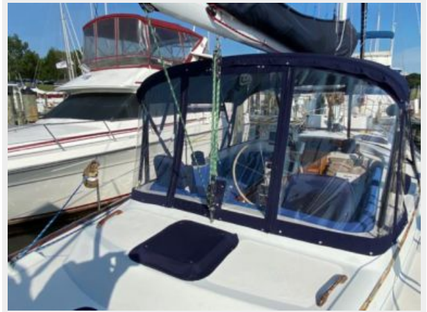
Irwin 43 MK III - Ancora Qui - 12