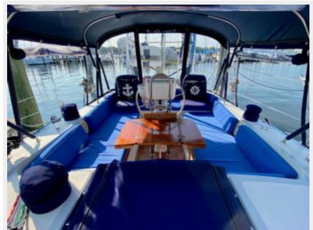
Irwin 43 MK III - Ancora Qui - 26