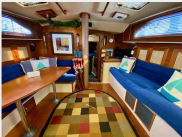
Irwin 43 MK III - Ancora Qui - 37