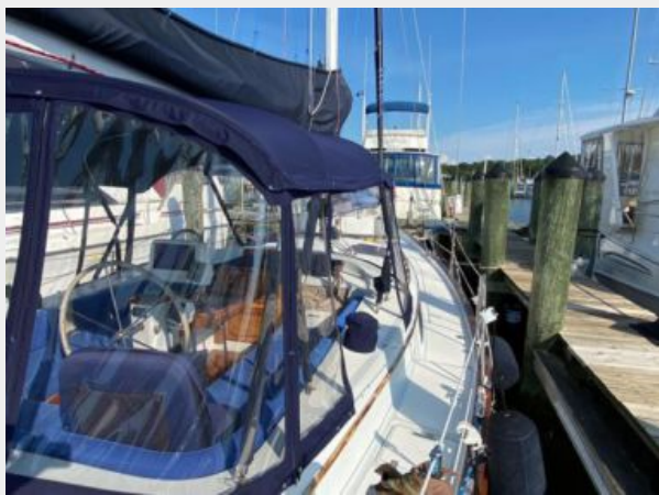
Irwin 43 MK III - Ancora Qui - 13