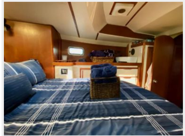
Irwin 43 MK III - Ancora Qui - 64