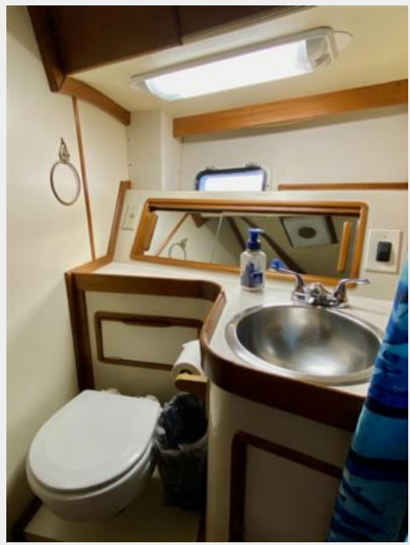
Irwin 43 MK III - Ancora Qui - 51