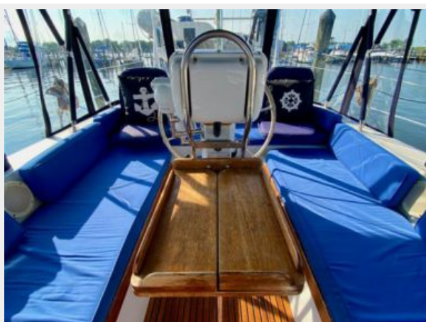
Irwin 43 MK III - Ancora Qui - 27