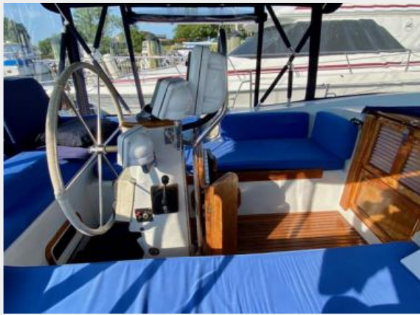
Irwin 43 MK III - Ancora Qui - 35