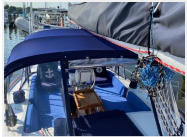
Irwin 43 MK III - Ancora Qui - 24