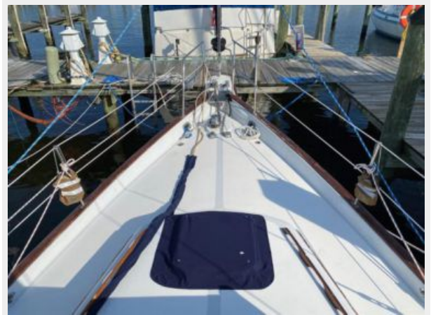
Irwin 43 MK III - Ancora Qui - 20