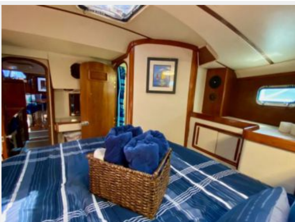
Irwin 43 MK III - Ancora Qui - 61