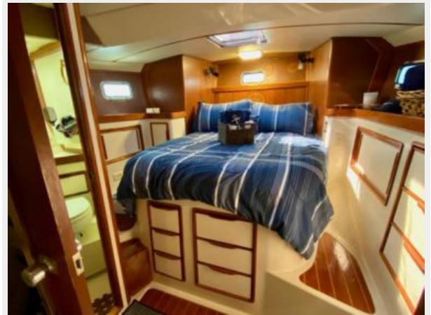
Irwin 43 MK III - Ancora Qui - 58