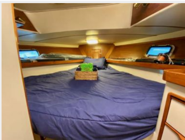
Irwin 43 MK III - Ancora Qui - 45