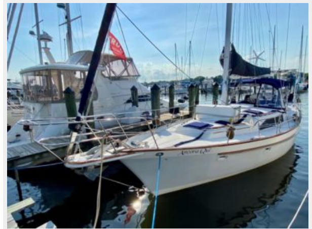
Irwin 43 MK III - Ancora Qui - 2