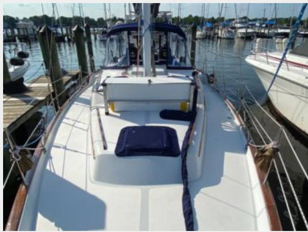
Irwin 43 MK III - Ancora Qui - 23