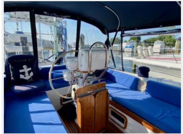
Irwin 43 MK III - Ancora Qui - 36