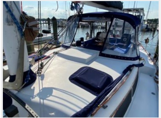
Irwin 43 MK III - Ancora Qui - 18