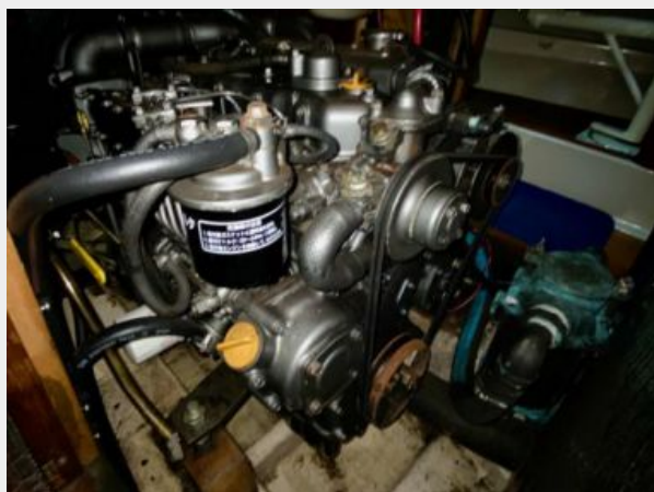
Irwin 43 MK III - Ancora Qui - 71