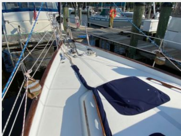
Irwin 43 MK III - Ancora Qui - 19