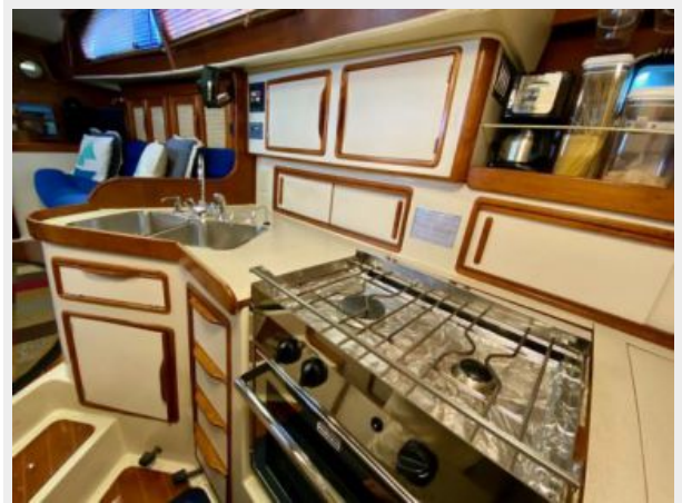
Irwin 43 MK III - Ancora Qui - 54