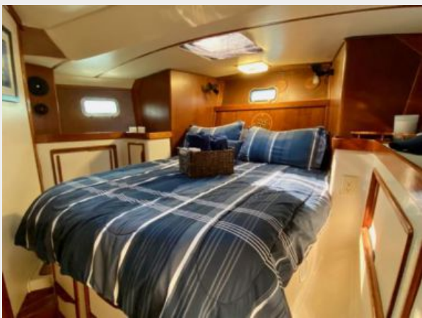
Irwin 43 MK III - Ancora Qui - 59