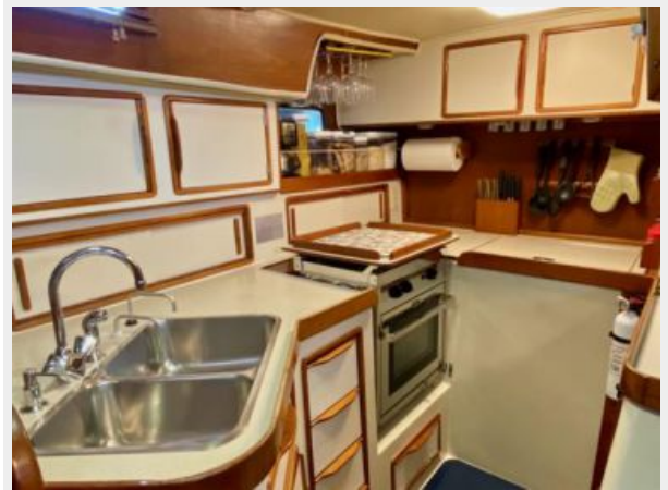
Irwin 43 MK III - Ancora Qui - 52