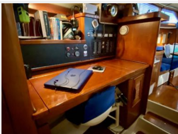
Irwin 43 MK III - Ancora Qui - 55