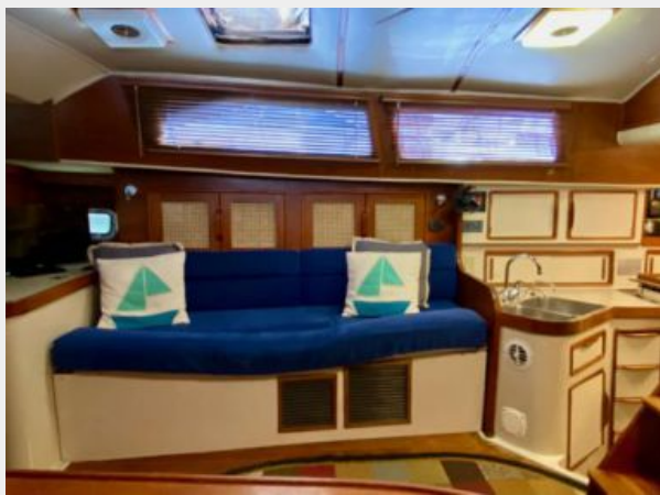
Irwin 43 MK III - Ancora Qui - 43