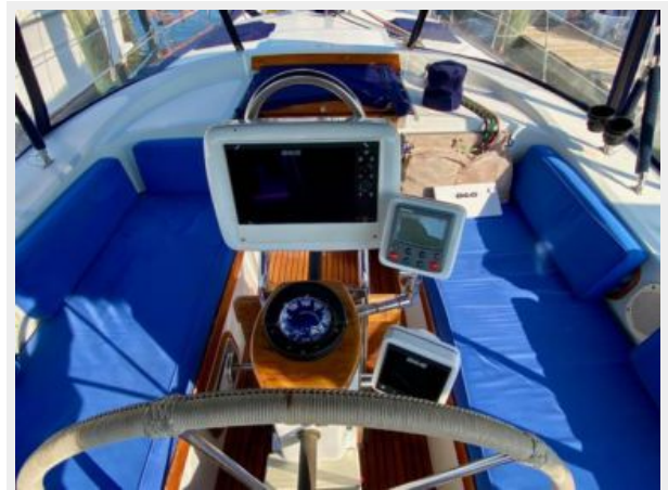
Irwin 43 MK III - Ancora Qui - 32