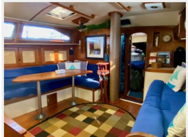
Irwin 43 MK III - Ancora Qui - 38