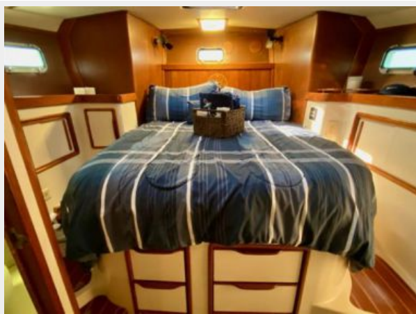
Irwin 43 MK III - Ancora Qui - 65