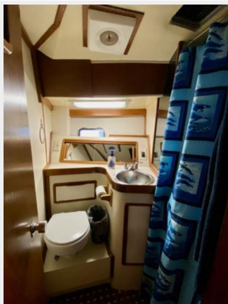
Irwin 43 MK III - Ancora Qui - 49