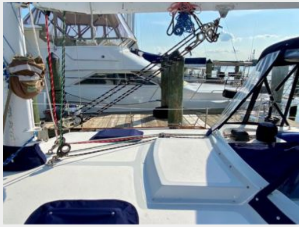
Irwin 43 MK III - Ancora Qui - 17