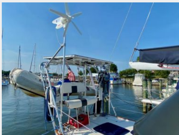
Irwin 43 MK III - Ancora Qui - 7