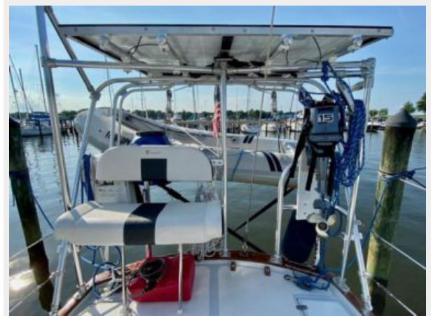
Irwin 43 MK III - Ancora Qui - 8