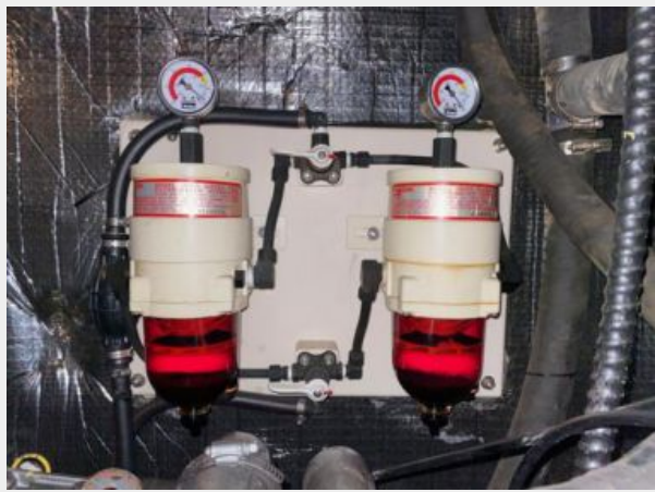
Irwin 43 MK III - Ancora Qui - 73