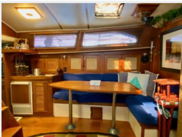
Irwin 43 MK III - Ancora Qui - 39