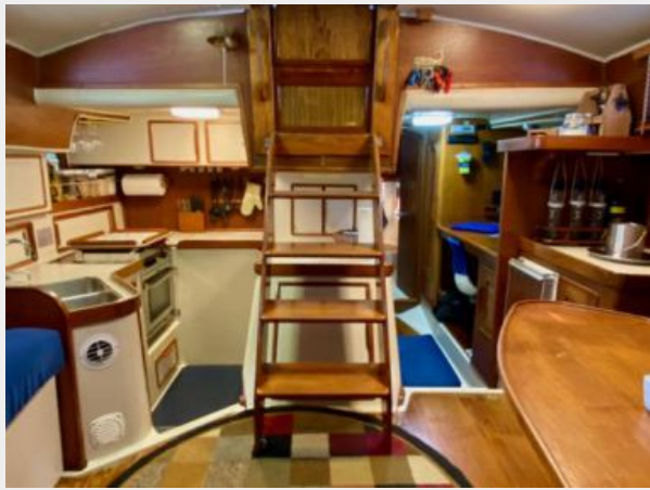
Irwin 43 MK III - Ancora Qui - 41