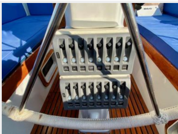
Irwin 43 MK III - Ancora Qui - 33