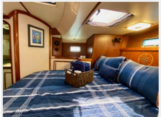
Irwin 43 MK III - Ancora Qui - 60