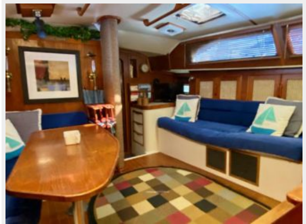
Irwin 43 MK III - Ancora Qui - 44