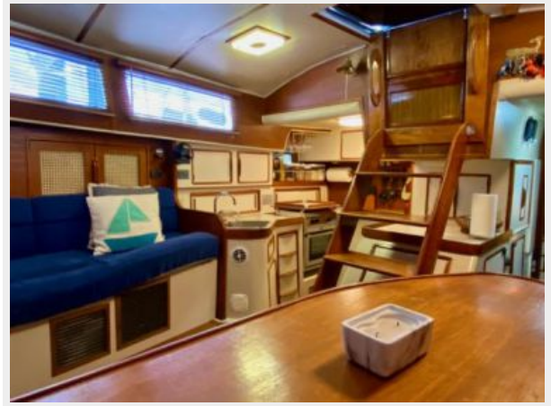
Irwin 43 MK III - Ancora Qui - 42