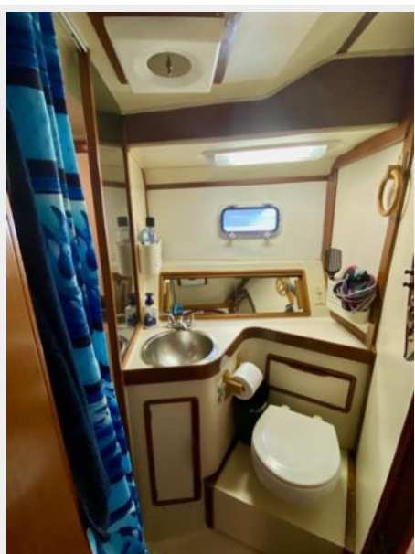
Irwin 43 MK III - Ancora Qui - 67