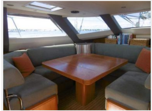
Truly raised salon seating with wonderful panoramic views