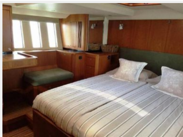
A stunning master stateroom with great headroom