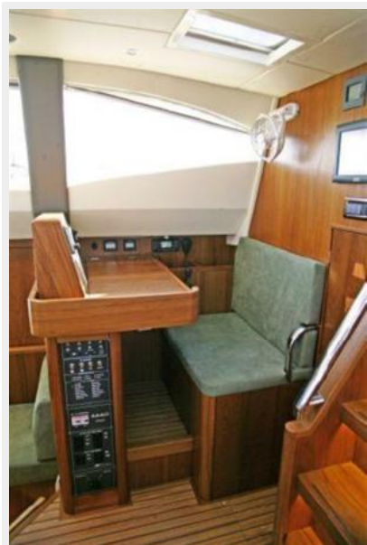
Raised nav where you can see where you are going