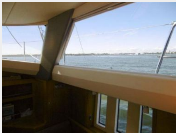
Amazing visibility from the large salon windows