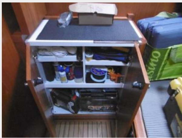
Third cabin cabinet converts to work bench with storage