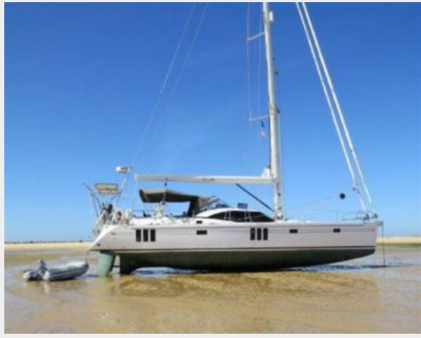
Southerly Yachts Designed to be able to dry out upright