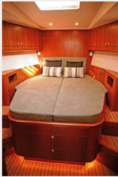
A very comfortable stateroom forward that your guest will really enjoy.