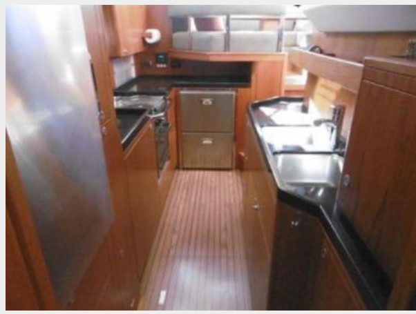
Galley is lower providing less motion at sea