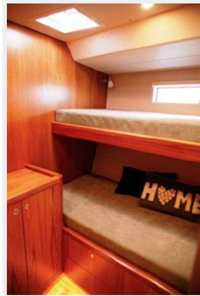
Third cabin with storage under berth