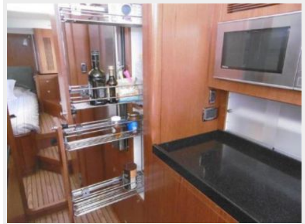
A lot of well planned storage including a pull out pantry