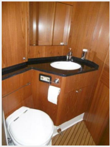
Private ensuite head