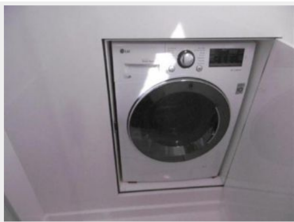
Washer dryer with door in shower