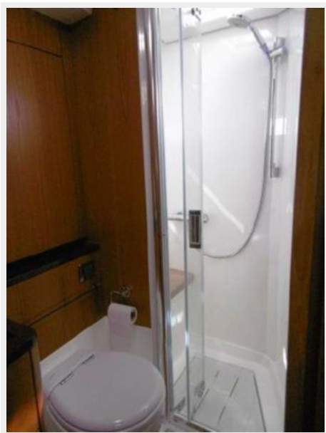
Forward shower has seating and hatch