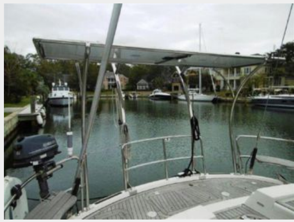
Aft deck with designer custom arch