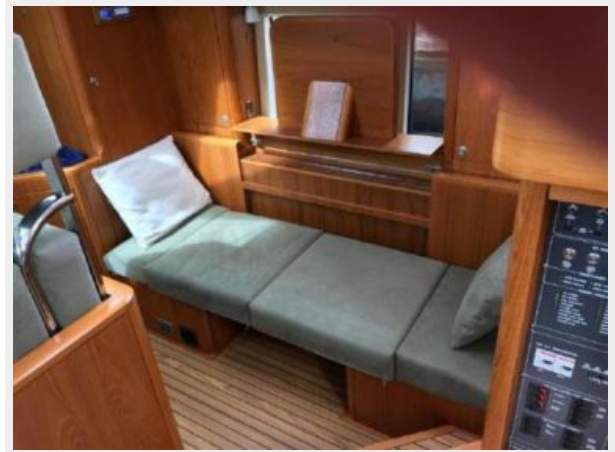
Seating area converts to a sea berth