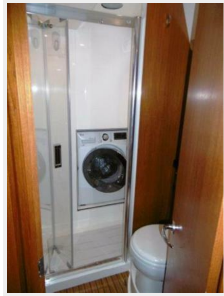
Separate shower with door