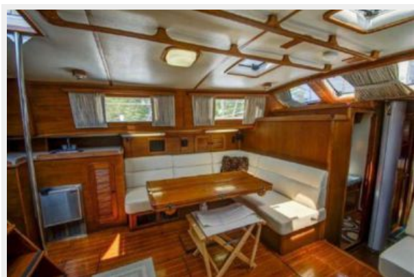
PORT SIDE MAIN SALOON