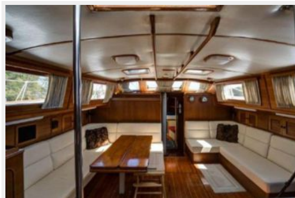
MAIN SALOON FWD