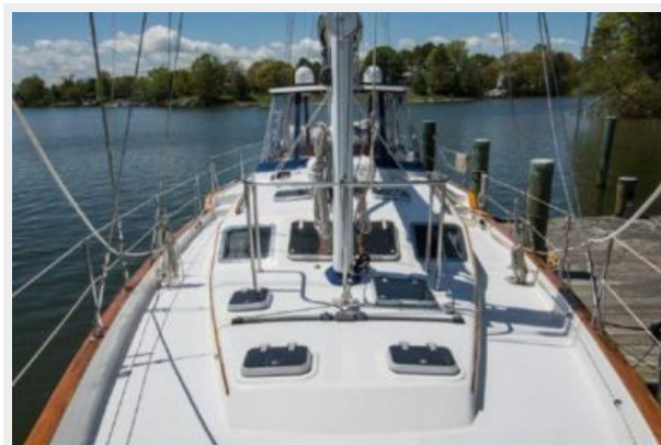
DECK VIEW AFT