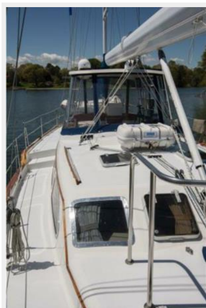
HARDTOP AND ENCLOSURE