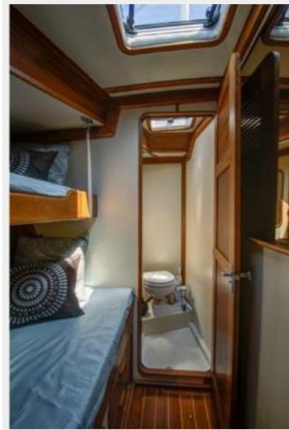
GUEST CABIN W/HEAD, FWD