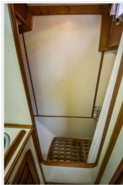
OWNER'S CABIN HEAD, SHOWER STALL