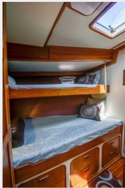
GUEST CABIN 1, PORTSIDE