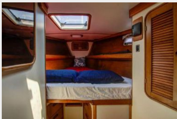
GUEST CABIN 2 FWD