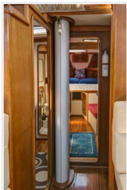
VIEW FORWARD FROM SALOON